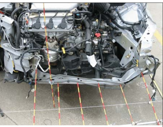
Figure 6: Leftward shift of case vehicle's front unibody frame members

The case vehicle's recommended tire size was: P205/60R16 and the vehicle was equipped with tires of this size. The case vehicle's tire data are shown in the table below.