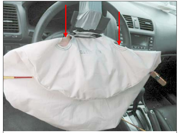
Figure 12: Case vehicle driver's air bag vent ports

inches) in diameter, located at the 9 and 3 o'clock positions ( Figure 12 ). The distance between the mid-center of the driver's seat back, as positioned at the time of the inspection (i.e., approximately between the middle and rear-most track position), and the front surface of the air bag fabric at full excursion was 45 centimeters (17.7 inches). A small area of very light scuffing was found on the upper right quadrant of the air bag that appeared to be related to the interaction