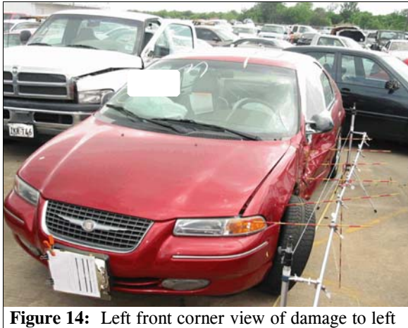
Figure 14: Left front corner view of damage to left side of Chrysler from impact with case vehicle

The 1999 Chrysler Cirrus LXi was a front wheel drive, four-door sedan (VIN: 1C3EJ56H2XN-----) equipped with a 2.5L, V6 engine and four-speed, automatic transmission. The Chrysler was equipped with driver and front right passenger air bags which deployed as a result of the impact with the case vehicle. The Chrysler's wheelbase was 274 centimeters (107.9 inches).