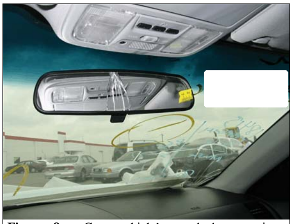
Figure 8: Case vehicle's cracked rear view mirror, yellow tape identifies a small smudge area on the mirror

Damage Classification: The front bumper, hood, and fenders had been removed from the case vehicle and were not present at the inspection; however, based on the damaged components remaining on the case vehicle and the damage profile on the Chrysler, this contractor determined