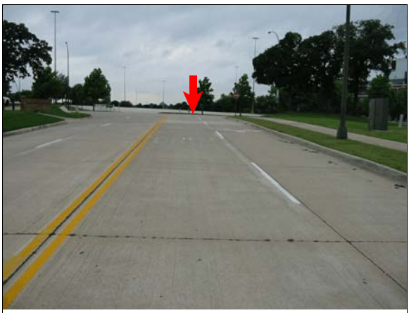
Figure 1: Overview of case vehicle's approach northwest-bound to intersection, arrow shows area of the crash, case vehicle stopped at stop sign

Pre-Crash: The case vehicle was northwest-bound and was stopped at the stop sign in the outside lane ( Figure 1 ). The driver proceeded into the intersection intending to continue northwest, straight through the intersection into a sports stadium parking lot. The Chrysler was traveling southwest in the left inside lane ( Figure 2 ), and the driver was intending to continue through the intersection and continue southwest. The case vehicle's driver stated he took no actions to avoid the crash. The crash occurred within the intersection of the two trafficways.