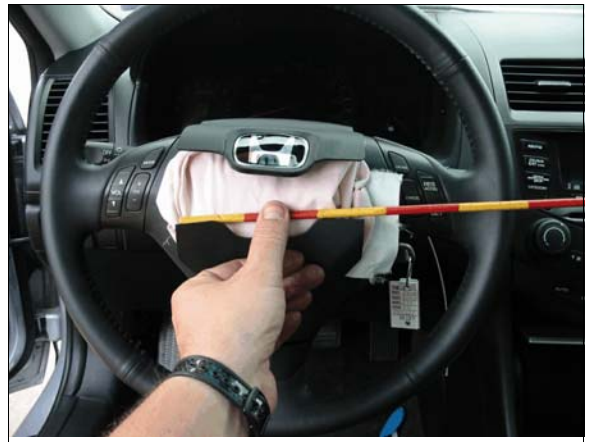
Figure 10: Case vehicle driver's air bag module cover flaps

The case vehicle's driver air bag was located in the steering wheel hub. An inspection of the air bag module cover flaps and the air bag fabric revealed that the cover flaps opened at the designated tear points (Figure 10). There was no evidence of damage during the deployment to the air bag module cover flaps. The top module cover flap was approximately rectangular in shape with a rounded contour in the center of the flap that accommodated the Honda emblem. The top cover flap was 13.5 centimeters (5.3 inches) in width and 7 centimeters (2.8 inches) in height. The bottom module cover flap was approximately triangular in shape with a rounded concave contour in the center of the flap that accommodated the Honda emblem on the top flap. The bottom module cover flap was 13.5 centimeters (5.3 inches) in width at its widest point and 7 centimeters (2.8 inches) in height. The deployed driver's air bag (Figure 11) was round with a diameter of approximately 60 centimeters (23.6 inches). The air bag was designed with two tethers, each approximately 7 centimeters (2.8 inches) in width and had two vent ports, each approximately 5 centimeters (2.0