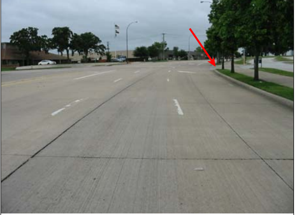
Figure 2: Approach of Chrysler's southwest-bound in inside through-lane, arrow shows location of driveway case vehicle was attempting to enter