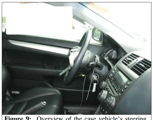
Figure 9: Overview of the case vehicle's steering wheel and steering column showing no evidence of deformation or loading

that a CDC could be reasonably estimated. The CDC was estimated to be 82-FDEW-1 ( 50 degrees). The CDC force direction was incremented because both front unibody frame members were shifted to the left beyond the 10 centimeter (4 inch) threshold.