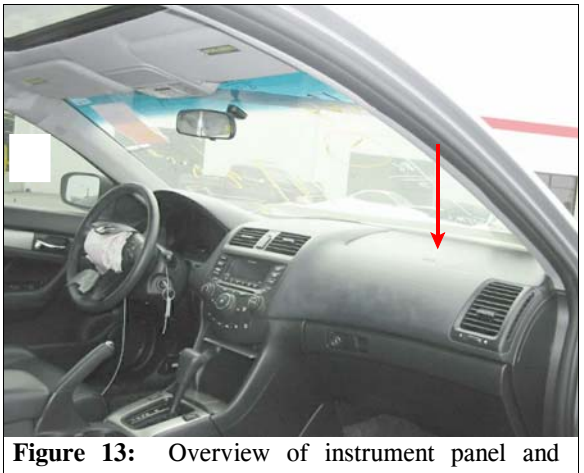
location of front right passenger air bag (arrow)

The case vehicle's ECU was harvested and