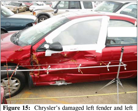
Figure 15: Chrysler's damaged left fender and left front door from impact with case vehicle

Exterior Damage: The Chrysler's impact with the case vehicle involved the left fender, left front wheel and left front door (Figures 14 and 15). The direct damage began 118 centimeters (46.5 inches) forward of the left rear axle and extended 203 centimeters (80 inches) forward along the left side of the Chrysler. Crush measurements were taken at the mid-door level, and the maximum residual crush was measured as 10 centimeters (3.9 inches) occurring at C_2 and C_3 The table below shows the Chrysler's left side crush profile.