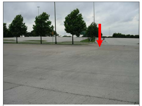
Figure 5: Overview of trees on southwest corner of intersection and parking lot driveway case vehicle was attempting to enter is on right, arrow shows case vehicle's area of final rest