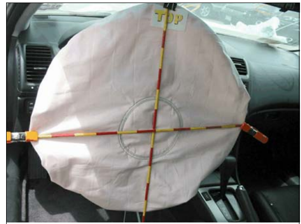
Figure 11: Case vehicle driver's air bag