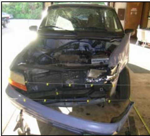
Figure 3. Frontal damage to the 1994 Dodge Caravan.

The 1994 Dodge Caravan sustained moderate severity frontal damage as result of the initial impact with the Ford ( Figure 3 ). The damaged components included the hood, bumper fascia and bumper beam, left headlamp assembly, upper radiator support, and the front fenders. Additionally, the front structure of the vehicle was shifted to the right. The left frame rail was displaced 14 cm (5.5") to the right while the right rail was displaced 17 cm (6.5"). Maximum crush was 15 cm (5.9"), and was located at the left corner of the bumper beam. The direct contact damage began 10 cm (3.9) right of the vehicle's centerline and extended 89 cm (35.2") to the left bumper corner. A crush profile was documented along the full width of the deformed bumper beam which measured 130 cm (51.25"). The crush profile consisted of six equidistant crush measurements that were as follows: C1 = 11 cm (4.3"), C2 = 12 cm (4.7"), C3 = 15 cm (5.9"), C4 = 12 cm (4.7"), C5 = 4 cm (1.6"), C6 = 2 cm (0.8"). The Collision Deformation Classification (CDC) for this impact was 71-FYEW-1 with an incremented shift value of 60 added to the 11 o'clock direction of force.