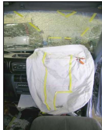
Figure 8. Front right air bag and contact evidence.

The right front air bag membrane measured 48 cm (19”) in width and 55 cm (21.5”) in height ( Figure 8 ). The bag was tethered by two 32 cm (12.5”) wide band tethers that were sewn to the face of the membrane and spaced 28 cm (11”) apart. The air bag membrane was cut from the module by the investigating police officer prior to this SCI investigation. The bag was repositioned by the SCI investigator for proper documentation. Blue fabric