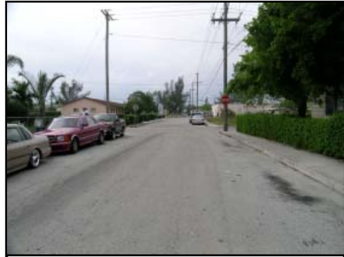
Figure 2. Pre-crash trajectory of the Dodge. Note: Stop sign was not present at the time of the crash.

The 38-year-old female driver was operating the 1994 Dodge Caravan in a westerly direction approaching the four-leg intersection ( Figure 2 ). A 34-year-old female was operating the 1996 Ford Windstar northbound approaching the intersection from the Caravan's left. The east/westbound legs of the intersection were controlled by stops signs; however, the stop sign that was located on the east leg was stolen two-days prior to the crash and was not replaced. The driver of the Dodge proceeded into the intersection as though it was an uncontrolled intersection for her path of travel. As she detected the approaching Ford, the driver of the Caravan applied a braking force prior to impact. There was no pre-crash evidence (i.e. skid marks) present at the crash site