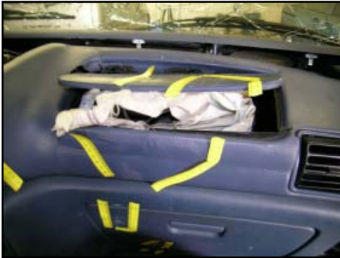
Figure 5. Occupant contact points to the air bag module cover, mid panel, and the glove box door.

Additional occupant contact points were documented to the front right air bag. These are described in the Air Bag Section of the report. Figures 5 and 6 are overall views of the occupant contact points to the front right area.