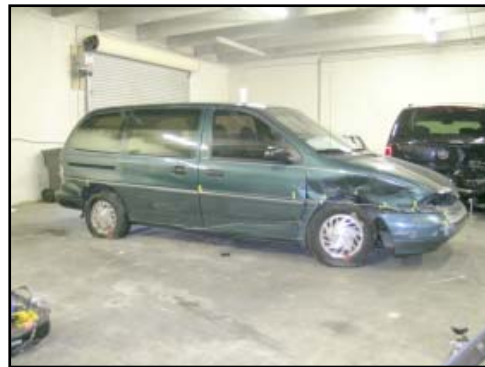
Figure 7. Overall view of the right side damage.

The 1996 Ford Windstar sustained moderate severity damage to the right side from the impacts with the Dodge ( Figure 7 ). The initial impact involved the right side with the direct contact damage beginning 29 cm (11.5") forward of the rear axle and extended 371 cm (146.0") forward to the right front bumper corner. The maximum crush was 19 cm (7.6") and was located on the fender 45 cm (17.75") forward of the left A-pillar. The crush profile was documented at the mid-level and was as follows: C1 = 0 cm, C2 = 5 cm