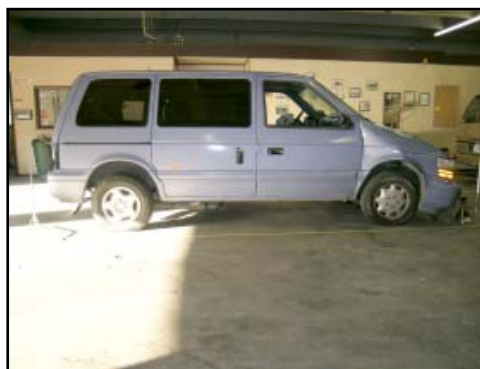
Figure 1. Subject vehicle 1994 Dodge

This on-site investigation focused on the severity of the crash and the source of injury that caused the death of an unrestrained 5-year-old female front right passenger of a 1994 Dodge Caravan ( Figure 1 ). The Dodge was equipped with first generation frontal air bags for the driver and front right positions that deployed as a result of an intersection crash with a 1996 Ford Windstar. The Dodge was occupied by an unrestrained 38-year old female driver, the unrestrained 5-year-old female front right passenger, and a 1-year-old male rear left