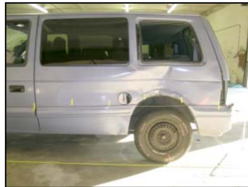
Figure 4. Left rear damage from the secondary impact.