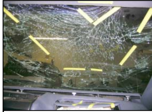
Figure 6. Front right passenger contacts to the windshield.