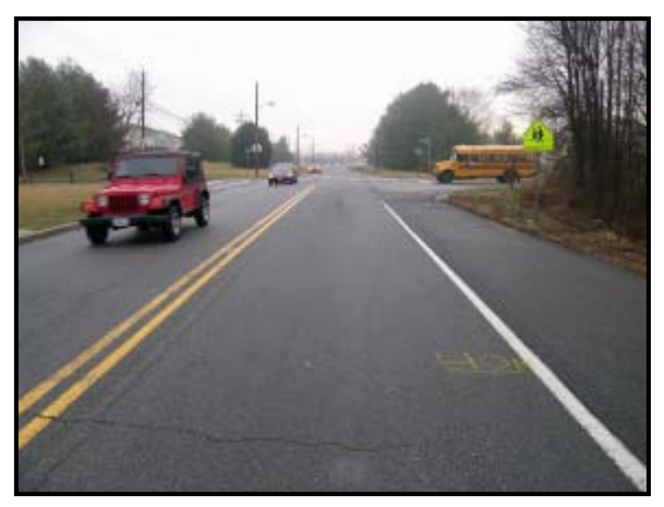
Figure 3: Eastbound trajectory view.