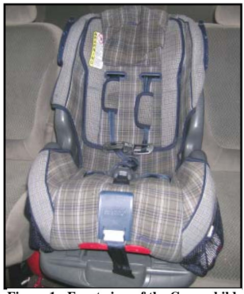
Figure 1: Front view of the Cosco child safety seat.

This on-site investigation focused on the performance of a Cosco Eddie Bauer Child Safety Seat (CSS) installed in a forward facing mode in the center rear position of a 2000 Ford Expedition, Figure 1 . The Ford Expedition was involved in an intersection crash with a 1990 Chrysler New Yorker. The Cosco CSS was occupied by a 4 year old male at the time of the crash. The 36 year old female driver of the Ford failed to yield the right-of-way at the intersection resulting in the impact. The restrained driver of the Ford sustained police reported possible injuries and the child passenger sustained reported non-incapacitating injuries. Both occupants were transported to a local hospital. The 23 year old unrestrained male driver of the Chrysler sustained a police reported disabling injury and was transported to a local hospital.