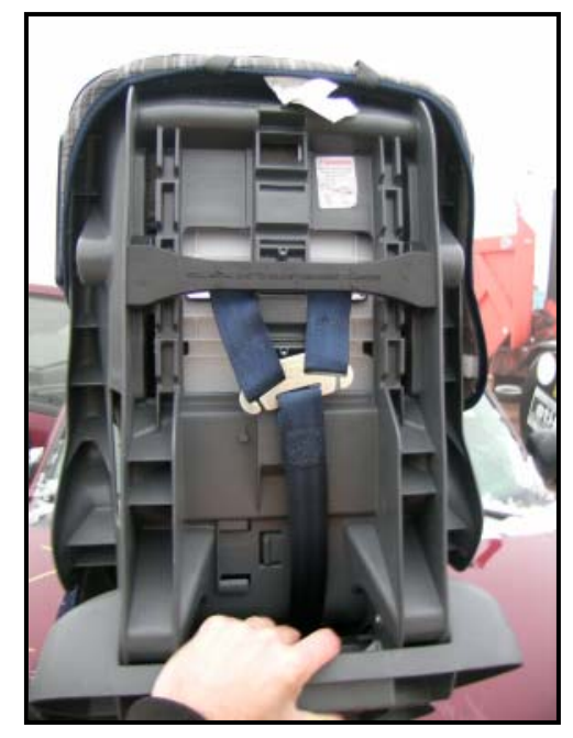
Figure 13: Back view of the CSS.

The CSS was designed with a three position adjustable base and a 5-point harness. The seat was adjusted to the middle position at the time of inspection. The angle of the seat measured 30 degrees. The shell would not lock into the most upright adjustment position. The 5-point harness consisted of two shoulder straps, a two piece chest clip, two upper thigh straps, and a crotch buckle. The height of the shoulder straps had a five position adjustment located on the back of the shell, Figure 13 . The shoulder straps were adjusted to the mid-position. This adjustment also controlled the height of the head restraint. The seat was not equipped with a tether strap. The harness straps were roped throughout its path and were roped through the chest clips, Figure 14 . There was no loading evidence identified on the harness straps. The location of the chest clips measured 25 cm (10 in) below the harness slots. Referring to Figure 16 , the right (male) chest clip appeared to be have been reversed from its designed orientation at a time when the harness straps were rethreaded. When clipped together, the chest clip formed an "S" shape. By reversing the orientation of the right clip, the buckled clip would form a symmetrical arc, the more typical design.