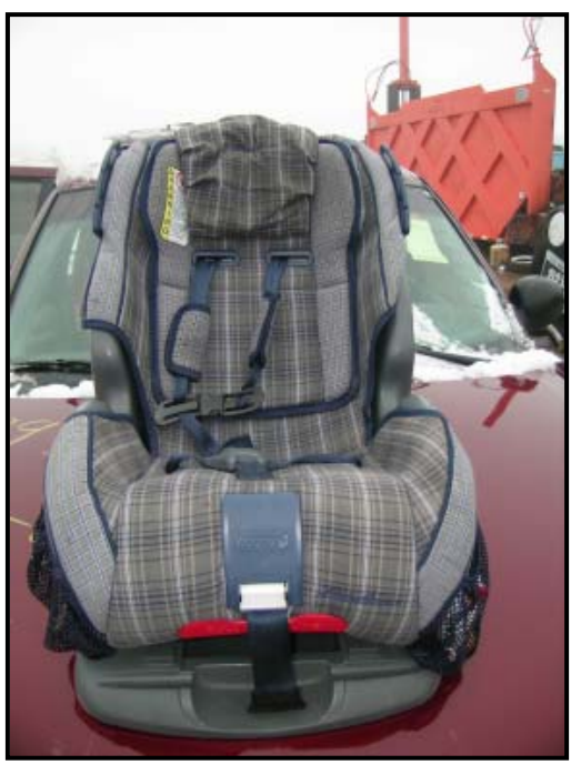
Figure 12: Front view of the CSS.

The 4 year old male was restrained in a Cosco Eddie Bauer CSS in the center position of the Ford's second row. Figure 12 is a front view of the Cosco CSS, Model No: 02-537-MET. The seat was manufactured on January 19, 2002. The seat's labeling was intact. The labels indicated the seat was for use by children with a weight and height of 2.3 kg to 36.3 kg (5.0 lb to 80.0 lb) and 48.3 cm to 129.5 cm (19 in to 51 in). The CSS was to be used in a rear-facing mode for infants up to 10 kg (22 lb), forward facing for toddlers 10 kg to 18 kg (22 lb to 40 lb), and as a belt positioning booster seat for a child 13.6 kg to 36.3 kg (30 to 80 lb). The seat's instruction manual was not present.