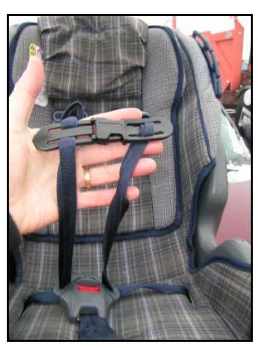
Figure 14: Close-up view the roped harness straps and chest clip.