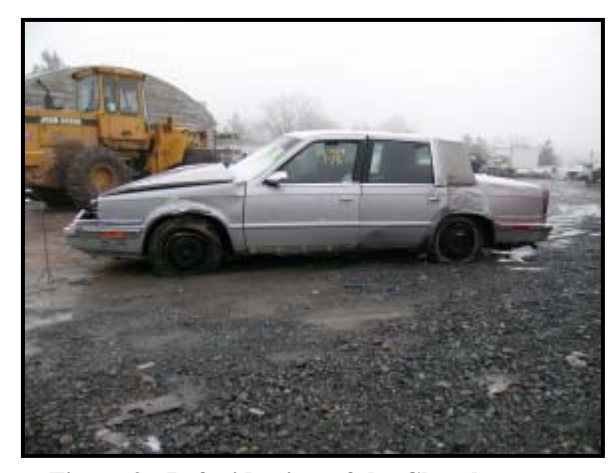
Figure 9: Left side view of the Chrysler.