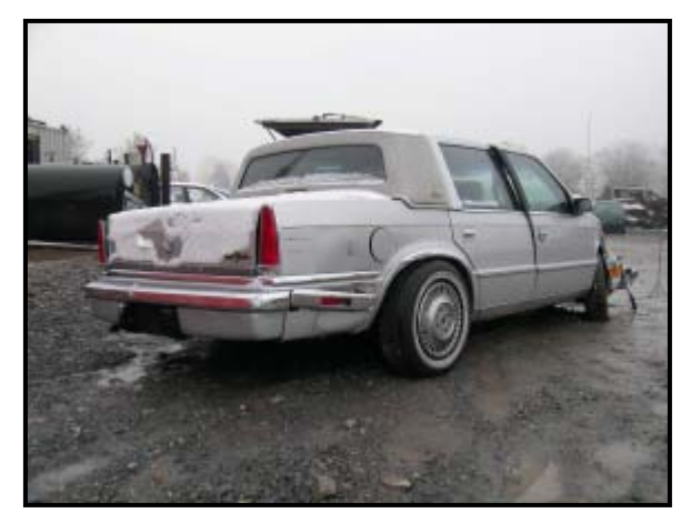
Figure 8: Right rear view of the Chrysler.

As the Chrysler slid to final rest, the left tires struck and mounted the curb at the northeast intersection quadrant. These impacts caused deformation to both wheel rims and both tires to debead. The CDC's were 09-LFWN-1 and 09-LBWN-1. The left quarterpanel of the Chrysler then struck the utility pole. The direct contact measured 66.0 cm (26.0 in) and was centered on the left rear axle. The maximum residual crush measured 8.4 cm (3.3 in). The Landau roof at the left C-pillar was abraded and torn. This damage was consistent with the scuff observed on the pole during the scene inspection. The CDC of this contact was 09-LZAW-2. Refer to Figure 9 .