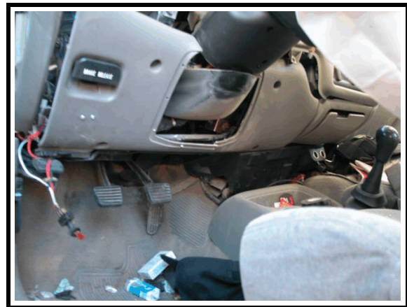
Figure 9. Left lower instrument panel

The crash went unreported for at least an hour. Once found, the driver was transported to a local hospital at 0215 hours and declared dead at 0316 hours.