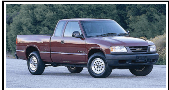
Figure 2. Exemplar view, 2000 Isuzu Hombre