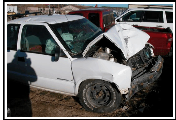
Figure 1. Front right, 2000 Isuzu Hombre

This single vehicle crash occurred in a rural area of southern Colorado. The crash occurred off-road. At the time of the crash, there were no adverse weather conditions and the asphalt roadway surface was dry. At the time of the crash, it was dark and there were no streetlights available. The north/south county roadway was configured with a single lane in each direction that was separated by a very faint double yellow centerline. Just prior to the impact area there is a 4.2 m (13.7 ft) wide private driveway on the right side of the roadway. The struck tree was 3.2 m (10.5 ft) south of the driveway and 5.2 m (17.0 ft) west of the roadway edge. The 67.0 cm (26.3 in) diameter tree was located in a ditch that was 70.0 cm (27.5 in) below the height of the roadway edge. In Colorado, the basic prima facie speed limit for a residential district is 48 km/h (30 mph).