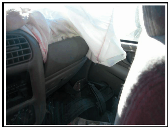
Figure 8. Front right passenger's air bag