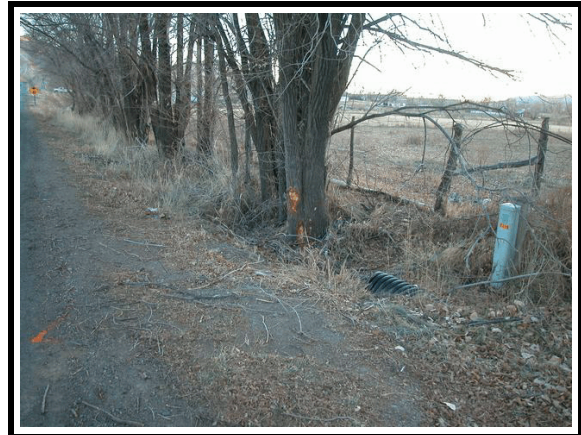
Figure 4. Impact with tree (south)

The vehicle continued down the right side of the roadway before striking a tree that was approximately 3 m (10 ft) off the side of the road ( Figure 4 ). Both front air bags deployed at this point. The barrier routine of the WinSmash program computed a total delta V of 44.0 km/h (27.3 mph) based on the Isuzu's frontal crush profile. The longitudinal and lateral components were -44.0 km/h (-27.3 mph) and 0 km/h (0 mph), respectively.