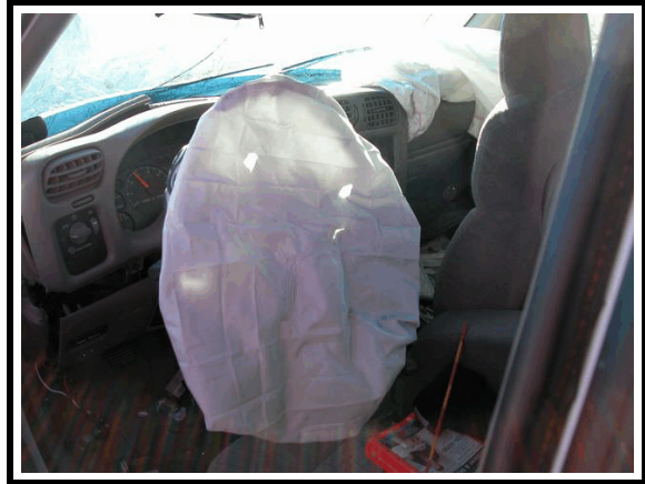
Figure 7. Driver's air bag

The front right passenger's air bag deployed from the front mount module with a rectangular cover flap that was hinged at the bottom ( Figure 8 ). The module cover flap measured 32 cm (12.5 in) wide by 12 cm (4.7 in) high. The deployed front right passenger air bag measured 43 cm (16.9 in) from seam to seam laterally and measured 40 cm (15.7 in) high in its deflated state. There were no tethers. Two circular vent ports were located at the 3 and 9 o'clock aspects of each side panel of the air bag. There were no occupant contacts or damage to the air bag or module cover.