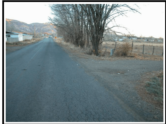
Figure 3. Approach to impact with tree (south)

The driver drove off the roadway and traveled approximately 37.0 m (120 ft). There were no indications that any other vehicles were involved or that the driver took any evasive actions.