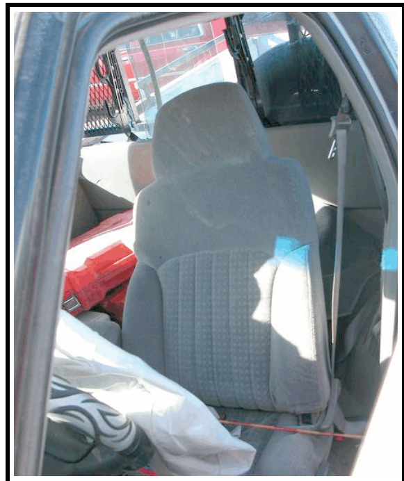
Figure 10. Scuff to back of driver's seat