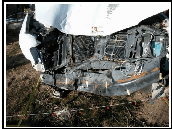
Figure 5. Front bumper, Isuzu Hombre

Six crush measurements were documented at the bumper level as follows: C1 = 0cm, C2 = 5 cm (1.9 in), C3 = 24 cm (9.4 in), C4 = 57 cm (22.4 in), C5 = 51 cm (20.0 in), C6 = 37 cm (14.6 in).