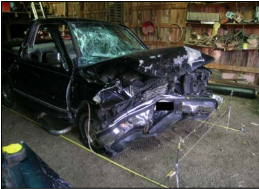
Figure 12 - Damaged 1993 Chevrolet K-1500.

corner and measured 82 cm (32.3") in depth. The crush profile was measured along the damaged bumper and was as follows: C1 = 5 cm (2"), C2 = 28 cm (11"), C3 = 51 cm (20.1"), C4 = 69 cm (27.2"), C5 = 81 cm (31.9"), C6 = 82 cm (32.3"). The CDC for the impact with the Plymouth was 12-FDEW-4.