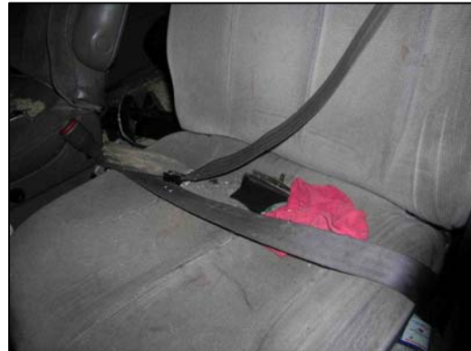
Figure 14 - Driver's 3-point lap and shoulder restraint.

The 1994 Plymouth Voyager was configured with manual 3-point lap and shoulder belts for the five outboard positions and the second row center position. Both front seats were configured with Emergency Locking Retractors (ELR), cinching latch plates, and adjustable D-rings that were in the full down position at the time of the inspection. The driver's belt revealed loading marks consistent with usage and the shoulder portion of the belt was cut by