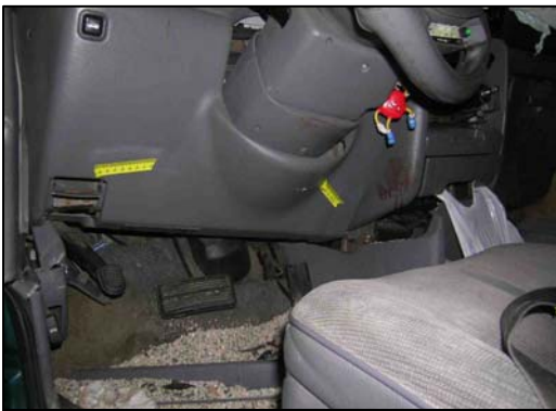
Figure 6 - Damaged knee left bolster.

of the driver's knees ( Figure 6 ). The first scuff mark attributed to the driver's left knee was located 10 cm (3.9") inboard of the left aspect and 13 cm (5.1") above the bottom edge of the instrument panel and was 8 cm (3.1) in length. The second scuff mark attributed to the driver's right knee was located 44 cm inboard of the left edge and 13 cm (5.1") above the bottom edge of the instrument panel and measured 11 cm (4.3") in length. Body fluid transfers were also present on the lower knee bolster and on the underside of the steering column. The brake pedal was bent probably due to a combination of toe pan intrusion accompanied with foot placement and loading force due to the kinematics of the driver ( Figure 7 ). The steering wheel rim was also deformed as the driver loaded through the air bag and her abdomen contacted the lower aspect of the rim ( Figure 8 ). The bottom half of the steering wheel rim bent forward 3 cm. (1.2"). The steering column completely separated from the shear capsules ( Figure 9 ).