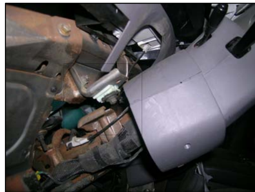
Figure 9 - Left shear capsule separation.

The right side knee bolster exhibited well-defined deformation from contact with the knees of the 19-year old male seated in the front right position. The deformation bowed the glove compartment door and was located inboard of the outer right edge and above the bottom edge of the instrument panel in two locations. The left knee contact ( Figure 10 ) was located 44 cm (17.3") inboard and 11 cm (4.3") above the panel and the right