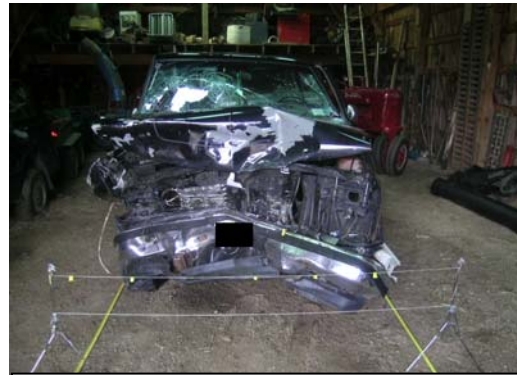
Figure 13 - Crush profile of 1993 Chevrolet K-1500.

As a result of the impact, the front right door of the Chevrolet was jammed shut and the front right window disintegrated. The front right tire was cut and restricted by the crushed front right bumper. The front right axle position was deformed rearward compressing the wheelbase 29 cm (11.4"). The bed of the Chevrolet contained an industrial tool box weighing an estimated of 91 kg (200 lbs.) at the time of the inspection. At impact, the tool box engaged the bed of the pickup resulting in minor damage.