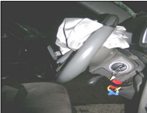
Figure 8 - Bent steering wheel rim.