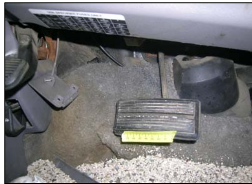
Figure 7 - Bent brake pedal.