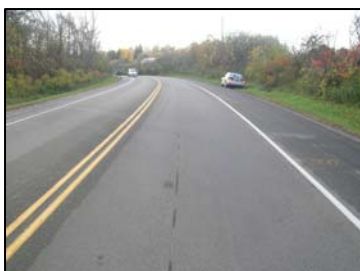
Figure 3 - Westbound approach of Chevrolet K-1500.