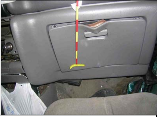
Figure 10 - Left knee contact evidence on front right glove compartment door.

knee contact ( Figure 11 ) was located 25 cm (9.8”) inboard and 14 cm (5.5”) above the bottom aspect. Both contacts were linear and measured approximately 5 cm (2”).