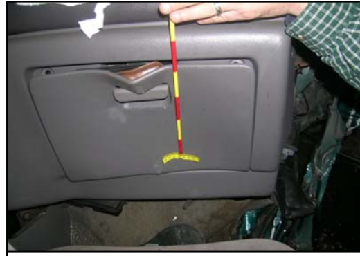
Figure 11 - Right knee contact evidence on glove compartment door.

The toe pan in the driver’s and front right positions and the front right instrument panel intruded longitudinally. The front right floor pan intruded vertically. It is likely that the lower extremities of both front seat occupants loaded the toe pan area; however, no discernable contact evidence could be identified.