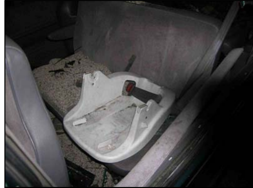
Figure 18 - Base for Cosco infant CSS.

3340. No information was available on the model name or the date of manufacture. The base was 53 cm (20.75”) in length and 36 cm (14”) in width. It was secured in the vehicle by a manual 3-point lap and shoulder belt with a cinching latch plate. The base had a side-to-side excursion of approximately 5 cm (2”) there was minor rippling to the belt. The base was not used during the crash. The occupancy status of the second row left seating position was confirmed through a surrogate interview.