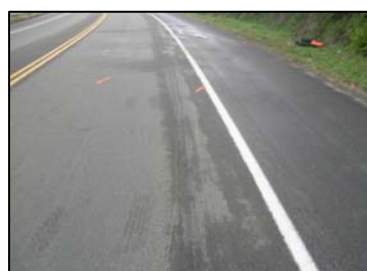
Figure 4 - Point of impact.