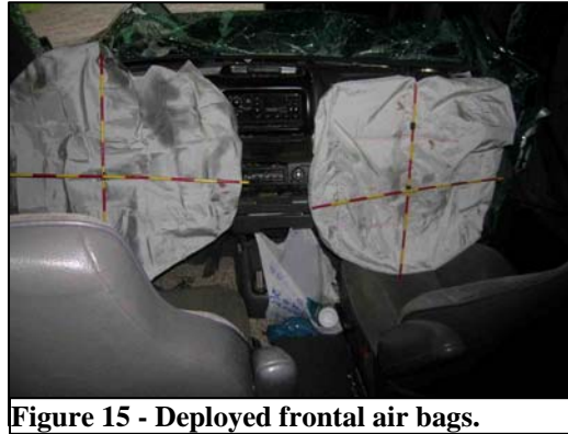
Figure 15 - Deployed frontal air bags.

The 1994 Plymouth Voyager was equipped with frontal air bags for the driver and front right passenger positions ( Figure 15 ). The driver's air bag was housed in the center of the steering wheel hub. The driver's air bag deployed from the steering wheel hub through symmetrical H-configuration module cover flaps. The cover flaps measured 18 cm (7") in width and 6 cm (2.5") in height. The driver's air bag measured 56 cm (22") in its deflated state and had an excursion of 33 cm (13"). The air bag was vented by two circular ports located in the 11 and 1 o'clock sectors on the back of air bag. The air bag was not tethered. There was no contact evidence on the air bag membrane. The following nomenclature was stamped on the bag of the air bag: