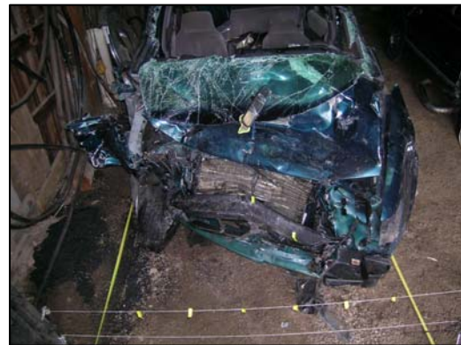
Figure 5 - Crush profile of 1994 Plymouth Voyager.

The 1994 Plymouth Voyager sustained severe frontal damage as a result of the impact with the Chevrolet ( Figure 5 ). The direct contact damage began 29 cm (11.6") left of the vehicle's centerline and extended 80 cm (31.5") to the front right bumper corner. The combined direct and induced damage encompassed the entire width of the bumper beam and measured 113 cm (44.5"). The maximum crush was located at the front right bumper corner and measured 84 cm (33.1") in depth. The crush profile consisted of six equidistant crush measurements taken along the bumper beam and was as follows: C1 = 12 cm (4.7"), C2 = 50 cm (19.7"), C3 = 66 cm (26"), C4 = 75 cm (29.5"), C5 = 73 cm (28.7"), C6 = 84 cm (33.1"). The Collision Deformation Classification (CDC) for the impact with the Chevrolet was 12-FDEW-4.