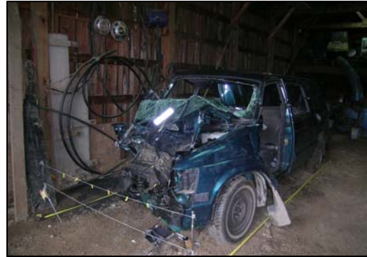
Figure 1 - Damaged 1994 Plymouth Voyager.

This investigation focused on the performance of a forward-facing convertible Child Safety Seat (CSS) that was installed in the third row right position of a 1994 Plymouth Voyager. The Voyager ( Figure 1 ) was equipped with frontal air bags that deployed during the crash. The vehicle was occupied by a restrained 50-year-old female driver, an unrestrained 19-year-old male seated in the front right position, and an 18-month old female who was restrained in the convertible CSS facing forward in the third row right seating position of the vehicle. An