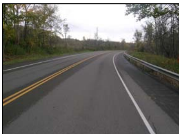
Figure 2 - Eastbound approach of Plymouth Voyager.

The 50-year old female driver of the Plymouth Voyager was traveling in an easterly direction on a two-lane roadway negotiating a right curve ( Figure 2 ). According to a witness the vehicle was driving erratically weaving in out of the eastbound lane. As the Plymouth was negotiating the curve it entered the westbound lane and impacted a 1993 Chevrolet K-1500 pickup truck that was westbound on the same roadway ( Figure 3 ). The 43-year old male driver of the Chevrolet applied and locked up his brakes prior to the impact evidenced by a 6.9 m (22.6') long skid mark from the front right tire. Roadway gouging was also present at the point of impact ( Figure 4 ).