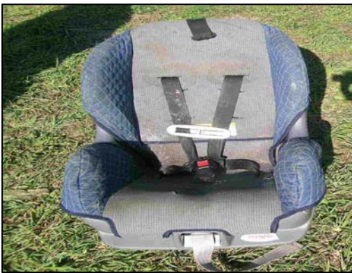
Figure 16 - Evenflo Tribute convertible CSS.