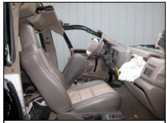
Figure 7. Overall view of the first row.

The 3-year-old female passenger was seated in the third row right position of the Excursion. Although no distinct occupant contacts points were present in this location, an area of pooled body fluid was noted on the roof over the left seating position. This was indicative of the 3-year-old females final rest position. Also noted was body fluid on the rear header which appeared to be smeared by this passenger as she was removed from the vehicle.