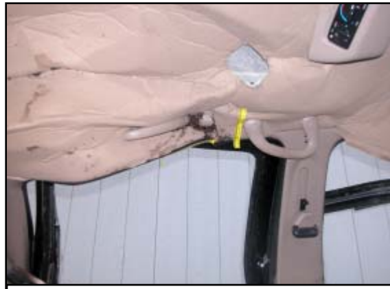
Figure 8. Left roof side rail denting/pocketing and body fluid.