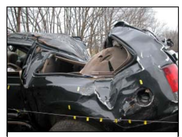
Figure 6. Vertical damage to the left roof side rail and roof.

The left front fender area of the Ford impacted a 24 cm (9.4") diameter tree. The direct contact damage measured 25 cm (9.8") and began 5 cm (1.9") rear of the left front axle and extended 20 cm (7.9") rearward. The maximum crush on