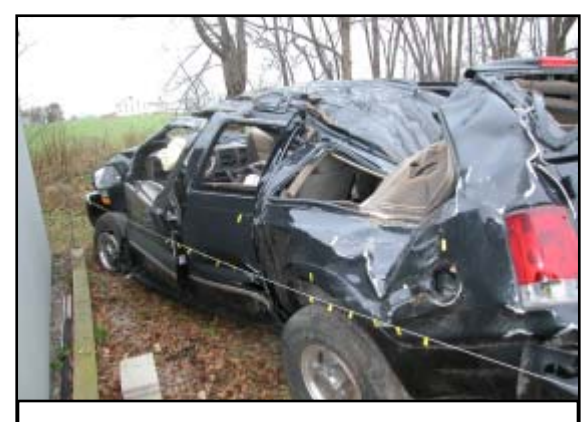
Figure 5. Overall view of the left side damage.