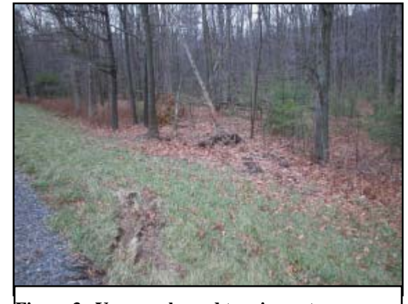
Figure 3. Yaw marks and tree impacts.

The Ford traveled down the 8.5 meter (27.9 feet) grass embankment where the front of the vehicle bottomed out allowing the front bumper system to contact the embankment. The ground impact was located at the transition point where the ground leveled. This impact resulted in minor damage to the front of the Ford. The direction of force for this impact was non-horizontal; therefore, it was outside the scope of the WINSMASH program.