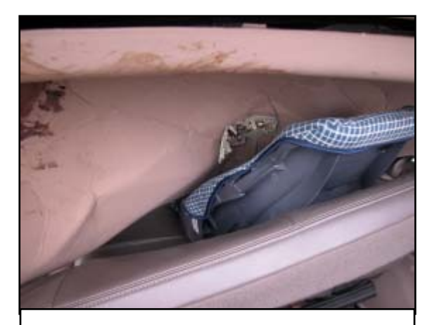
Figure 9. Belt positioning booster seat trapped by roof intrusion.

The 3-year-old female was seated in the third row right seat in a Cosco Voyager belt positioning booster seat and was restrained by the vehicles lap and shoulder belt. Due to the severe intrusion, the child safety seat was captured between the roof and seat cushion; therefore, the child safety was not fully inspected ( Figure 9 ). The driver stated to the SCI investigator that the child safety seat was a Cosco Voyager. A fracture was noted to the right outboard aspect of the shell 22 cm (8.6") below the top from compression against the seat and roof ( Figure 10 ). The total length of the fracture measured 19 cm (7.5"). Numerous stress marks were noted to the child safety seat shell which resulted from compression. Additionally, a cut was noted to the right aspect of the fabric cushion.