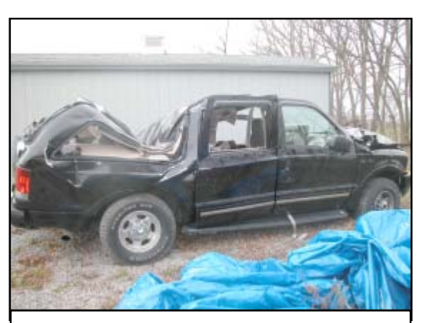
Figure 1. 2002 Ford Excursion subject vehicle.

This on-site investigative effort focused on the performance of two child safety seats and the resulting injuries to the 1 and 3-year-old female passengers of a 2002 Ford Excursion ( Figure 1 ). The 1-year-old female was restrained by the five-point harness in a forward facing manner within a convertible child safety seat in the second row left position. Due to the severity of her injuries, she was transported to the hospital within the child safety seat where it was subsequently discarded. The 3-year-old female was seated in a Cosco Voyager belt positioning