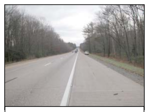
Figure 2. Ford's pre-crash travel.

The 31-year-old female driver was operating the vehicle westbound on the right lane ( Figure 2 ) at high speed. As the vehicle continued westbound, the driver allowed the Ford to drift to the left. The Ford traversed the left travel lane and entered the inboard (south) shoulder. The driver applied a sharp right steering input to return to the roadway. Due to the right steering input, the Ford re-entered the roadway and began to yaw clockwise (CW). The vehicle traversed both travel lanes and departed the north roadside at angle of 45 degrees in relation to the