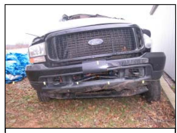
Figure 4. Frontal damage from the delineator post.

The frontal damage resulted from the impact with the ground. The maximum crush was 10 cm (4.0"), located 5 cm (2.0") right of the vehicle centerline on the bumper beam. The bumper beam was also displaced vertically by the nonhorizontal impact force. The direct contact damage was located on the underside of the bumper fascia and began 70 cm (27.5") left vehicle centerline and extended 147 cm (57.8") to the right. The direct contact damage terminated inboard of the bumper corners. The residual crush was measured along the full width of the bumper beam (Field L) of 179 cm (70.5").