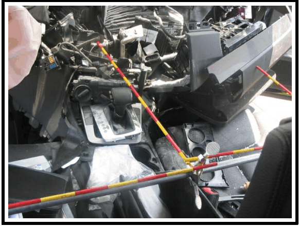
Figure 11. Center & Right instrument panel intrusion

There was integrity loss to the windshield. The glazing was in place and holed near the bottom center. The entire windshield was cracked due to impact forces and the hole appears to have been caused by contact with the damaged hood. The rearview mirror broke off its base, either due to impact damage or occupant contact. The vehicle's side doors all remained closed and operational.