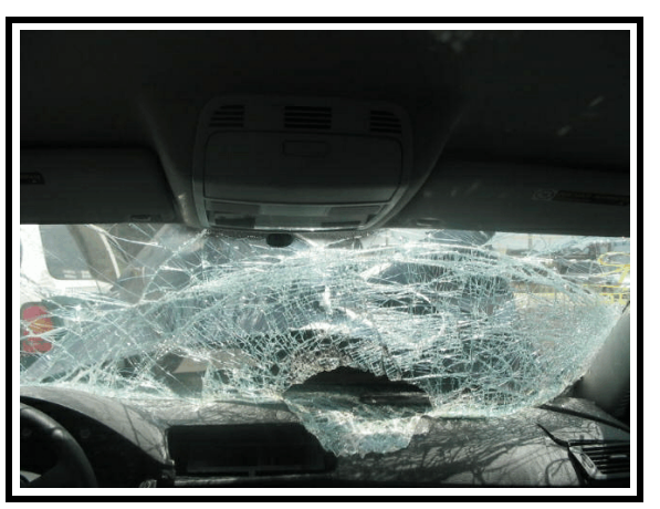
Figure 9. Windshield damage/intrusion