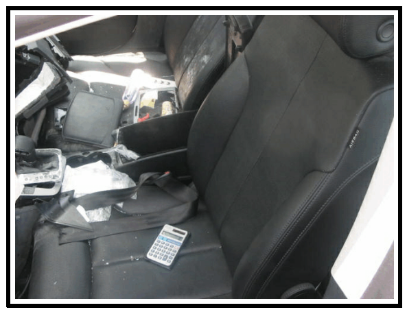
Figure 12 . Driver's seat belt, cut by fire/rescue personnel

The 2006 Volkswagen Passat was configured with manual 3-point lap and shoulder belts for each of the five seating positions. Both front seat belts were equipped with an energy management feature, retractor pretensioners and anchorage adjustments. Both front row pretensioners actuated and were locked in place post-crash. The driver's safety belt was configured with a sliding latch plate and an emergency locking retractor (ELR). The left front anchorage adjustment was set to the full down position. The front right seat belt had a sliding latch plate and switchable ELR/Automatic Locking Retractor (ALR). The anchorage adjustment was set to the full up position. The second row seat belts were all