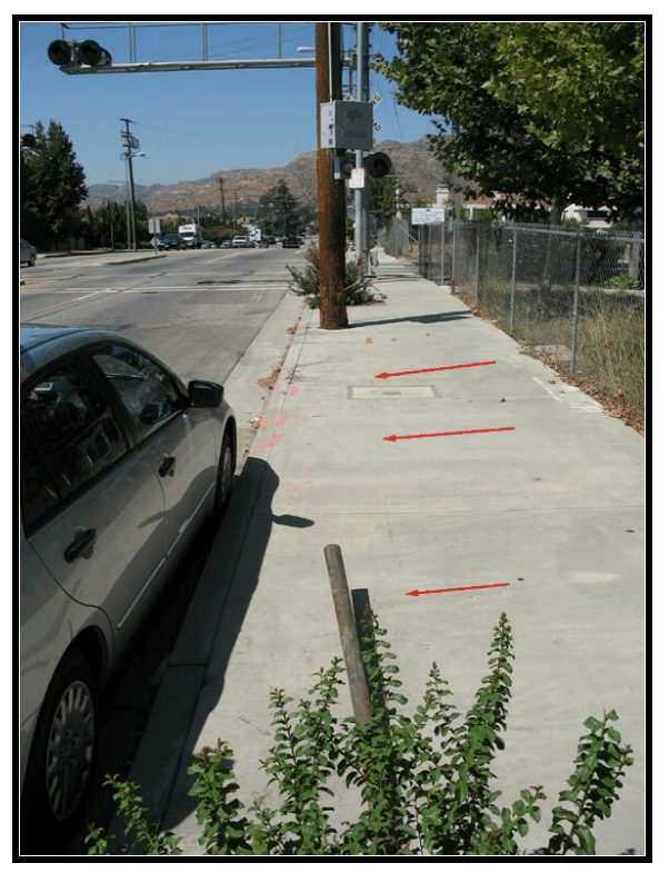
Figure 5 . Struck second pole and path to impact with third pole

The driver was severely injured in the crash, and was transported by ambulance to a trauma center. He was hospitalized for 15 days with serious internal and spinal injuries. The Volkswagen Passat was towed from the crash scene and was later declared a total loss.