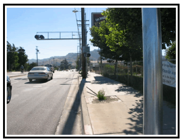
Figure 3 . Impacted light post (foreground), pole and wooden utility pole (background)

and it was still dark out. The investigating officer reported that the roadway was illuminated by single over hanging globe light standards. The nearest light standard was located 71.0 ft (21.6 m) east of the crash scene. There were no adverse weather conditions present and no visual obstructions that would have played a factor in this collision. The posted speed limit was 64 km/h (40 mph).