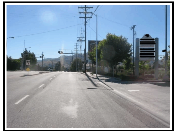
Figure 2. Approach of case vehicle (west)

The travel lanes were composed of asphalt and there was an uphill grade for westbound vehicles. At the time of the crash, the travel lanes were dry. The crash occurred during the early morning hours