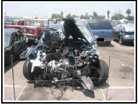
Figure 7. Front - 2006 Volkswagen Passat

The location of direct damage from the individual impacts was not documented due to overlapping damage. Crush profiles were not obtained. For the initial crash event between the Passat's front end and the first pole, the NASS researcher assigned a Collision Deformation Classification (CDC) of 12FDEW6. Given the diameter of the pole, it is unlikely the direct damage extended across the entire front end of the vehicle. It is also unlikely that the direct damage from this first crash event would have resulted in crush that extended into extent zone 6. It is more likely that the third impact to the large wooden pole caused the most damage and crush to the vehicle. This third event left the most distinctive crush pattern to the vehicle's front end, including a distinct outline of the shape of the pole near the center of the hood.