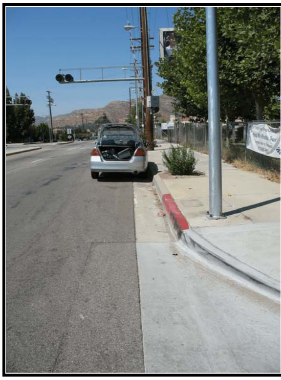
Figure 4. Impact with first pole

The driver of the case vehicle reported that he was on his way home and was tired. He said he decided to pull over to the side of the road, but instead went off the north side of the street and struck the first pole. Given the length of the crash scene and the severity of the vehicle damage, it is not likely that the driver was pulling over in order to stop the Passat when the case vehicle left the roadway. When the Passat departed the travel lanes, the front of the case vehicle impacted the first pole. The pole was severed at the base and fell to the ground. The impact severity was moderate and resulted in the deployment of the driver's front air bag and actuation of his seat belt pretensioner. The vehicle continued traveling west and the front of the case vehicle impacted a second, smaller pole that was positioned next to a small tree/shrub. The Passat knocked the pole over and continued west until the front end struck a wooden utility pole. The impact severity from this crash event was severe and resulted in extensive engine damage. The case vehicle came to final rest near the utility pole, facing west.