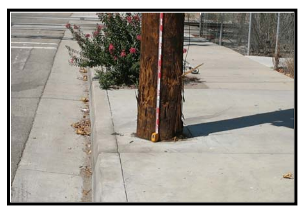
Figure 6. Impact with third pole