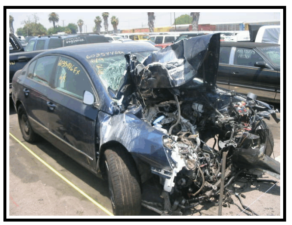
Figure 1 . Front/Right - 2006 Volkswagen Passat

The driver was traveling west in lane one of five, and may have fallen asleep while driving, resulting Passat