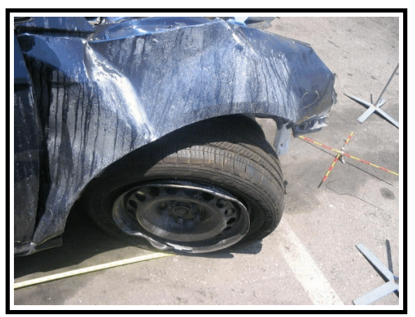
Figure 8. Right front tire & rim damage