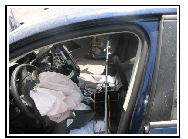
Figure 10. Front row intrusion

The front and second row seat belt retractor pretensioners actuated during the crash and were locked in place post-impact. The driver's seat belt was cut by fire/rescue personnel.