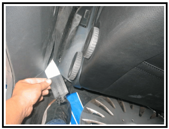
Figure 15 . Driver's seat belt - cut by fire/rescue personnel

During the initial impact between the case vehicle and the first pole, the driver's safety belt pretensioner actuated and the front air bag deployed. The male driver initiated a