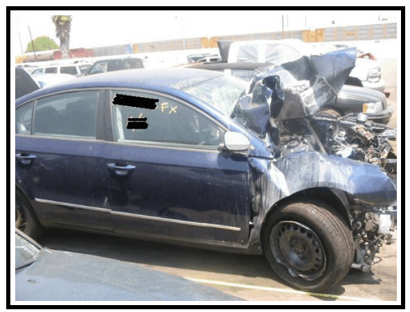
Figure 14. Angled hood damage

forward trajectory towards the 12 o'clock direction of force. He loaded the safety belt and may have engaged the deployed front air bag with his face, although there were no visible signs of occupant contact to the air bag. After striking the first pole, the case vehicle continued traveling west and the front of the Passat impacted a small pole that was being used as a support post for a tree/shrub. This was a low delta V event, and the driver likely remained within his general seating area. The case vehicle knocked the post over and continued traveling a short distance west, where the front of the Passat impacted a large wooden utility pole. Based on the extensive engine and hood damage, as well as the amount of intrusion caused by this impact, it appears that this final crash event was the highest delta