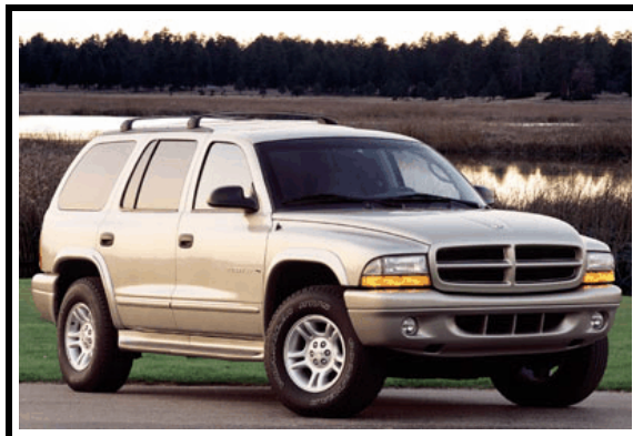
Figure 10. Exemplar photo, 2001 Dodge Durango