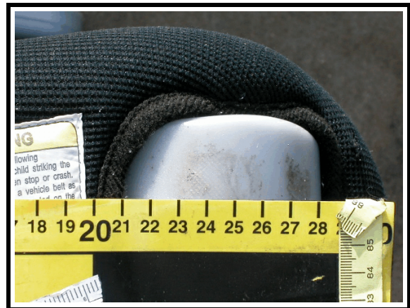
Figure 9. Close up of abrasion to seat base