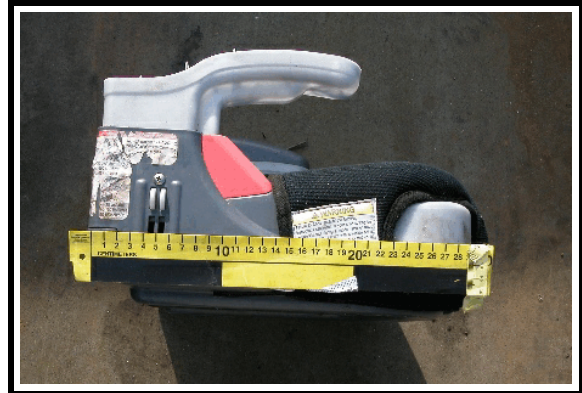
Figure 8. Right side, Graco booster seat