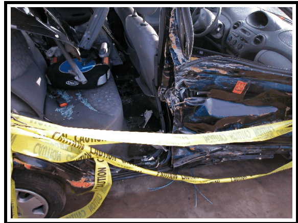
Figure 3. Right side damage

Six crush measurements were documented at the mid door level as follows: C1 = 0.0 cm (0.0 in), C2 = 0.0 cm (0.0 in), C3 = 15.0 cm (5.9 in), C4 = 25.0 cm (9.8 in), C5 = 17.0 cm (6.7 in), C6 = 0.0 cm (0.0 in). The C3 measurement was taken at a projected point.