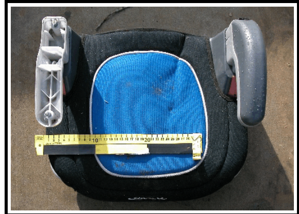
Figure 5. Top, Graco booster seat

The Graco Backless TurboBooster youth booster car seat is to be used forward-facing only. An excerpt from the user's manual outlined the recommended use of the CSS as follows: