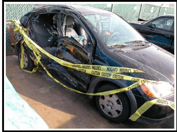
Figure 1. Right side, 2000 Toyota Echo

The focus of this on site investigation was on a booster safety seat installed in the second row right seat position of a 2000 Toyota Echo. The Toyota Echo was occupied by a 28-year-old female driver and a 5-year-old female who was seated in a booster seat. The booster seat was being used in conjunction with the manual 3-point lap and shoulder belt. The Toyota Echo lost control on an interstate highway and struck the rear of a Dodge Durango with its right side. The driver of the Toyota Echo did not report any injuries. The 5-year-old sustained head injuries. She was transported by ambulance to a local hospital where she passed away approximately one hour after the crash. The driver of the Durango was not injured.