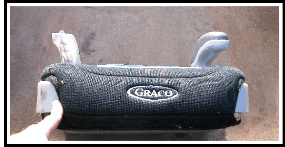
Figure 7. Front, Graco booster seat

The booster seat sustained moderate damage as a result of the crash. The upper part of the right side arm rest was dislodged. The forward aspect of the seat bottom was abraded from contact to the intruding right rear door.