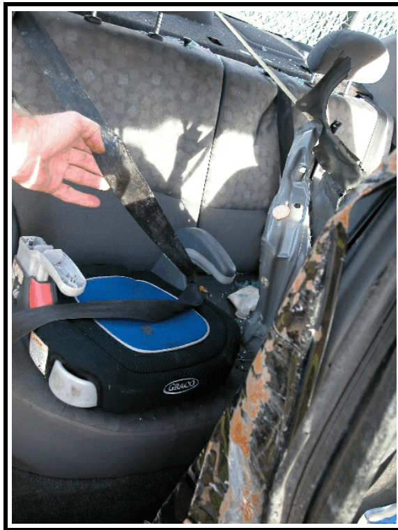
Figure 12. Booster seat belted into right rear seat position

The 5-year-old female second row right occupant was seated in what is believed to be an upright posture. She was seated in a backless booster seat and was using the manual 3-point lap and shoulder belt. The second row right seat back was at a 70 degree angle, the seat bottom was at a 15 degree angle. According to police accounts, the driver was actively steering and braking. The child was pitched first to the right and then to the left. As the driver lost control of the vehicle, and the vehicle began a counterclockwise rotation, the child began pitching to the right. At impact, the child initiated a lateral and slightly forward trajectory to the right. Intrusion of the right rear door caused scuffing damage to the booster seat base and a portion of the right arm rest was broken away. The child contacted the door panel and door hardware with her right side, causing multiple contusions and abrasions to the upper arm and to the right leg. The child sustained abrasions to the right side of the neck and lower abdomen from the seat belt webbing. As the Dodge Durango intruded into the vehicle, the child's head came into contact with the rear cargo area of the Durango, causing multiple facial contusions and abrasions as well as a mandible fracture. The lateral movement of the child's head to the right during the intrusion likely caused the C1 fracture and dislocation with a complete transection of the spinal cord.