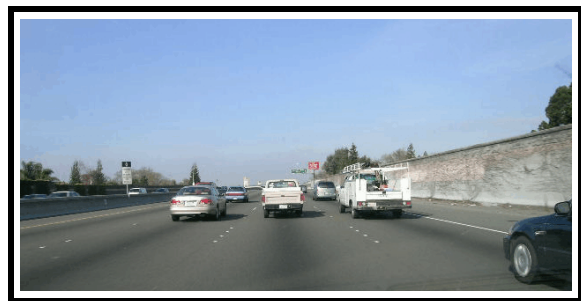
Figure 2. Lane 2, northbound freeway

This three vehicle crash occurred in December 2005 at 0656 hours. The crash occurred in the northbound lanes of an interstate highway. The northbound highway was configured with four northbound lanes (lane 4 from right was a car pool lane). The highway was bordered on the right by a solid white line, an asphalt shoulder and a concrete sound wall. The highway was bordered on the left by a solid yellow line, an asphalt shoulder, and a New Jersey style concrete barrier. The temperature