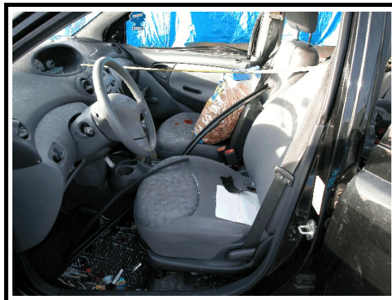
Figure 11. Driver seated position

The 28-year-old female driver was seated in an upright posture and was restrained by the 3-point manual lap and shoulder belt. The seat was adjusted to the rear most track position. The driver's seat back was at a 70 degree angle, the seat bottom was at a 12 degree angle. According to police accounts, she was actively steering and braking. The driver was pitched first to the right and then to the left. As she lost control of the vehicle, and the vehicle began a counterclockwise rotation, the driver began pitching to the right. At impact, the driver initiated a lateral and slightly forward trajectory to the right. There were no indications that the driver contacted any interior structures. The driver was not injured. She was able to exit the vehicle under her own ability.