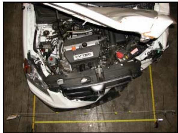
Figure 7: Overhead view.