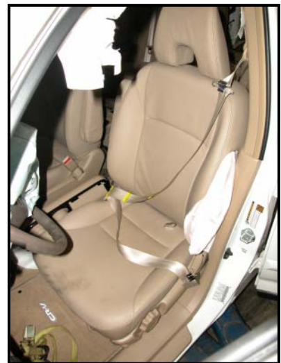
Figure 11: Driver seat and safety belt.

The driver's safety belt was a three-point lap and shoulder restraint with continuous loop webbing, Emergency Locking Retractor (ELR), and a sliding latch plate. A pretensioner was incorporated into the buckle stalk that was attached to the inboard aspect of the seat. The D-ring was adjustable and was in the full-up position. Figure 11 is a view of the driver seat and restraint. The driver was restrained by the safety belt at the time of the crash. Examination of the restraint revealed the webbing was cut in two places by the first responders during the rescue operations. The webbing was cut 30 cm (12 in) above the fixed outboard anchor and 10 cm (4 in) below the D-ring. The length of the cut webbing section measured 129 cm (51 in) and was comprised of 57 cm (22.5 in) in the lap section and 72 cm (28.5 in) in the section lying across the torso. The location of the latch plate was identified by a crease of the webbing indicative of