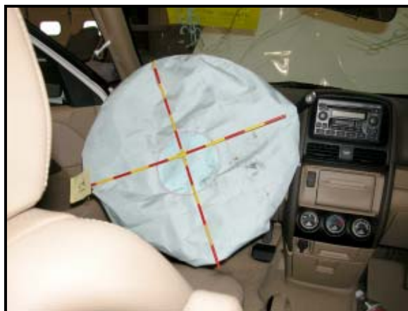
Figure 12: Driver air bag.

The driver air bag, Figure 12 , deployed as a result of the offset frontal crash. The H-configuration driver air bag module was located in the center hub of the steering wheel rim. The symmetrical upper and lower flaps measured 6 cm x 16 cm (2.5 in x 6.3 in), height by width, respectively. The flaps opened at the designed tear seams during the deployment sequence and were free from occupant contact. The deployed driver air bag measured 61 cm (24 in) in diameter. The bag was tethered by two 6 cm (2.5 in) wide straps in the 6/12 o'clock sectors and was vented by two 4 cm (1.5 in) diameter ports located in the 11/1 o'clock sectors. The face of the bag was soiled from post-crash handling in the 6 o'clock sector and along the perimeter seam in the 3 o'clock sector.