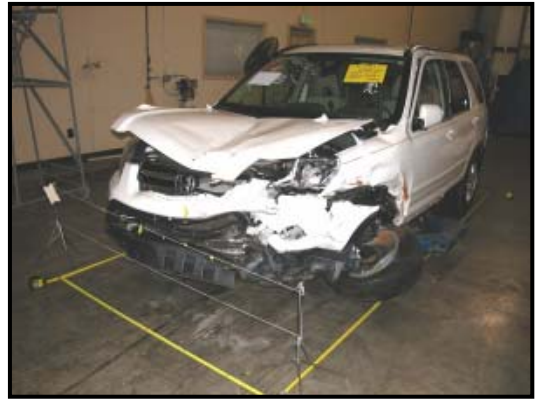
Figure 1: Front left view of the Honda.

This investigation focused on the performance of the Certified Advanced 208-Compliant (CAC) safety system in a 2005 Honda CR-V sport utility vehicle, Figure 1 , and the injury sources for the 54 year old restrained male driver. The driver was the sole occupant of the Honda. The Certified Advanced 208-Compliant safety system in the Honda was comprised of dual-stage frontal air bags, seat track position sensors, front safety belt buckle switches, front safety belt buckle pretensioners, and a front right occupant detection sensor. The frontal air bags in the vehicle were certified by the manufacturer to be compliant with the advanced FMVSS 208 ruling. The Honda was also equipped with front seatback mounted side impact (thorax) air bags and roof-rail mounted inflatable side curtains. The Honda's driver air bag, the driver seatback mounted thorax bag, and the left roof-rail curtain deployed as a result of an offset frontal crash with a 1995 Dodge Neon. The Honda's restrained driver sustained an anterior fracture/subluxation at C4/C5 with quadriplegia (AIS 5) as a result of loading the safety belt system. The unrestrained female driver of the Dodge sustained a police reported A-level injury. Both vehicles sustained disabling damage and were towed from the crash site.