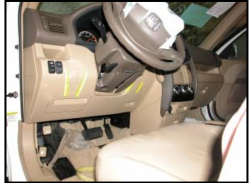
Figure 10: View of the driver position and bolster contacts.

The interior of the Honda, Figure 10 , sustained minor intrusion as a result of the impact. The longitudinal intrusion of the left corner of the instrument panel measured 2 cm (0.75 in). The outboard aspect of the left toe pan intruded 5 cm (2 in). The floorpan and left frame damage referred to earlier in this report caused minor intrusion of the left sill and left B-pillar. The lateral sill intrusion measured at the base of the left B-pillar was 2 cm (1 in). The intrusion of the B-pillar measured at the belt line was 4 cm (1.5 in). The driver bolster exhibited two areas of contact from the driver's lower extremities. The bolster was cracked from a left lower extremity contact immediately above the fuse panel access cover.