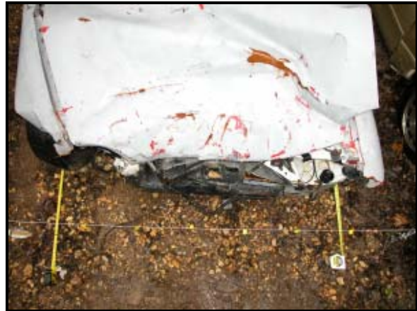
Figure 9: Overhead view.