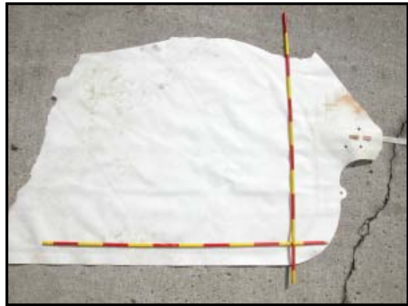
Figure 14: Left curtain section cut by EMS.