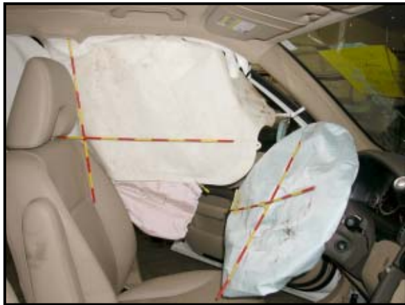
Figure 13: Interior lateral view.

The inflatable side curtain deployed downward from the left roof rail. The curtain provided coverage that extended from the A- and C-pillars. Upon deployment, the curtain was inflated by helium stored in a canister located in the C-pillar. The gross overall dimensions of the curtain measured 160 cm x 46 cm (63 in x 18 in), length by height respectively. The curtain was tethered at the A- and C-pillars. During the rescue operations, the first responders cut and removed a 69 cm (27 in) length of the curtain located between the left A- and B-pillar. Figure 14 is an overall view of the cut section. This section of the bag was found in the interior of the Dodge Neon during its inspection. It was located amidst debris cleaned up from the crash site and placed in the Dodge. The inboard surface of the bag was soiled from post-crash handling and masked any potential contact evidence. There was no direct evidence of driver contact identified.