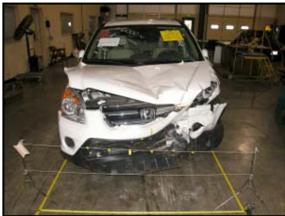
Figure 6: Front view of the Honda.