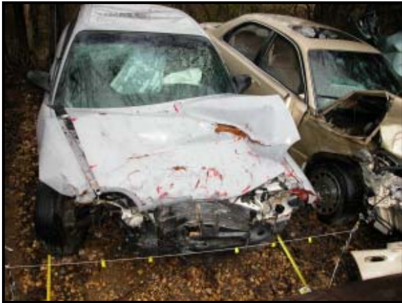
Figure 8: Front view of the Dodge.