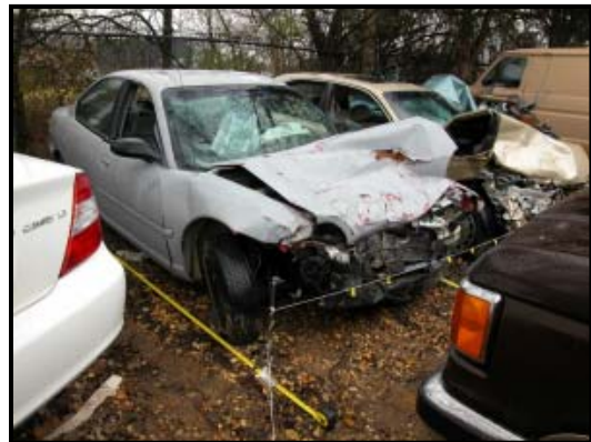
Figure 3: Front right view of the Dodge Neon.

The 1995 Dodge Neon, Figure 3 , was identified by the Vehicle Identification Number (VIN): 1B3ES47C9SD (production sequence omitted). The four-door sedan was equipped with a 2.0 liter, four-cylinder engine; four-speed automatic transmission, power steering, power-front disc/rear drum brakes, and OEM steel wheels. The manual restraint systems consisted of 3-point lap and shoulder belts for the four outboard positions and a rear center lap belt. The Supplemental Restraint System consisted of air bags