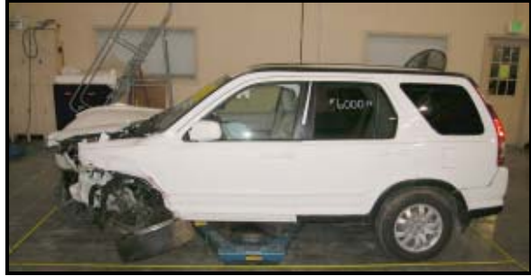
Figure 2: Left side view of the Honda

five passenger sport utility vehicle was equipped with SE level trim. The real-time four wheel drive power train consisted of a 2.4 liter/I4 engine linked to a five speed automatic transmission. The service brakes were four-wheel disc with ABS. The vehicle was also equipped with vehicle stability assist with traction control. The manual restraint system consisted of three-point lap and shoulder belts in all five seat positions. The front safety belts utilized buckle pretensioners. The dual-stage