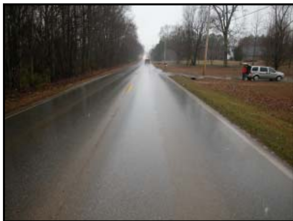
Figure 4: Westbound trajectory view of the Honda.

This two-vehicle crash took place during the daylight hours of November 2005. At the time of the crash, it was raining and the asphalt road surface was wet. The crash occurred on a two-lane east/west road in a residential setting. The road was straight and there was a negative five percent grade in the westbound direction. The 2.9 m (9.5 ft) wide traffic lanes were separated by a broken yellow centerline. The outboard edges of the traffic lanes were delineated by solid white edge lines. The north roadside consisted of private residences. The south roadside was wooded. At the crash site, a concrete residential driveway intersected the road from the north. The speed limit in the area of the crash was 72 km/h (45 mph). Figures 4 and 5 are views of the crash site taken during the SCI scene inspection.