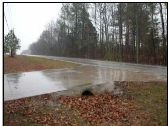
Figure 5: Lookback view from the final rest of the Honda.