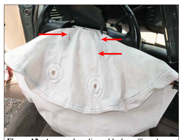
Figure 12: Arrows show linear black scuff marks on back of driver's air bag due to contact with back of top cover flap