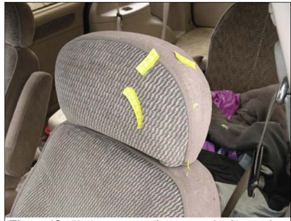
Figure 18: Yellow tape outlines area of hair transfer found on driver's seat head restraint