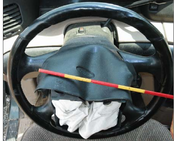
Figure 11: Deformation to top cover flap due to interaction with front left occupant during air bag deployment