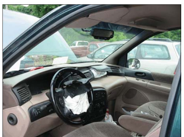
Figure 9: Overview of case vehicle's steering wheel windshield, and instrument panel (Note: rearview mirror placed back on bracket during inspection)

Vehicle Interior: Inspection of the case vehicle's interior (Figure 9) revealed probable occupant contact evidence on the driver's air bag, upper air bag module cover flap, the driver's head restraint, and the rearview mirror was found knocked off its mounting bracket. In addition, two semi-circular black scuffs were observed on the driver's air bag, which appeared to be caused by interaction of the deploying air bag against the steering wheel. There was no deformation of the steering wheel and no compression of the energy absorbing steering column (Figure 10). Lastly, there was no intrusion of the case vehicle's passenger compartment.