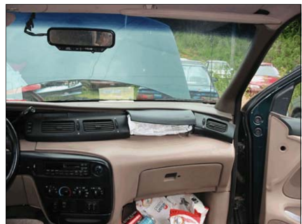
Figure 14: Overview of case vehicle's front right passenger air bag located in middle of right instrument panel

Immediately prior to the crash, the case vehicle's front left occupant [6-year-old, White (non-Hispanic) female; 110 centimeters and 20 kilograms (43 inches, 44 pounds)] was in an unknown position in the driver's seat. The driver's seat track was located between the middle