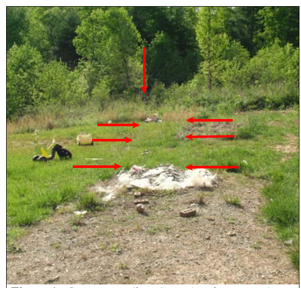
Figure 1: On-scene police photo showing area where case vehicle was parked, arrows show left and right tire marks in grass and rest position of case vehicle at bottom of hill

Crash Environment: The case vehicle was parked heading northwest near the end of a driveway on private property ( Figure 1 ). The driveway was