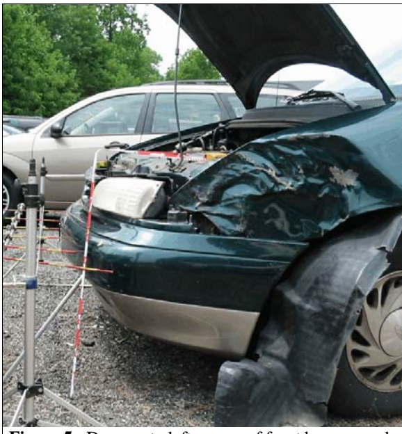
Figure 5: Damage to left corner of front bumper and left fender due to impact with the tree

Post-Crash: The case vehicle came to rest adjacent to the tree ( Figure 7 ). The 6-year-old occupant was found in the driver's seat on her knees leaning to the left of the steering wheel.