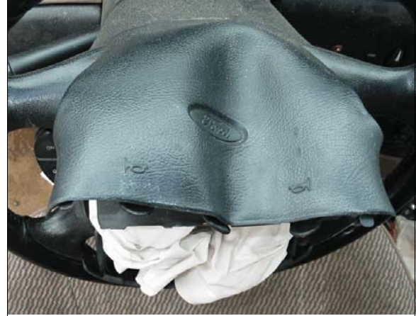
Figure 16: Deformation to case vehicle driver's top air bag module cover flap due to contact with front left occupant

fender caused the front left occupant to continue forward opposite the case vehicle's 0 degree direction of principal force as the case vehicle swiped the tree and decelerated. As the occupant moved forward, she became positioned over the driver's air bag module at the time of air bag deployment when the tree engaged the left front wheel. She most likely had her torso and head turned to the left. As the air bag deployed, the upper air bag module cover flap (Figure 16) scrapped along the passenger's upper chest, right shoulder, neck and submandibular areas causing contusions and abrasion to these areas. The deploying air bag then impacted the right side of her face causing a transection of her spinal cord