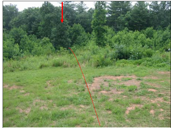
Figure 2: Overview of path of case vehicle down hill to impact with tree, arrow shows impacted tree, line shows approximate path to tree impact

Crash: The left corner of the case vehicle's front bumper (Figure 3) impacted a tree (Figure 4). There was only minor engagement to the bumper. As the case vehicle swiped past the tree, the left fender (Figure 5 below) engaged the tree and then the left front wheel engaged the tree causing the case vehicle's front air bags to deploy. The impact crushed the left front wheel rearward 11 centimeters (4.3 inches) and crushed the left fender inward. The case vehicle then separated slightly from the tree and the case vehicle's left side view mirror impacted the tree rotating the side view mirror inward (Figure 6 below).