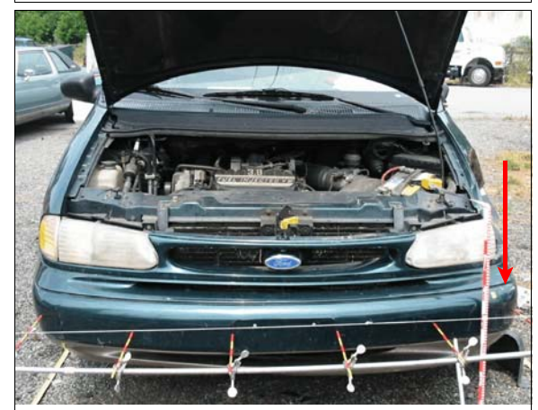
Figure 3: Overview front of case vehicle, arrow shows direct damage to front left bumper corner due to impact with tree