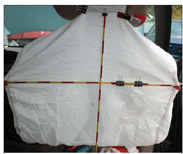
Figure 15: Case vehicle's front right passenger air bag

and forward-most position. The driver's seat back was slightly reclined. The tilt steering column was adjusted to between its center and full down position. The front left occupant was not restrained by the manual, three-point, lap-and-shoulder safety belt system.