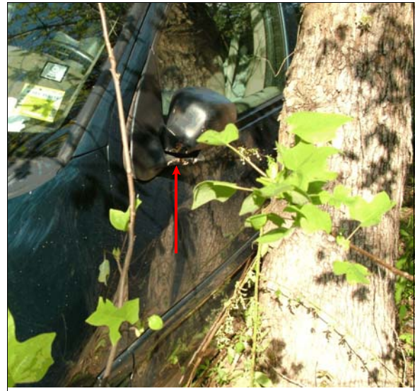
Figure 6: Arrow shows displacement of left side view mirror and bark transfer on mirror due to impact with the tree

The 1995 Ford Windstar was a front wheel drive, three-door minivan (VIN: 2FMDA5146SB-----) equipped with a 3.8L, V6 engine; four-speed automatic transmission and four-wheel, anti-lock brakes. The front seating row was equipped with bucket seats with adjustable head restraints, tilt steering column, driver and front right passenger air bags and driver and front right passenger manual, three-