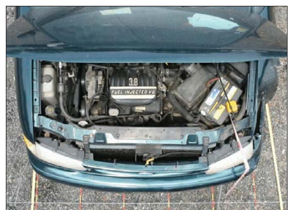
Figure 8: Top view of crush to case vehicle's front bumper [baseline placement subsequently reduced 10 centimeters (4 inches) to establish case vehicle's specification overall length, each increment on rods is 5 cm (2 in)]

Exterior Damage: The case vehicle's impact with the tree involved 9 centimeters (3.5 inches) of direct contact to the front left bumper corner. The left fender and left front wheel then engaged the tree producing 73 centimeters (28.7 inches) of direct damage down the side of the fender and crushing the left front wheel rearward 11 centimeters (4.3 inches). The left front wheel was not jammed against the back of the wheelhouse at the inspection. However, a tire scuff mark was found on the back of the wheelhouse indicating the wheel had been dynamically crushed into the back of the wheelhouse during the crash. Crush measurements were taken at the bumper. The maximum residual crush was measured as 3 centimeters (1.2 inches) occurring at C<sub>1</sub> (Figure 8). The left fender was also crushed rearward