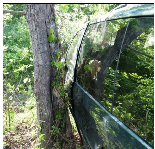
Figure 7: Police on-scene photo showing rest position of case vehicle adjacent to impacted tree

point, lap-and-shoulder safety belt systems. The case vehicle's owner stated that he bought the vehicle from the original owner in 2005. He stated that the previous owner had replaced the case vehicle's transmission. He stated that he had experienced no problems with the transmission or engine, and had never experienced a problem with the vehicle coming out of park or gear. The owner stated that the case vehicle's transmission selector was in park following the crash. The police also indicated that the vehicle was in park with no keys in the ignition. The case vehicle's owner also stated the front wheels rolled while the transmission selector was in park as the vehicle was towed away from the tree. This contractor's vehicle inspection determined that the case