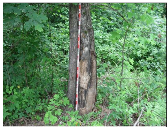
Figure 4: Tree impacted by case vehicle, numbers on scale are tenths of meter