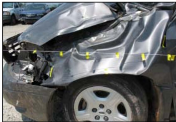
Figure 7. Left fender damage from rollover event.

The rollover event resulted in damage to all four planes. Crush was evident on the front fenders and the right rear roof area. The resultant crush to the fenders was both vertical and lateral in scope and was documented at six equidistant points on the fenders. The direct contact damage on the left fender measured 80 cm (31.5") which began at the forward edge and extended 38 cm (15.0") rear of the left front axle. The left fender crush ( Figure 7 ) profile was as follows: C1 = 0 cm, C2 = 0 cm, C3 = 8 cm (3.0"), C4 = 11 cm (4.5"), C5 = 14 cm (5.5"), C6 = 17 cm (6.7").