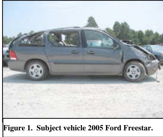
Figure 1. Subject vehicle 2005 Ford Freestar.

This on-site investigative effort focused on the crash severity, rollover dynamics, and injury sources for a crash involving 2005 Ford Freestar ( Figure 1 ) and its 26-year-old female driver. The Ford was involved in an eight-quarter turn rollover crash sequence that resulted in moderate damage to the vehicle. The Ford was occupied by an unrestrained 26-year-old female driver. The vehicle was equipped with a Certified Advanced 208-Compliant (CAC) frontal air bag system for the driver and front right positions. The