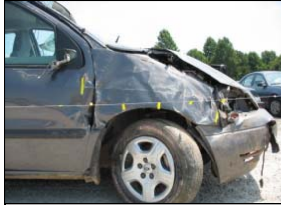
Figure 8. Right fender damage.

The direct contact damage on the right fender measured 102 cm (40.0") and began at the leading edge and terminated on the forward aspect of the right front door. The crush to this component ( Figure 8 ) was as follows: C1 = 0 cm, C2 = 1 cm (0.4"), C3 = 3 cm (1.3"), C4 = 5 cm (2.0"), C5 = 12 cm (4.7"), C6 = 38 cm (5.9").