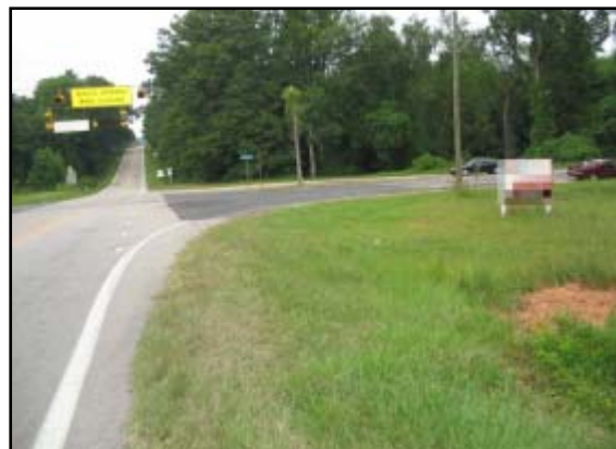
Figure 3. Area of ground contact with front undercarriage and trip.

The front bumper and undercarriage of the Ford contacted the ground as it reached the transition point of the embankment and the level aspect of the ground ( Figure 3 ). This impact was evidenced by a gouge that was located 4.8 meters (15.7 feet) south of the south road edge and 25 meters (82 feet) west of the intersection. The ground impact resulted in moderate non-horizontal damage to the frontal undercarriage area. The ground contact in conjunction with the lateral forces resulted in disengagement of the right front drive axle. This impact resulted in the