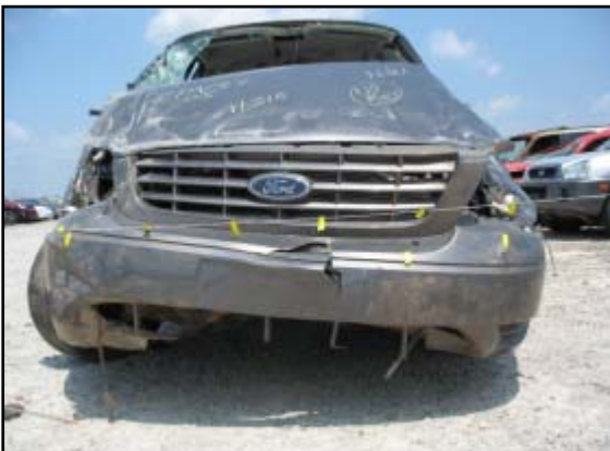
Figure 5. Frontal damage.

The Ford sustained moderate damage to all four planes as a result of the eight quarter-turn rollover event and impacts to the two guy wires. The first impact in this crash sequence involved the front bumper and frontal undercarriage contacting the ground. This impact resulted in vertical and longitudinal displacement of the front bumper system and disengagement of the right drive axle. Figures 5 and 6 depict the front and undercarriage damage. The direct contact damage measured 104 cm (41.0") and began 36 cm (14.0") left of the centerline and extended to the right. The crush was measured across the full frontal width of the bumper beam of 122 cm (48.0"), using six equidistant crush measurements. The crush was as follows: C1 = 4 cm (1.6"), C2 = 0 cm, C3 = 3 cm (1.2"), C4 = 1 cm (0.4"), C5 = 4 cm (1.6"), C6 = 2 cm (0.8"). The Collision Deformation Classification (CDC) for this impact was 00-UFDW-2.