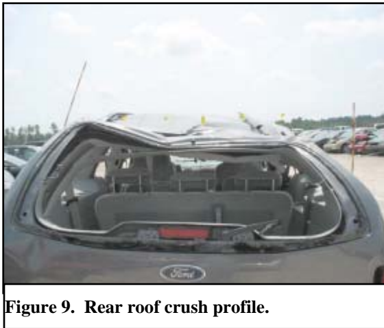
Figure 9. Rear roof crush profile.

The rear right roof area sustained vertical and lateral crush as a result of contact with the ground during the rollover event. The direct contact damage measured 122 cm (48.0") and extended from the left D-pillar to the right D-pillar. A crush profile was documented along the full width of the rear roof which was 122 cm (48.0") ( Figure 9 ). The six crush measurements were as follows: C1 = 0 cm, C2 = 0 cm, C3 = 10 cm (4.0"), C4 = 10 cm (3.8"), C5 = 9 cm (3.6"), C6 = 9 cm (3.5").