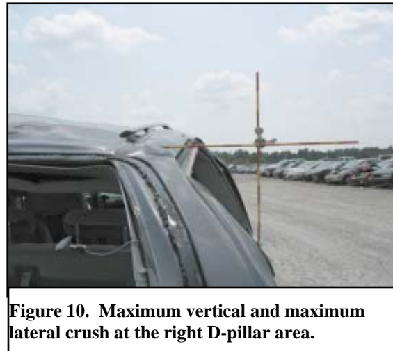
Figure 10. Maximum vertical and maximum lateral crush at the right D-pillar area.

The greatest extent of crush occurred within the right rear D-pillar area which resulted in maximum lateral crush of 30 cm (12.0") and maximum vertical crush of 9 cm (3.5") ( Figure 10 ).