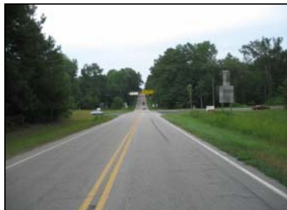
Figure 2. Ford's pre-crash eastbound travel.

The crash occurred on the south roadside of an east/west roadway during night time hours. The 26-year-old female driver of the Ford was operating the vehicle eastbound ( Figure 2 ) approaching the intersection at police reported speed of 113 km/h (70 mph). The driver allowed the Freestar to drift off the right road side and enter the south roadside at a shallow angle of approximately five degrees. As the vehicle entered the roadside, it began a clockwise rotation. The Ford reached a rotation angle of approximately 75 degrees as it traveled down the shallow embankment.