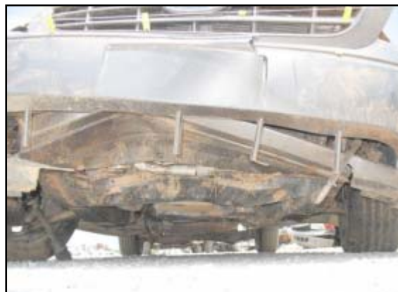
Figure 6. Undercarriage damage.

The rollover event resulted in damage to all four planes. Crush was evident on the front fenders and the right rear roof area. The resultant crush to the fenders was both vertical and lateral in scope and was documented at six equidistant points on the fenders. The direct contact damage on the left fender measured 80 cm (31.5") which began at the forward edge and extended 38 cm (15.0") rear of the left front axle. The left fender crush ( Figure 7 ) profile was as follows: C1 = 0 cm, C2 = 0 cm, C3 = 8 cm (3.0"), C4 = 11 cm (4.5"), C5 = 14 cm (5.5"), C6 = 17 cm (6.7").