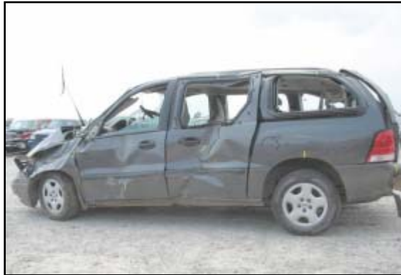
Figure 11. Left front and left rear door damage from the guy wire impacts.

The left rear sliding door impacted a second guy wire resulting in minor damage to this component. The direct contact damage extended vertically from the sill to the left roof rail and was biased to the rear of the vehicle consistent with the angle of the guy wire. This impact disintegrated the tempered glazing and jammed the left rear door in a closed position. The direct contact damage measured 13 cm (5.0") and was located diagonally from top to bottom on the center of the door. The crush for this impact was follows: C1 = 3 cm (1.2"), C2 = 8 cm (3.1"), C3 = 11 cm (4.3"), C4 = 15 cm (5.9"), C5 = 10 cm (3.9"), C6 = 5 cm (1.9"). The CDC for this impact was 09-LPAN-2.