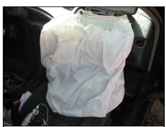
Figure 9 - Deployed front right air bag.