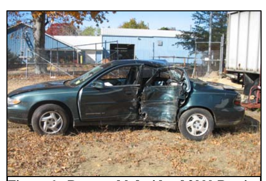
Figure 6 - Damaged left side of 2000 Pontiac Grand Prix.

The 2000 Pontiac Grand Prix sustained moderate damage as a result of the left and right side impacts with the hardwood trees ( Figures 6 and 7 ). The direct contact damage for the first impact began 36 cm (14") forward of the left rear axle and extended forward another 94 cm (37"). The Field L measurement was taken from deflection point to deflection point due to minor bowing present on the vehicle. It began 6 cm (2.5") aft of the left rear axle and extended forward 216 cm (85") to the left A-pillar. The maximum crush