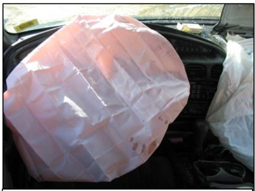
Figure 8 - Deployed driver's air bag.