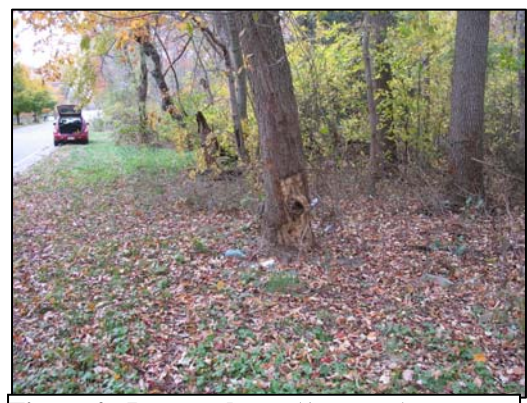
Figure 4 - Impacted tree (1st event).

After the initial impact, the Pontiac rotated counterclockwise 240 degrees responding to the previous narrow impact behind the vehicle's center of gravity. As the vehicle rotated, the left rear door area contacted a 28 cm (11") diameter hardwood tree ( Figure 5 ). For the second impact, the damage algorithm of the WinSMASH program computed a total delta-V of 11 km/h (6.8 mph) based on the crush profile. The specific longitudinal and lateral components were 4 km/h (2.5 mph) and -10 km/h (-6.2 mph), respectively. The vehicle came to final rest against the 28 cm (11") diameter tree.