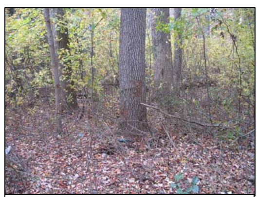
Figure 5 - Impacted tree (2nd event).