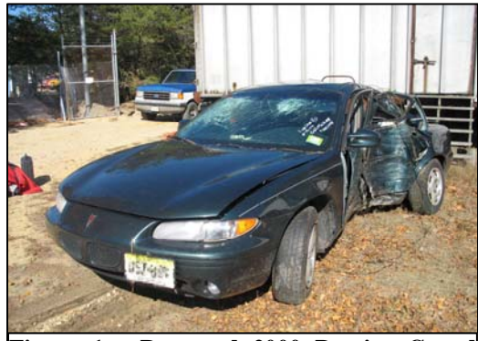
Figure 1 - Damaged 2000 Pontiac Grand Prix.

This on-site investigation focused on the performance of a high back booster Child Safety Seat (CSS) that was installed in a 2000 Pontiac Grand Prix four-door sedan ( Figure 1 ). The vehicle was occupied by an unrestrained 25-year old driver, an unrestrained 27-year old male seated in the front right position, and a 3-year old male seated in the booster seat in the right rear position. The 3-year old male was restrained by the manual lap and shoulder belt within the CSS. The CSS was positioned on the right side of the second row seat. The Pontiac was equipped with frontal air bags for the driver