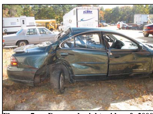
Figure 7 - Damaged right side of 2000 Pontiac Grand Prix.

The direct contact damage for the second impact began 112 cm (44") aft of the front right axle and extended rearward 41 cm (16"). The combined direct and induced damage began 185 cm aft of the front right axle and extended rearward 150 cm (59"). The maximum crush was located 142 cm aft of the vehicle's side centerline and measured 21 cm (8.3") in depth. The crush profile consisted of six equidistant crush measurements taken along the level of the mid-door and was as follows: C1 = 4 cm (1.6"), C2 = 14 cm (5.5"), C3 = 12 cm (4.7"), C4 = 4 cm (1.6"), C5 = 0