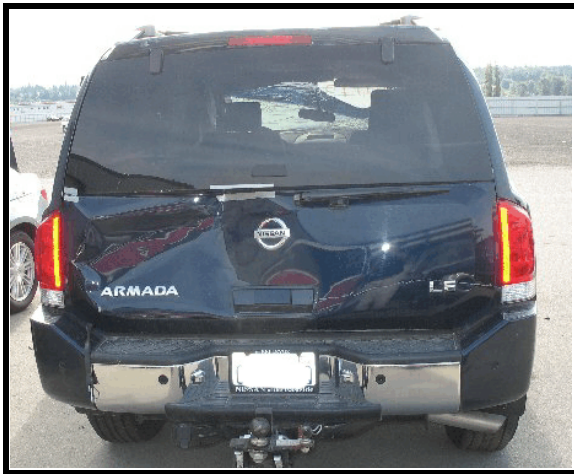
Figure 3. Trailer damage, Nissan Armada

Both right side doors were jammed shut. The windshield cracked. It was later holed by heat sag. The third row right side glass disintegrated.