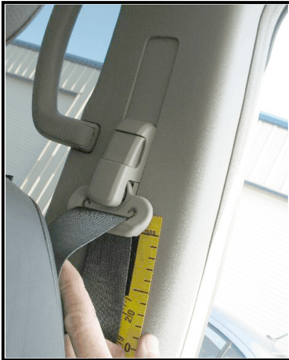
Figure 9. Load marks to driver's seat belt webbing

The right front seat belt had a sliding latch plate and a switchable ELR/automatic locking retractor (ALR). The second and third row safety belts had sliding latch plates and switchable ELR/ALR retractors.