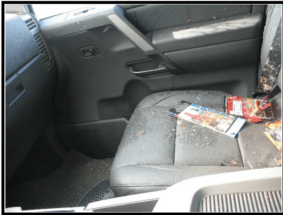
Figure 7. Front right door/B pillar intrusion