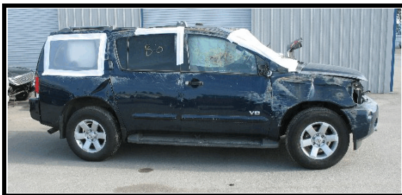
Figure 5. Right side rollover damage