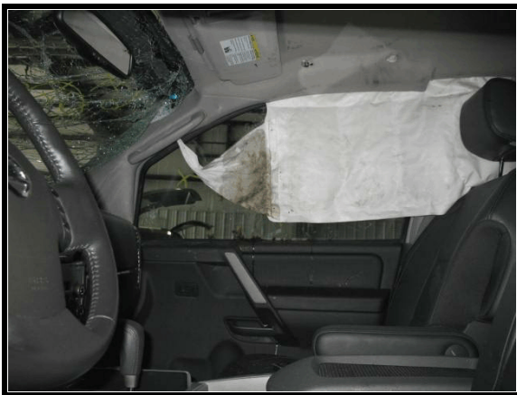
Figure 11. Front right IC

The side IC bags deployed from the roof rail cladding. The IC bags provide coverage for all three rows of seats. The IC was anchored to the A pillar in the front by a tether/sail that measured 34.0 cm (13.4 in) along the base by 27.0 cm (10.6 in) along the top. The IC height at this location was 39.0 cm (15.4 in). The IC extended rearward to the C pillar for 159.0 cm (62.6 in). The IC height at this location was 43.5 cm (17.1 in). There was a gap of 28.0 cm (11.0 in) between the IC in the second row seat and the IC in the third row seat. The IC that covered the third row was connected to the second row IC by a 63.0 cm (24.8 in) tether. The IC in the third row was 63.0 cm (24.8 in) wide by 53.0 cm (20.9 in) high.