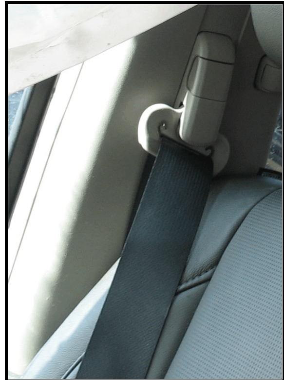
Figure 10. Front right passenger seat belt D ring/shoulder adjustment