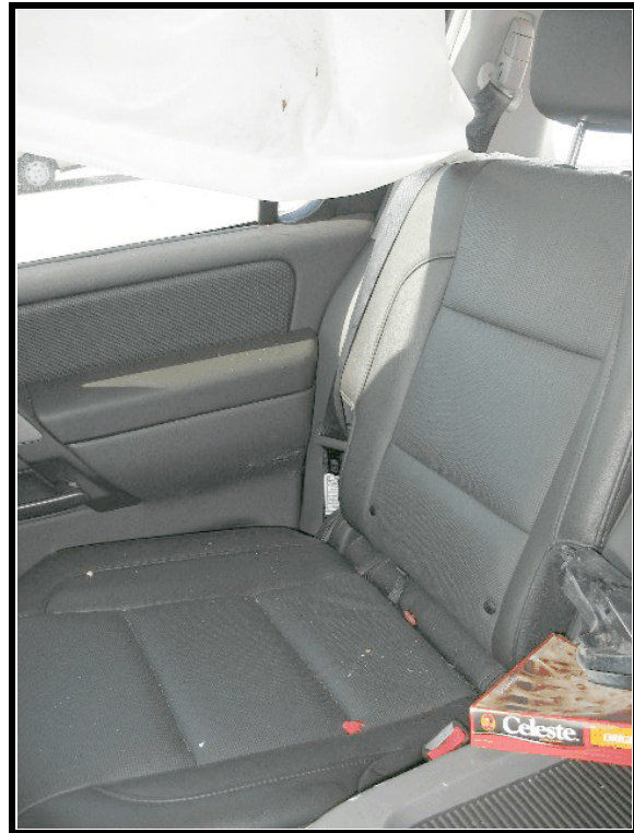
Figure 8. Second row right door intrusion