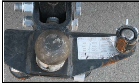
Figure 4. Damage to trailer hitch