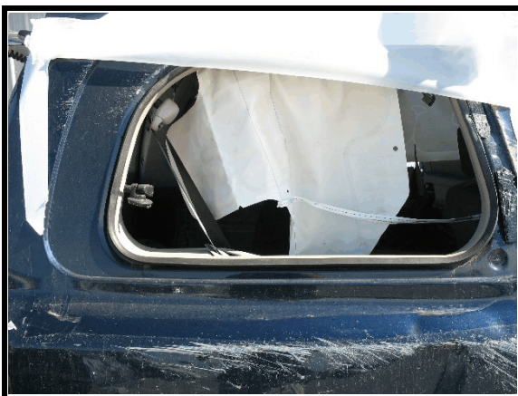
Figure 13. Exterior view of third row portion of side IC