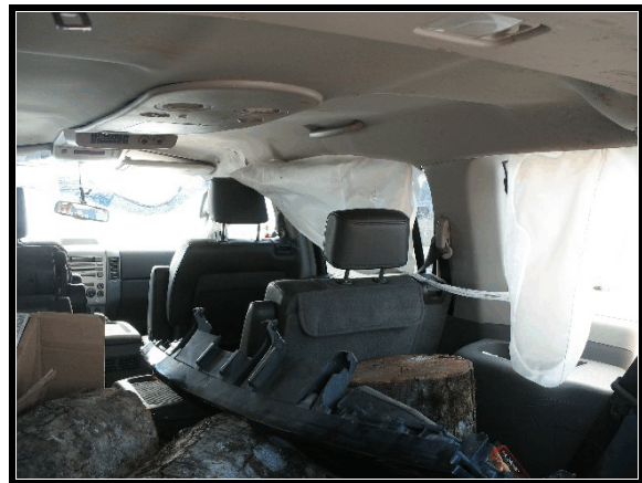
Figure 12. Right side deployed IC