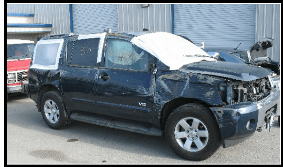
Figure 1. Rollover damage, 2006 Nissan Armada

This on site investigation focused on a 2006 Nissan Armada (Figure 1) that was involved in a rollover crash. This single vehicle crash occurred in May 2007 at 1805 hours. The crash occurred on a three-lane divided interstate highway. The speed limit at this location is 115 km/h (70 mph). The case vehicle was a 2006 Nissan Armada that was being driven by a restrained 45-year-old male. There were three additional occupants in the vehicle, including a 43-year-old female front right seat occupant, a 7-year-old female second row left occupant, and an 11-year-old male second row right occupant. All occupants were restrained.