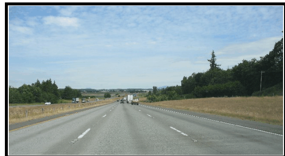
Figure 2. Area of overturn (north)

This single vehicle crash occurred in May 2007 at 1805 hours. The crash occurred on a three-lane divided interstate highway (Figure 2). At the time of the crash, there were no adverse weather conditions and the concrete roadway surface was dry. The highway was configured with three lanes that were separated by broken white lines. The roadway was bordered on the east by an asphalt shoulder that was separated from the roadway by a solid white line. The roadway was bordered on the west by an asphalt shoulder that was