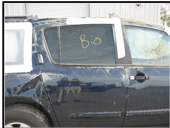
Figure 6. Close up of rollover damage