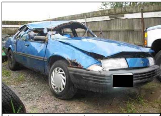
Figure 1 – Damaged front and left side of the 1992 Chevrolet Cavalier.

This on-site investigation focused on the performance of a high back Belt Positioning Booster Safety Seat (BPBSS) that was present in a 1992 Chevrolet Cavalier four-door sedan. There were two occupants in the Chevrolet; a restrained 26-year old male driver and a 2-year old male child passenger who was restrained by the manual lap and shoulder belt within the BPBSS. The BPBSS was positioned on the right side of the second row seat. The Chevrolet was involved in a five-quarter turn rollover crash ( Figure 1 ). The driver of the