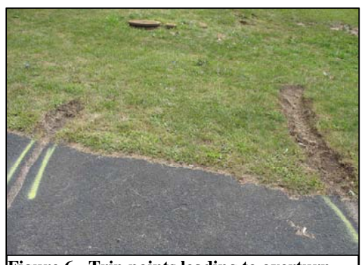
Figure 6 - Trip points leading to overturn.

At approximately 5 m (16') past the point of departure from the asphalt driveway, the vehicle tripped into a five-quarter turn rollover event resulting in moderate damage to the sides and top of the vehicle. During the rollover sequence, the vehicle's left side contacted a manhole cover that protruded from the ground 5 cm (2.5"). This object did not alter the vehicle's path or create an obstructed rollover and was therefore integrated into the rollover sequence. The vehicle came to final rest on its