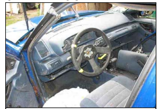
Figure 10 - Contact pattern along the left and center instrument panel.

vertically 16 cm (6.3"). The intrusions listed by their magnitudes are outlined below this section in a table format. Only four occupant contact points were identified during the SCI inspection. The left aspect of the steering wheel rim was deformed 3 cm (1"), the flange was bent, and the left shear capsule bracket was compressed approximately 1 cm (0.5"). It is possible that the driver's chest loaded the component during the rollover sequence. The second contact point identified was the left aspect of the driver's lower knee bolster. The