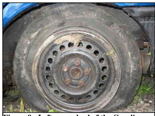
Figure 9 - Left rear wheel of the Cavalier.

The right fender sustained 136 cm (53.5") of damage in the form of vertical abrasions with the maximum crush totaling 18 cm (4"). The right front door exhibited a 30 cm (12") field of damage that was located at the rub strip 30 cm (12") above the sill and 3 cm (1") forward of the right rear door edge. The right quarter panel also exhibited vertical abrasions that were 81 cm (32") in length that began 33 cm (13") forward of the right rear bumper corner. Vertical abrasions were also present on all three right side pillars. All of the right side damage occurred during the rollover sequence.