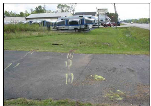
Figure 5 - Deep gouging across asphalt driveway leading to point of impact.

the left rear tire was 19 m (62') in length and had a radius of 57 m (187'). As the vehicle traversed the asphalt driveway, additional load was placed on the outboard sidewalls of left side tires. The tread rolled under the wheels and the tires de-beaded resulting in an air out of the tires. With the absence of air pressure, the left rims loaded the asphalt driveway, the soft soil and the grass at the apex of the ditch. This resulted in damage to the steel rims and deep gouges to the roadside. The damage to the left side rims as a result of contacting the asphalt driveway was circumferential along the outer