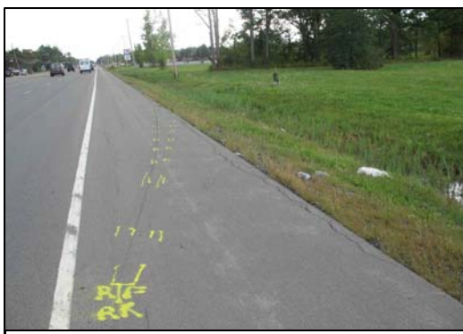
Figure 3 – CCW yaw marks leading to the right side road departure.

As the vehicle initially lost control off the right roadside the right side tires transferred significant amounts of yaw marks onto the asphalt roadway ( Figure 3 ). The CCW tire marks attributed to the right front wheel was 39 m (128') in length and had a radius of curvature of 159 m (522'). The CCW markings attributed to the right rear wheel were 46 m (151') in length and had a radius of 133 m (436'). Using the average radius of curvature of the right side yaw marks and the critical speed formula, the Cavalier was estimated to be traveling at 109 km/h (68 mph). The following equation was used to determine the critical speed: