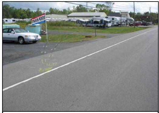
Figure 4 - CW yaw marks leading to the left side road departure.

The lengths of the left front and left rear tire marks on the west shoulder were minimally curved and were 4 m (13') and 7 m (23'), respectively. Following a separation of tire marks from the west fog line, a CCW yaw mark was present that began at the outer aspect of the southbound inboard lane and terminated at the midpoint of the center turn lane. The tire mark, which was 13 m (43') in length and had a radius of curvature of 53 m (174'), resulted as the vehicle off-tracked toward the left side of the roadway. This mark was attributed to the