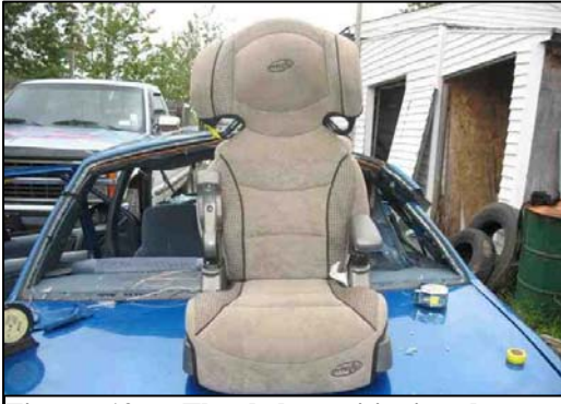
Figure 12 - The belt positioning booster safety seat.

A BPBSS was installed in the second row right seating position of the 1992 Chevrolet Cavalier ( Figure 12 ). The Model Number was 3371689A and the Date of Manufacture was 12/02/2006. The BPBSS had no internal hardware such as a harness or retainer clip. The BPBSS was designed with a detachable seatback. The BPBSS with the detachable high back installed was rated for children between 14 – 45 kg (30 – 100 lbs.) and between 96 – 145 cm (38 – 57"). If it was used with the high back component of the BPBSS detached, it was rated