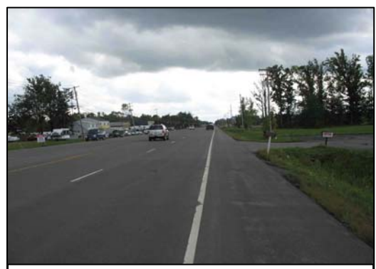
Figure 2 - Southbound approach of the Cavalier.

The 26-year old male driver of the Cavalier was traveling southbound on the inboard lane of the five-lane roadway and was approaching a "T" intersection ( Figure 2 ). A non-contact vehicle was reportedly entering the five-lane roadway from the intersecting road and was intending to travel southbound on the Cavalier's established lane of travel. In response to the encroachment of the non-contact vehicle, the driver of the Cavalier initiated a right steering input in an attempted avoidance maneuver. After initiating this action, the Cavalier traveled in a southwest