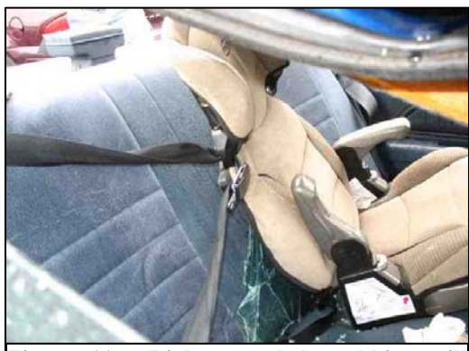
Figure 11 - Right rear belt webbing still engaged in the BPBSS belt path.

The second row consisted of manual lap and shoulder restraints for the outboard positions and an adjustable length lap belt for the middle position. The outboard restraints were configured with ELR's and locking latch plates. The second row middle position also had a locking retractor. Upon arrival at the vehicle inspection, the right rear shoulder restraint was routed through the right side shoulder belt path of the BPBSS (Figure 11). The webbing was twisted three revolutions, a 4 cm (1.2") abrasion was present on the shoulder webbing and a correlative abrasion was present within the