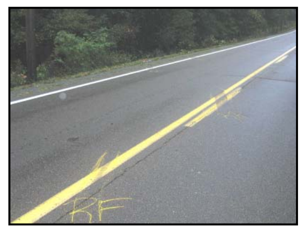
Figure 4: View of the yaw marks.

The Ford departed the west road edge. The vehicle had rotated approximately 86 degrees counterclockwise relative to its northbound travel direction. As the vehicle departed the road, the front right passenger reported that he released his safety belt and moved toward the center of the vehicle. The vehicle travelled down the roadside embankment with a right side leading attitude and contacted several small diameter trees and a deteriorated fence post with the right side plane.