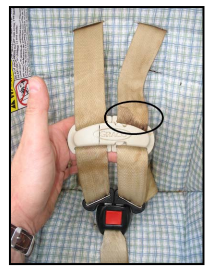
Figure 11: Harness straps.

removed. The upper arch of the shell's back was heavily stressed from impact by the intruding roof. The shell was stressed over a 46 cm (18 in) arc length. The infant's head was located in this area and directly contacted the roof. A 25 cm (10 in) long linear fracture was also observed. The shell fractured laterally through the molded cut-outs for the shell's release handle and 6 cm (2.4 in) down the left side to the molded reinforcement below the left harness strap slot. Figure 13 is a view of the back side of the shell and the fracture line. Additional stress marks were observed to the forward right aspect of the shell in the area of the infant's feet ( Figure 14 ). This region of stresses developed as the shell was compressed downward and rearward into the vehicle's seat back by the intruding roof. The examination of the belt path cut-outs was unremarkable for crash related evidence.