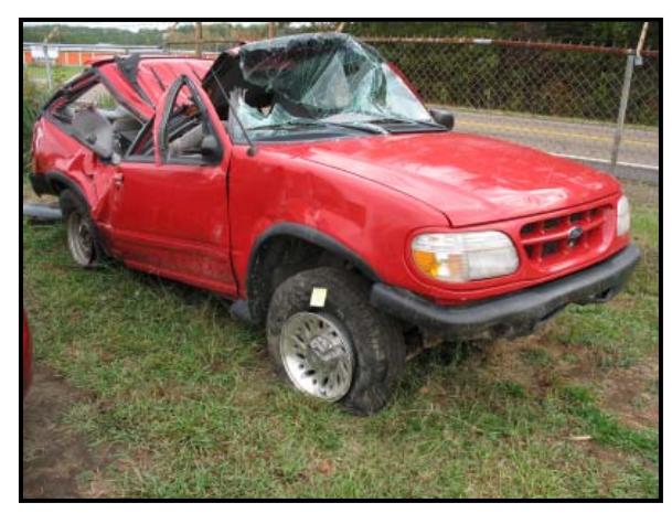
result of the roof impact. This area began 3 cm (1 in) forward of the right rear axle.

The Ford Explorer sustained contact damage to its right, top and left planes as a result of the crash. Figure 5 is a front right oblique view of the Explorer. The right plane sustained minor body panel deformation to the right fender as a result of the small tree/brush contacts. The fender was deformed over a 53 cm (21 in) length that began at the right front axle location and extended The maximum deformation in this rearward. region measured 4 cm (1.5 in). A 10 cm (4 in) region of the right rear quarterpanel was deformed to 6 cm (2.25 in) depth as a result of contact to a fence post. This deformation was located 50 cm (19.5 in) aft of the rear axle. A 55 Figure 5: Front right oblique view of the Ford. cm (21.5 in) area of the right side plane sustained 14 cm (5.5 in) of induced vertical crush as a