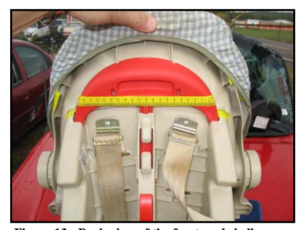
Figure 13: Back view of the fractured shell.