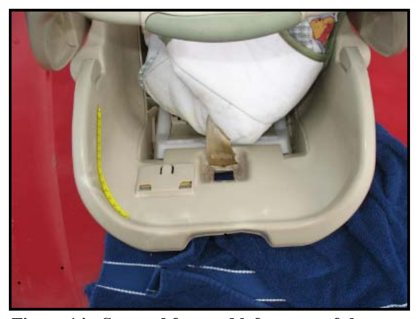
Figure 14: Stressed forward left aspect of the shell.