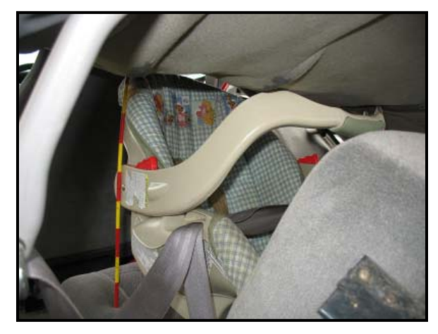
Figure 10: Left rear oblique view.

Inspection of the CSS revealed multiple stressed areas (whitened plastic) and a fracture of the shell. Blood evidence was identified on the right strap, immediately above the retainer clip, Figure 11 . Reportedly, the infant was bleeding from the right ear indicative of a basilar skull fracture. The shell's carrier handle was jammed in a forward position (toward the foot area of the shell). The intruding roof contacted the (vertically positioned) handle, and caused it to rotate forward (opposite its normal rotation) and become jammed. The fabric covering the CSS shell was removed during the SCI inspection. Figure 12 is a view of the shell with the fabric