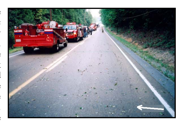
Figure 3: On-scene trajectory view of the yaw marks.

The investigating police officer documented the marks with photographs and basic measurements. Figure 3 in a north trajectory view at the initiation of the right rear yaw mark. The yaw mark began in the outer third of the travel lane (denoted by the arrow). The mark initially traveled toward the east edge line and then arced to the northwest. The length of the right rear yaw mark measured 47 m (155 ft). The right front yaw mark measured 35 m (115 ft). Due to the passage of time between the crash date and the SCI on-site inspection, the yaw marks in the travel lanes had deteriorated. The physical