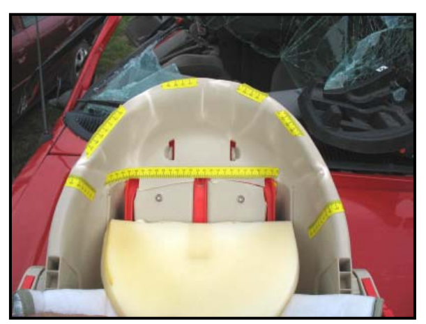
Figure 12: Stress marks and fracture across the arch of the upper shell