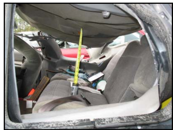
Figure 7: Measurement of the residual roof

The driver's restraint consisted of a three-point height above the left rear seat cushion. lap and shoulder belt with continuous loop