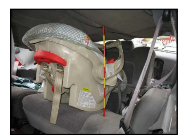
Figure 9: Left front oblique view of the reinstalled CSS.

The driver installed the CSS within the vehicle by threading the lap and shoulder belt through the cut-outs of the belt path and buckling the latch plate. She indicated that she removed the slack from the webbing, pulling it tight across the shell. She then set the switchable retractor to the automatic locking mode and fed the balance of the webbing back into the retractor. The carrier handle was in the vertical position. The harness retainer clip was over the mid-chest and the harness straps were reported as "snug" on the infant's shoulders. Figures 9 and 10 are a view of the CSS reinstalled within the Explorer.