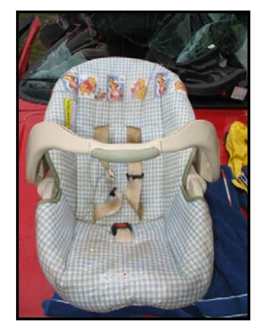
Figure 8: Front view of the Graco Snugride.

Figure 8 is a front view of the Child Safety Seat (CSS) in use at the time of the crash. The CSS was a Graco Snugride rearfacing infant seat Model No: 7350D0H2, Serial No: JJ0910050936, manufactured September 10, 2005. The CSS without the base was installed in the rear left position of the Ford Explorer, using the vehicle's 3-point lap and shoulder, in a rearfacing mode. The seat was labeled for use by infants that weighed between 2 kg to 10 kg (5 lb to 22 lb) with a height of 74 cm (29 in) or less. The CSS was configured with a 5-point harness system. The harness was routed through the top slots. The harness straps were flat and were not folded over, roped, or creased. The harness retainer clip was present and operational. The two-piece latch plate and buckle assembly operated as designed.