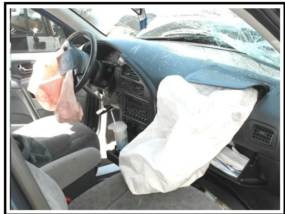
Figure 6. The left and right frontal air bags deployed

The front right passenger's air bag deployed from a mid-mount module with a rectangular cover flap that was hinged at the forward aspect. The module cover flap measured 37 cm (14.6 in) in width and 19 cm (7.5 in) in height. The deployed front right passenger's air bag measured 37 cm (14.6 in) in width seam to seam and 50 cm (19.7 in) in height. The air bag had two vent ports, one on each side near the upper corners. There were several black streak markings that are suspected to have been caused during the deployment. There was suspected dried blood within an area 24 cm (9.5 in) x 12 cm (4.7 in).