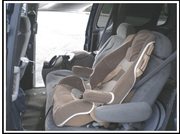
Figure 7. Dorel High Backed Booster

A forward facing child safety seat was positioned on the second row left seat ( Figure 7 ). The data for this seat was obtained from police photographs, which revealed that the seat was a Dorel High Back Booster. The child seat was designed to be used forward facing only. The child seat was configured with a 5-point harness system with a retainer clip. The child seat was configured with LATCH (Lower Anchors and Tethers for Children) hardware. There were two lower anchor assemblies on the bottom and an upper tether on the back. The manufacturer recommended that the seat be used only by children more than one year of age, and weighing between 22 - 40 pounds (10.1 - 18.0 kg), and whose height is between 34 - 43 inches (85.1 - 110 cm). The manufacturer recommended that the child seat can be secured by either lap belt only, lap and shoulder belt, or LATCH only.