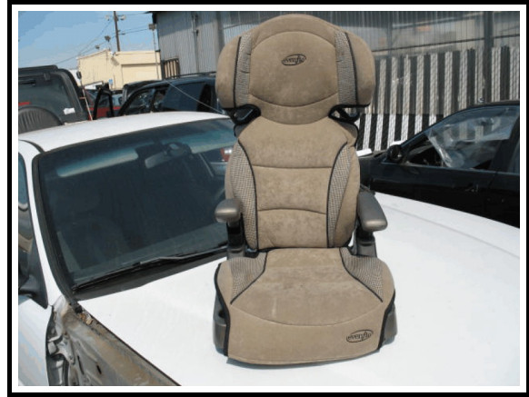
Figure 8. Evenflo Big Kid Deluxe booster seat

A forward facing child seat was positioned on the second row right seat ( Figure 8 ). The seat was an Evenflo Big Kid Deluxe high back belt positioning booster seat. The model number was 3371689A and the date of manufacture was April 11, 2007. The booster seat was to be used forward facing only and was not configured with integrated harness straps. The seat was configured with pivoting armrests, retractable drink/snack holders, and 5-position height and seat depth adjustments.