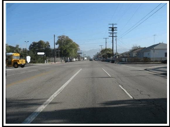
Figure 2. Eastbound approach for the Nissan Quest.

The front end of the Nissan impacted the right side of the Chevrolet. As the vehicles were engaged they initiated a clockwise rotation. Following the impact, the Nissan traveled approximately 10.1 meters (33.1 ft.) before impacting a curb on the south roadway edge with its front end, where it came to final rest facing south. The Chevrolet traveled approximately 9.9 meters (32.5 ft.) before striking a curb near the southeast corner with its right front tire, where it came to final rest.