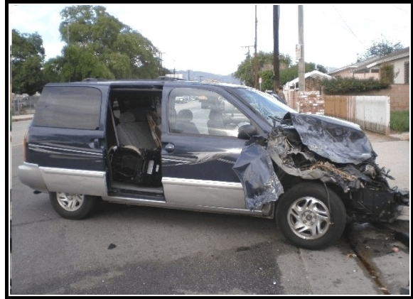
Figure 1. Subject vehicle, 2001 Nissan Quest

This child safety seat investigation was initiated in response to an online news article that reported injuries to a child may have been due to the improper use of child restraints. DSI was assigned the case on October 11, 2007. Copies of the police report and on-scene photos were obtained on October 3, 2007. The subject vehicle was being held in a tow facility and the booster seat was located in the vehicle. The Nissan and the booster seats were inspected on October 11, 2007. The 1984 Chevrolet Silverado was inspected on October 19, 2007, and the crash scene was inspected on November 2, 2007.