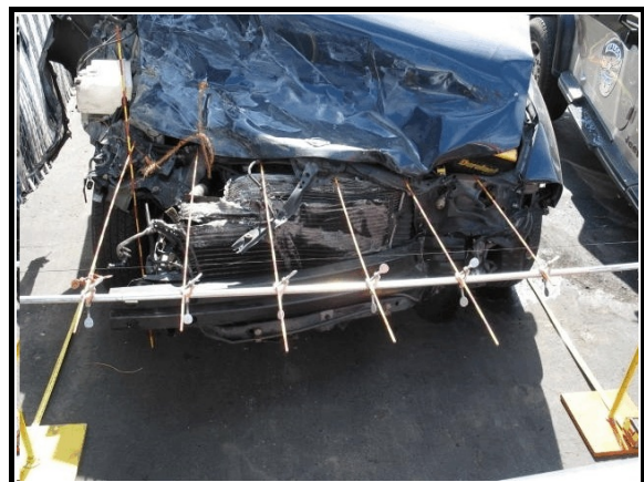
Figure 5. Gauge set at upper radiator support