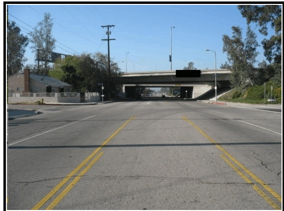
Figure 3. Westbound approach for the Chevrolet Silverado