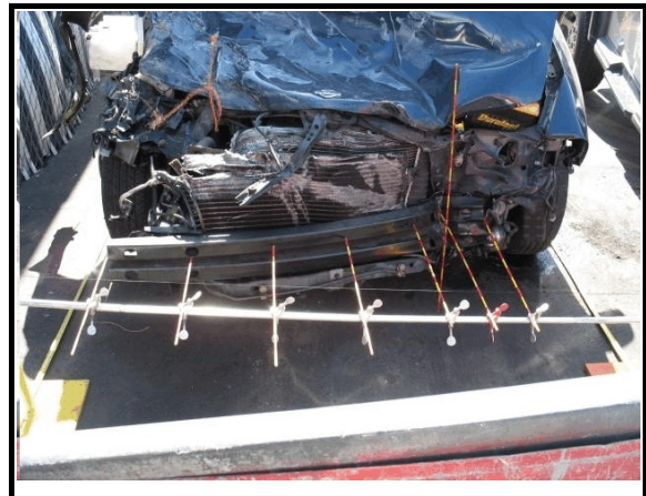
Figure 4. Crush gauge set a bumper level

Six crush measurements were taken at bumper level as follows: C1 = 29 cm (11.4 in), C2 = 31 cm (12.2 in), C3 = 21 cm (8.3 in), C4 = 13 cm (5.1 in), C5 = 4 cm (1.6 in), C6 = 0 cm. Maximum crush at bumper level was located between C1 and C2 and measured 43 cm (16.9 in). The grille was