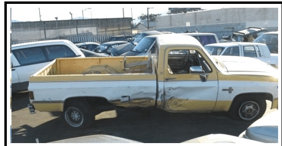
Figure 9. 1984 Chevrolet Silverado

The 1984 Chevrolet Silverado sustained moderate right side damage as a result of the impact with the Nissan ( Figure 9 ). The direct damage began 126 cm (49.6 in) rearward of the right front axle, and extended 218 cm (85.8 in) rearward to the right rear tire. The combined direct and induced damage measured 300 cm (118.1 in). Six crush measurements were taken at mid-door level as follows: C1 = 0 cm, C2 = 2 cm (0.8 in), C3 = 3 cm (1.2 in), C4 = 9 cm (3.5 in), C5 = 11 cm (4.3 in), C6 = 0 cm. Maximum crush at mid-door level was located between C4 and C5 and measured 15 cm (5.9 in). The CDC for the side impact was 02RZEW2.