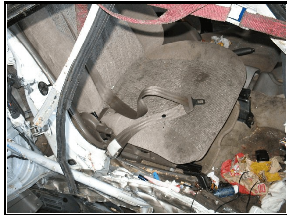
Figure 11. Front row right safety belt

The Mitsubishi was equipped with 3-point manual lap and shoulder safety belts for the front and second row outboard seating positions. The second row center seat was equipped with a manual lap belt. The lap and shoulder belts were equipped with sliding latch plates; the lap belt was equipped with a locking latch plate. The front row safety belts were equipped with adjustable anchorages that were each adjusted to the full up position. The second row safety belts were not equipped with adjustable anchorages.