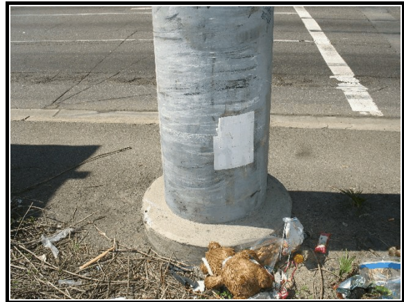
Figure 5. Point of impact with steel utility pole