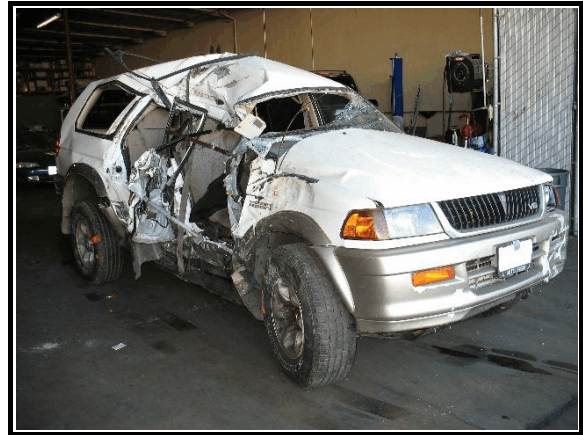
Figure 1. 1998 Mitsubishi Montero Sport

This on site investigation focused on a child safety seat that was installed in the second row of a 1998 Mitsubishi Montero Sport ( Figure 1 ). The Mitsubishi was involved in a single vehicle crash with a metal utility pole. The crash occurred off-road on the southeast corner of an intersection. The Mitsubishi was being driven by a restrained 27-year-old female, and the first row right seat was occupied by a restrained 27-year-old male. The second row right seat was occupied by a 23-month-old female who was seated in a Cosco/Dorel High Back Booster Seat. The Mitsubishi was exiting a state highway on an exit ramp and drove off the left side of the roadway. The Mitsubishi crossed a paved shoulder and traveled over a raised concrete curb. The vehicle continued traveling over unpaved ground and knocked down a chain link fence with its front end. After driving through the fence, the vehicle contacted a steel utility pole with its right side. The Mitsubishi then traveled a short distance further before impacting a sign post and reentering the roadway. The vehicle came to rest facing north in a northbound lane.