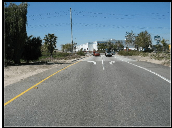
Figure 2. Approach view, exit ramp

The exit ramp ran northwest, and intersected the north/south roadway at an angle of 104 degrees from due north. The intersection was controlled by tri-color signal lights for all travel lanes. The north/south roadway consisted of three northbound lanes and two southbound lanes, with a raised concrete divider separating northbound and southbound traffic. The crash occurred during daylight hours. The weather was clear and winds were calm.