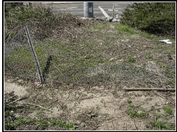
Figure 4. Point of impact with fence

The 1998 Mitsubishi Montero was identified by the Vehicle Identification Number (VIN): JA4LS31P0WPxxxxxx. The date of manufacture was June 1997. The mileage was unavailable due to the electronic odometer and absence of power to the vehicle. The Mitsubishi was equipped with a 3.0 liter, 6-cylinder engine, a 4-speed automatic transmission, rear wheel drive, and disc brakes. The vehicle manufacturer's recommended tire size was 265/70R15, and the recommended tire pressure was 179 kPa (26 psi). The Mitsubishi was configured with four Michelin LTX M/S tires, size 30 x 9.50R15LT. The tire manufacturer's maximum tire pressure was 345 kPa (50 psi). The specific tire information was as follows: