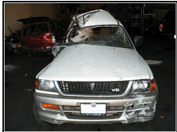
Figure 6. Frontal view showing damage from fence impact

There were three events during the crash sequence. The first event was a front end impact with a chain link fence ( Figure 6 ). The fence impact was a low Delta V event; the fence posts were bent and the fence yielded as the vehicle continued to travel forward. The direct damage began at the left front bumper corner and extended 160 cm (63.0 in) to the right front bumper corner. Much of the direct damage was limited to surface scratches and chipped paint. There was denting to the front left bumper, the left front headlamp was broken, and there was minor denting to the left front of the hood. The field L for the frontal impact began at the left front bumper corner and extended 49 cm (19.3 in) to the right. There was no crush to the front bumper. The Collision Deformation Classification (CDC) for the first impact was 12FDEW1.