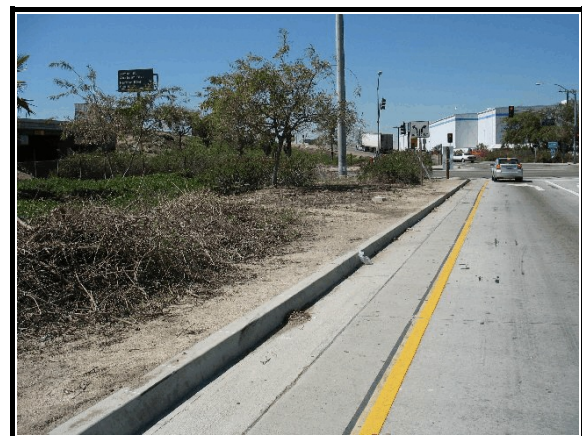
Figure 3. Scene, left roadside departure

The 1998 Mitsubishi Montero was traveling northwest on the exit ramp. On the straight, concrete section of the exit ramp, the driver of the Mitsubishi lost control of the vehicle. Tire marks observed at the scene indicated the Mitsubishi initiated a left side roadway departure 42.2 m (138.6 ft) east of the intersection ( Figure 3 ). At 40.5 m (132.8 ft) east of the intersection, the Mitsubishi traveled over the curb and onto the unpaved ground on the southeast corner of the intersection. The Mitsubishi traveled off the roadway for a distance of 27.1 m (88.9 ft) and contacted a chain link fence which stood approximately 1.5 m (5.0 ft) high ( Figure 4 ) The front left bumper of the Mitsubishi sustained minor contact damage as a result of the impact. The Mitsubishi then traveled another 8.5 m (28.0 ft) where the right side of the Mitsubishi contacted a steel utility pole ( Figure 5 ). The Mitsubishi began a clockwise rotation and traveled a short distance