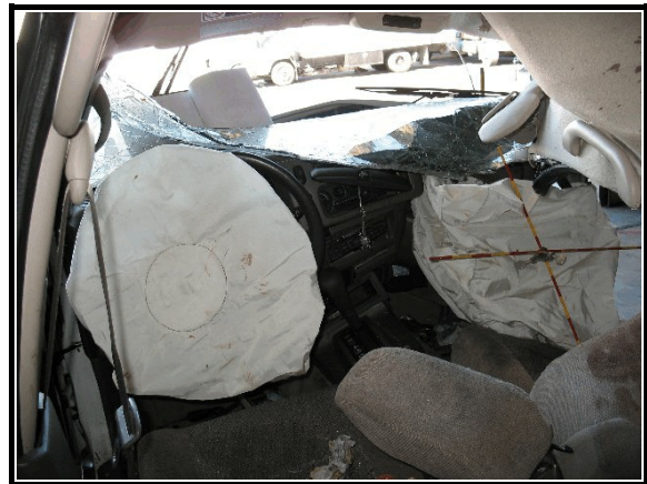
Figure 12. First row frontal air bags

The driver's air bag deployed from the center of the steering wheel hub through a single module cover flap. The flap measured 12 cm (4.7 in) in height and 17 cm (6.7 in) in width. The deployed driver's air bag measured 50 cm (19.7 in) in diameter in its deflated state. There were two vent ports, one on either side near the top cover flap. There were a few small deposits of suspected dried blood on the front of the bag.