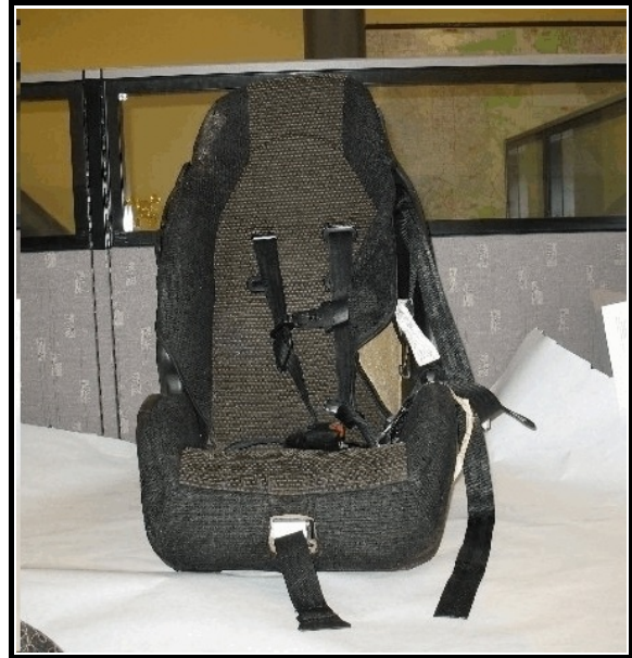
Figure 13. Cosco/Dorel High Back Booster Seat

The CSS shell exhibited a large area of scuffing on the headrest. There was crazing along the top edge of the shell and on the right side. The damage was a result of intrusion during the pole impact. The child was decapitated during the impact and there was a considerable amount of dried body tissue on the right side of the CSS cover, contiguous to the headrest. There were traces of dried body tissue and fluid on the harness straps and retainer clip.