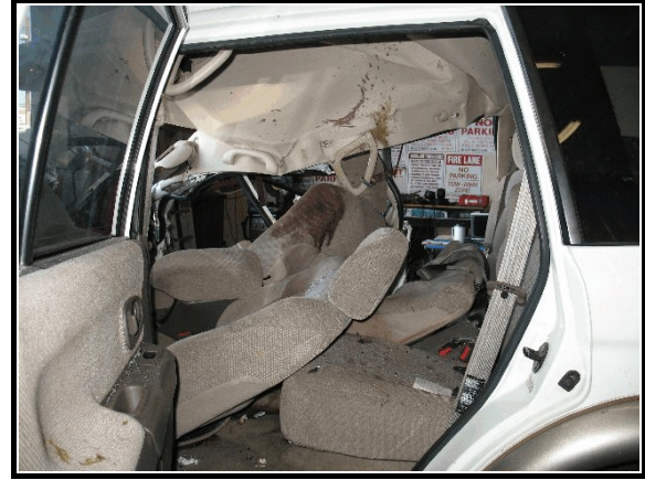
Figure 10. First and second row intrusions

The specific passenger compartment intrusions were as follows: