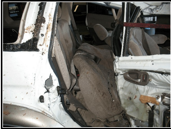
Figure 9. Second row intrusion, seat deformation

The 1998 Mitsubishi Montero sustained moderate interior damage as a result of passenger compartment intrusion. The windshield was out of place and holed. All the right side glazing was disintegrated. There was hinge damage to the right side doors and the front row right door panel was displaced from the vehicle. There was lateral intrusion to the middle seat positions of the front and second rows. The front row seats intruded longitudinally into the second row, and deformed and displaced the seat cushion ( Figures 9-10 ).