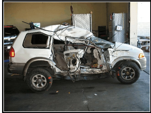
Figure 7. Right side view showing damage from utility pole impact

The third event was a left side impact with a wooden sign post ( Figure 8 ). The direct damage began 20 cm (7.9 in) forward of the left rear bumper corner and extended 45 cm (17.7 in) forward. The vertical measurement of the damage began at bumper level and extended 90 cm (35.4 in) up the D pillar. The CDC for the second impact was 10LBAW2.