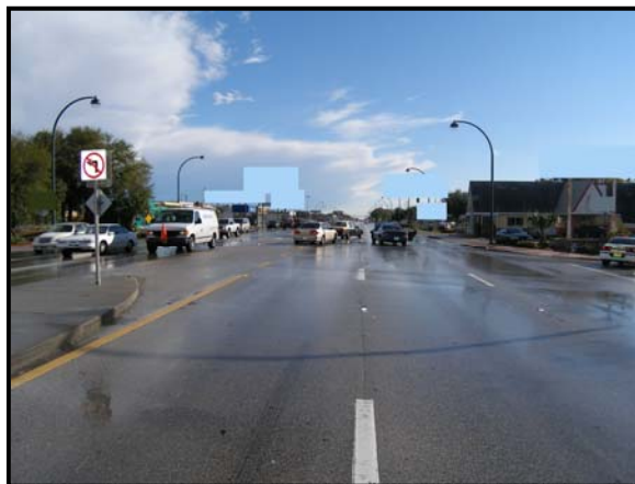
Figure 2: Southward view of the crash site.

Figure 2 is a police image of the crash site looking to the south depicting the intersection and the final rest positions of the vehicles. Due to the wet road surface, no tire marks were observed at the scene by the investigating police officers.