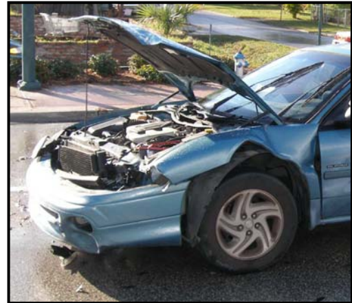
Figure 4: Left lateral view at the front plane of the Dodge.