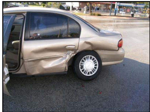
Figure 5: Left side view of the Chevrolet's impact damage.

Figure 5 is a left side view of the damaged Chevrolet. The damage began in the area of the left B-pillar and extended rearward across the left rear door and quarterpanel to the left rear corner. The damage pattern was an estimated 254 cm (100 in) in length. The estimated residual crush profile along the mid door elevation as follows: C1 = 5 cm (2 in), C2 = 10 cm (4 in), C3 = 15 cm (6 in), C4 = 15 cm (6 in), C5 = 10 cm (4 in), C6 = 2 cm (1 in). The left rear tire/wheel was directly involved in the impact. The upper aspect of the tire was deformed inboard indicating bending of the axle. The left rear door was jammed shut by the deformation. There was no damage to the windshield, side glazing or backlight. The CDC of the Chevrolet was determined to be 10-LZEW2.