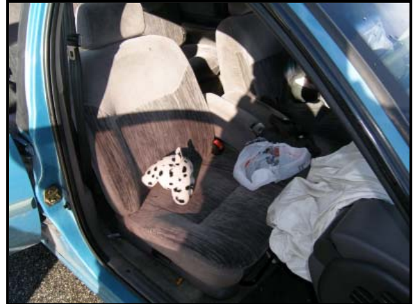
Figure 6: Front right passenger seat of the Dodge.

The interior damage to the Dodge was limited to the deployment of the vehicle's frontal air bags. There was no occupant compartment intrusion from the exterior crash force. The available police images did not adequately document the Dodge's interior in order to determine specific points of occupant contact. The driver seat was adjusted to a mid-track position. The front right seat was adjusted to a rear track position. The seat track adjustment was based on a review of the police images, Figure 6 .