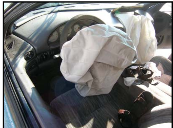
Figure 7: Front interior view of the Dodge.

The 1996 Dodge Intrepid was equipped with 1 st -generation driver and front right passenger air bags that deployed as a result of the crash. The driver air bag deployed from a module that was located in the center hub of the steering wheel rim. Figure 7 is a view of the deployed driver air bag. There was no residual driver contact evidence observed in the image. The front right passenger air bag deployed from a top-mount module located in the right aspect of the instrument panel. The module cover flap was rectangular and hinged at its forward aspect. The cover flap did not appear to be damaged (refer to Figure 7 ). The child passenger's contact to the deploying front right air bag membrane was not documented by the police investigators.