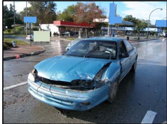
Figure 1: Left front oblique view of the Dodge.

This remote investigation focused on the crash dynamics and injury sources resulting in the death of an 8 year old unrestrained male seated in the front right passenger seat of a 1996 Dodge Intrepid, Figure 1 . The Dodge was equipped with 1 st -generation driver and front right passenger air bags that deployed as a result of a front-to-side impact crash with a 2004 Chevrolet Malibu Classic. Reportedly, the Chevrolet failed to yield the right-of-way and pulled forward from a stopped position at a three-leg intersection across the path of the Dodge. The 49 year old female driver of the Dodge applied the brakes in an attempt to avoid the collision; however, there was insufficient distance for the Intrepid to stop. The crash occurred with the front plane of the Dodge impacting the left rear quarterpanel of the Chevrolet. The force of the impact caused the frontal air bags in the Dodge to deploy.