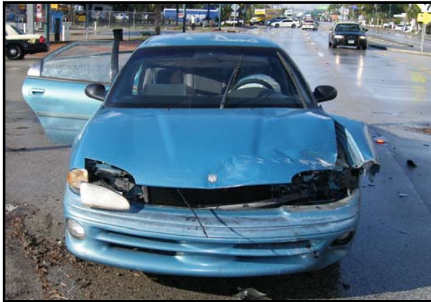
Figure 3: Front view of the Dodge.

direct contact included the bumper fascia, reinforcement bar, left head lamp assembly, hood and left fender. The residual damage was limited to the vehicle's structures forward of the radiator support plane. The police photographs were used to estimate the frontal deformation of the vehicle. The estimated residual crush along the bumper reinforcement bar was as follows: C1 = 23 cm (9 in), C2 = 15 cm (6 in), C3 = 10 cm (4 in), C4 = 5 cm (2 in), C5 = 2 cm (1 in), C6 = 0. The maximum crush was located at C1, the left front bumper corner. The left fender buckled rearward and outboard. The windshield was not fractured and there was no damage to the side glazing or backlight. The Collision Deformation Classification (CDC) of the Dodge was determined to be 01-FYEW1.