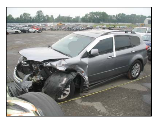
Figure 1: Left front oblique view of the 2008 Subaru Tribeca.

This investigation focused on the Certified Advanced 208-Compliant (CAC) safety system in 2008 Subaru B9 Tribeca (Figure 1) and the injury sources to the 21-year-old female driver. A CAC vehicle is certified by the vehicle manufacturer to be compliant with the advanced air bag portion of Federal Motor Vehicle Safety Standard (FMVSS) No. 208. This advanced occupant protection system was comprised of dual-stage frontal air bags, seat track position sensors, front safety belt buckle switch sensors, front safety belt pretensioners, and a front right occupant detection sensor. The Subaru was also equipped with combination rollover/side impact Inflatable Curtain (IC) air bags and seat-mounted side impact air bags.