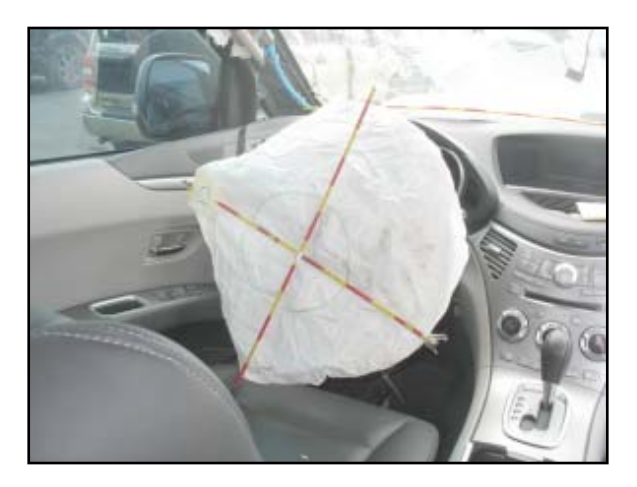
Figure 7: Driver's frontal air bag.

As a result of the crash, the driver's frontal air bag deployed ( Figure 7 ). The driver's air bag was conventionally located in the center of the steering wheel hub and was concealed by three cover flaps. The top cover flap measured 8 cm (5 in) in height and width. The symmetric lower cover flaps measured 7 cm (2.8 in) in height and 6 cm (2.5 in) in width. The air bag measured 61 cm (24 in) in diameter in its deflated state. It was tethered by two straps and was vented by two ports at the 10 and 2 o'clock positions. There was no damage or occupant contact evidence present on the air bag. Dirt was noted on the lower right quadrant of the bag.