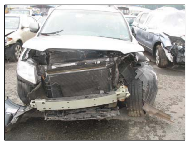
Figure 4: Overall view of the Subaru's frontal damage.