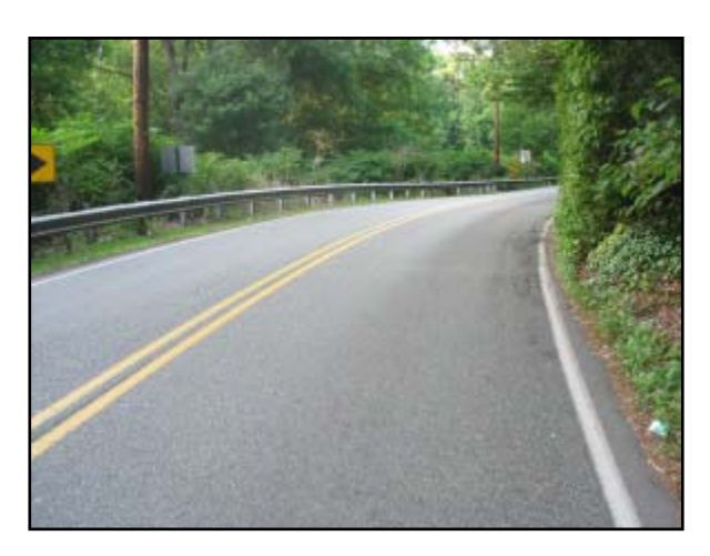
Figure 3: Eastbound trajectory view of the Oldsmobile.