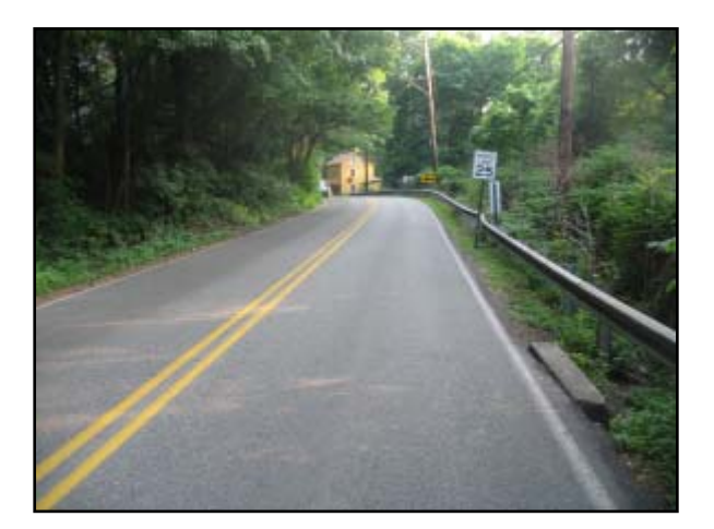
Figure 2: Westbound trajectory view of the Subaru.

The 21-year-old female driver of the Subaru was operating the vehicle westbound on the twolane road in a straight section of the road approaching the curve ( Figure 2 ). A 42-year-old male was operating the 1996 Oldsmobile in the eastbound lane negotiating the right curve ( Figure 3 ). The driver of the Oldsmobile drove straight through the curve, crossed the centerline, and entered the westbound lane. The driver of the Subaru reacted to the errant trajectory of the Oldsmobile by applying the brakes.