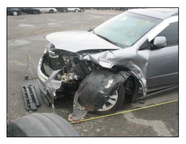
Figure 5: Left lateral view of the Subaru.

door was jammed in the closed position. The right front, rear, and the hatch remained closed during the crash and were operational at the time of the SCI inspection. The windshield was fractured at the lower left aspect. The front side door glazing contained an aftermarket tint film. The side, rear, and sunroof were found closed and undamaged at the time of the SCI inspection.