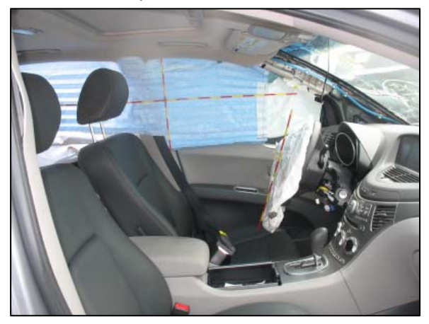
Figure 8: Deployed left side curtain air bag.

A sail panel was attached to the forward aspect of the air bag and coverage the void created at