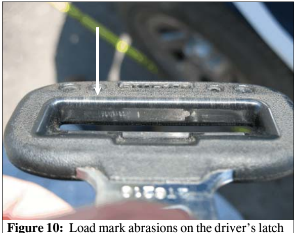
Figure 10: Load mark abrasions on the driver's latch plate belt guide

The driver's latch plate was found latched in the buckle and the seat belt had been cut out of the vehicle. A portion of it was being used to tie the left front door closed. Inspection of the latch plate and D-ring revealed load abrasions on the latch plate belt guide ( Figure 10 ) and the D-ring ( Figure 11 ). The on-scene photographs showed a portion of the cut seat belt across the driver's chest. The evidence indicated that the driver was restrained by the lap-and-shoulder belt. The remaining seat positions were unoccupied.