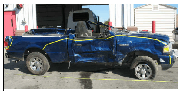
Figure 6: Damage to Ford's right side from the initial touchdown on the north stream embankment during the first quarter turn of the rollover

extricate him. The driver was pronounced deceased by the coroner and transported from the crash scene to a local funeral home. The Ford was towed from the scene due to damage.