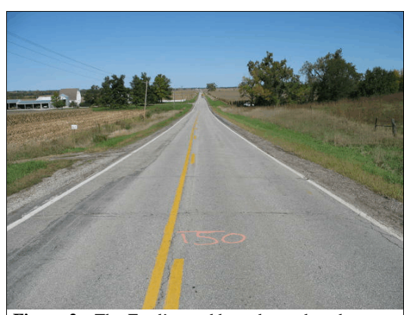
Figure 2: The Ford's northbound travel to the area it began to pass three vehicles

Pre-Crash: The Ford's restrained 47-year-old male driver was traveling north behind two passenger vehicles and a tractor-semitrailer at a witness reported speed of 72 km/h (45 mph). The Ford's driver began to pass the vehicles as they traveled down a 5% negative grade ( Figure 2 ). As the Ford was passing, its left side wheels departed the west edge of the roadway and the driver steered right and reentered the roadway