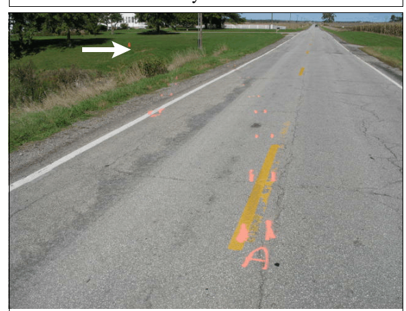
Figure 4: Fords yaw marks leading to area of rollover; yaw mark A is from right rear tire and other mark is from right front tire; arrow shows location of Ford's final rest