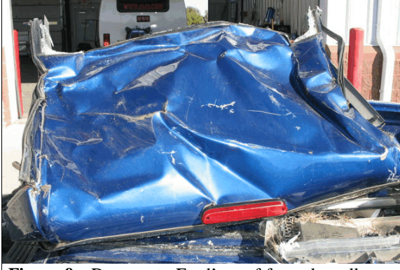
Figure 9: Damage to Ford's roof from the rollover and rescue activities; roof viewed back to front

top plane extended the full length and width of the top. It was not possible to determine the maximum crush to the roof since it had been cut off the vehicle. The direct damage to the right side began 26 cm (10.2 in) forward of the right rear axle and extended 322 cm (126.8 in) forward along the right side. The maximum residual crush to the right side was 25 cm (9.8 in) and