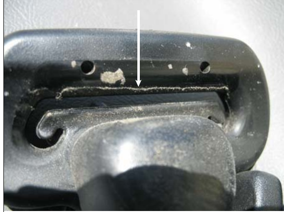
Figure 11: Load mark abrasions on the driver's Dring