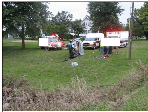
Figure 7: Coroner's on-scene photographs of Ford's final rest position

Exterior Damage: The damage from the rollover involved the top and both sides of the vehicle (Figures 6, 8 and 9). The direct damage to the