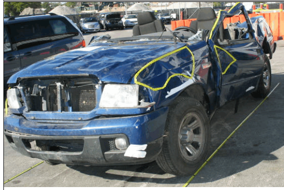
Figure 8: Damage to the Ford's hood and left side from the rollover