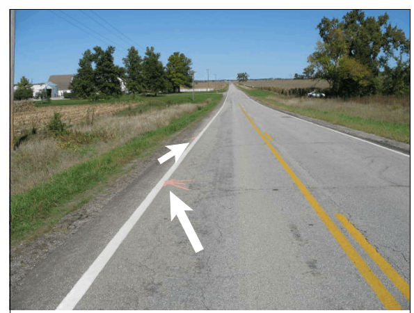
Figure 3: Arrows show police reported area of initial roadway departure and area where Ford reentered the roadway

Post-Crash: The driver of one of the vehicle's that the Ford had passed called 911. The investigating police officer was notified at 0626 hours and arrived on scene at 0650 hours. An ambulance, emergency rescue personnel and the county coroner also responded to the scene. The driver was entrapped within his seat by the crushed roof and rescue personnel cut the top off the vehicle and cut the seat belt in order to