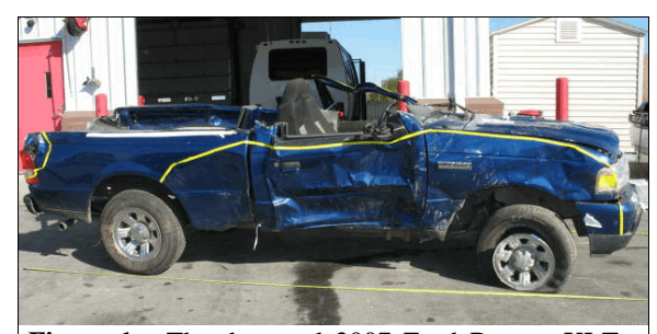
Figure 1: The damaged 2007 Ford Ranger XLT; roof was cut off by rescue personnel

This crash was brought to the National Highway Traffic Safety Administration's attention on September 12, 2008 by Special Crash Investigation (SCI) team 2. This on-site investigation was assigned on October 2, 2008. The crash involved a 2007 Ford Ranger XLT pickup truck ( Figure 1 ), which departed the roadway and rolled over. The crash occurred in September, 2008 at 0612 hours, in Missouri and was investigated by the Missouri State Highway Patrol. The focus of this on-site investigation was