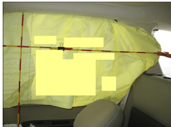
Figure 11: Rear portion of right side curtain air bag