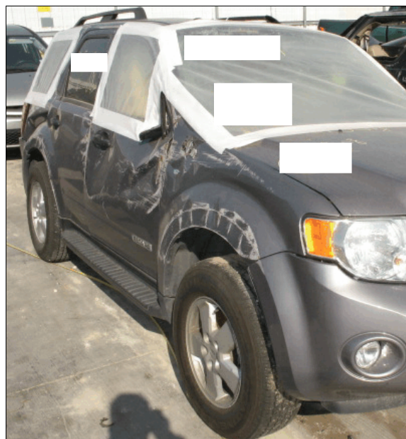
Figure 6: Damage to the 2008 Ford's right side plane from the rollover