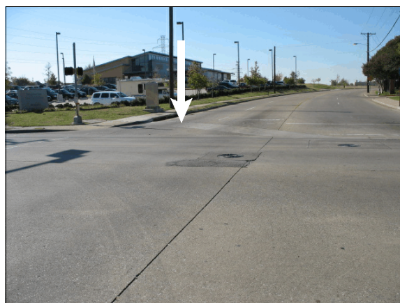
Figure 8: View southwest; arrow shows police reported area of final rest of the 2003 Ford