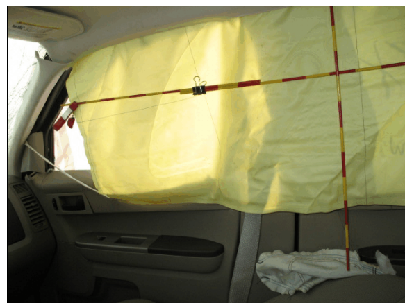
Figure 10: Front portion of right side curtain air bag