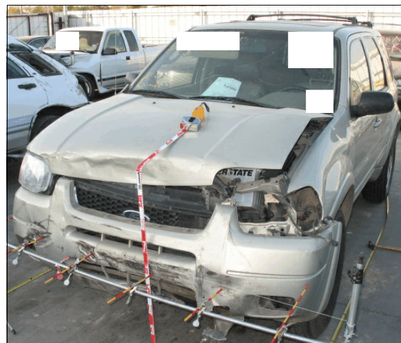
Figure 4: Damage to front of 2003 Ford from impact with the left side plane and left rear wheel of the 2008 Ford