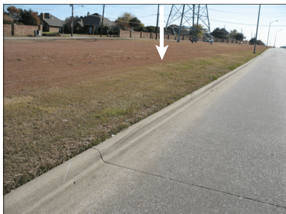
Figure 7: Tire marks on median curb; arrow shows estimated area of 2008 Ford's final rest position