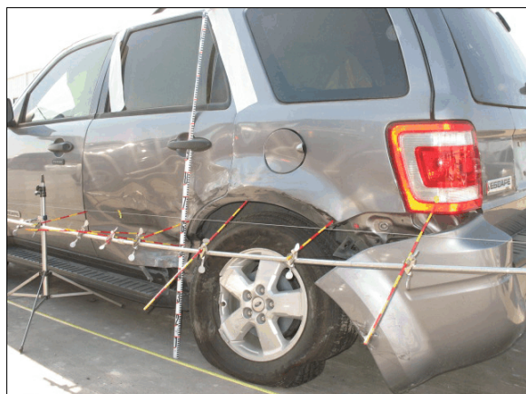
Figure 5: Damage to the left rear side of 2008 Ford from impact with the front of the 2003 Ford

transported by private vehicle to a hospital. Both vehicles were towed from the scene due to damage.