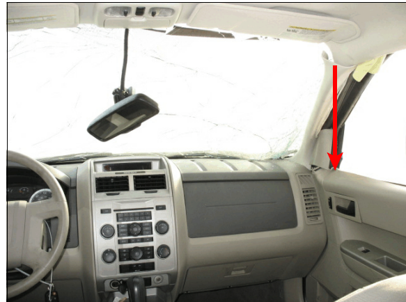
Figure 9: Arrow shows intrusion of right front door

Both side curtain air bags were located along the roof side rails (Figures 10 and 11) inside the headliner and extended from the A- to C-pillar. They were designed with inflation chambers adjacent to each outboard seat position and did not have external vent ports. Each deployed side curtain air bag was 145 cm (57.1 in) in width, 48 cm (18.9 in) in height, and extended 10 cm (4 in) below the beltline. Each air bag was attached at the respective A-pillar by a 40 cm (15.7 in) cloth tether and attached to the C-pillar by a 6 cm (2.4 in) cloth tether. There was a 30 cm (11.8 in) wide gap between the center leading edge of each air bag and the A-pillar. The fold creases on the air bags indicated that they had been folded in an accordion fashion within the headliner.