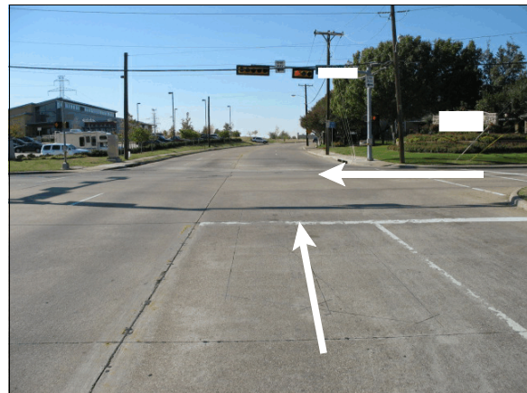
Figure 3: 2003 Ford's approach to the intersection; arrows show converging trajectory of both vehicles