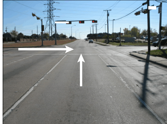
Figure 2: 2008 Ford's approach to the intersection; arrows show converging trajectory of both vehicles

Post-Crash: The police and emergency personnel were notified of the crash and arrived on scene in 25 minutes. Passers-by stopped and opened the 2008 Ford's left front door and the driver exited under his own power. The passers-by also assisted the front passenger in exiting the vehicle. He was transported by ambulance to a hospital. The driver was taken to a hospital later by a friend. The driver of the 2003 Ford was