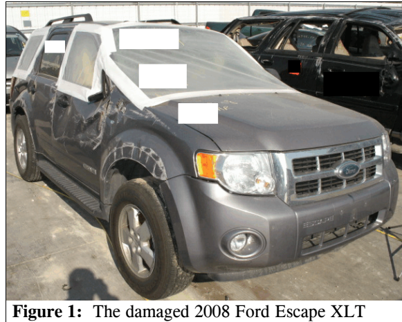
Figure 1: The damaged 2008 Ford Escape XLT

The focus of this on-site investigation was the rollover of a 2008 Ford Escape XLT. This crash was brought to the National Highway Traffic Safety Administration's (NHTSA) attention on November 7, 2008 by the sampling activities of the National Automotive Sampling System-General Estimates System. This investigation was assigned on November 13, 2008. This crash involved a 2008 Ford Escape XLT ( Figure 1 ) and a 2003 Ford Escape Limited, which were involved in an crash that occurred within a 4-leg intersection. The crash occurred in September, 2008, at 1137 hours, in Texas and was investigated by the applicable city police department. This contractor inspected both vehicles on November 20, 2008 and inspected the crash scene on November 21, 2008. The interview with the 2008 Ford's driver was completed on November 24, 2008. This report is based on the police crash report, scene and vehicle inspections, driver interview, occupant kinematic principles, and this contractor's evaluation of the evidence.