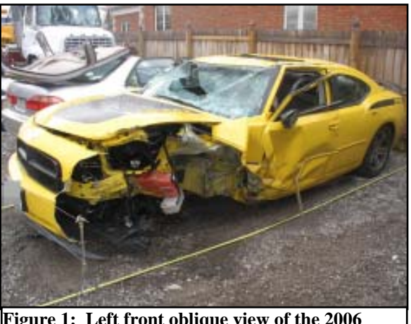
Figure 1: Left front oblique view of the 2006 Dodge Charger.

This on-site investigation focused on the Certified Advanced 208-Compliant (CAC) frontal air bag system in a 2006 Dodge Charger ( Figure 1 ). The manufacturer of the Dodge certified that the vehicle was compliant to the advanced air bag portion of Federal Motor Vehicle Safety Standard No. 208. The CAC air bag system consisted of dual stage frontal air bags for the driver and front right passenger positions, safety belt retractor pretensioners, safety belt buckle switches, seat track positioning sensors, and an occupant presence sensor for the front right position. In addition to