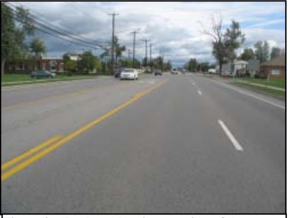
Figure 2: Eastbound trajectory view of the Dodge.

The driver of the Dodge was operating the vehicle eastbound in the inboard lane ( Figure 2 ). The Honda was traveling westbound in the inboard lane ( Figure 3 ) occupied by a 23-year-old female driver and a 25-year-old male front right passenger. The driver of the Dodge reportedly had a history of seizures and per the police investigator experienced a seizure from medication that he had ingested. This medical episode resulted in the driver of the Dodge relinquishing directional control of the vehicle. The Dodge drifted to the left, traversed the center two-way left turn lane and entered the inboard westbound lane. The crash schematic is included as Figure 11 at the end of this report.