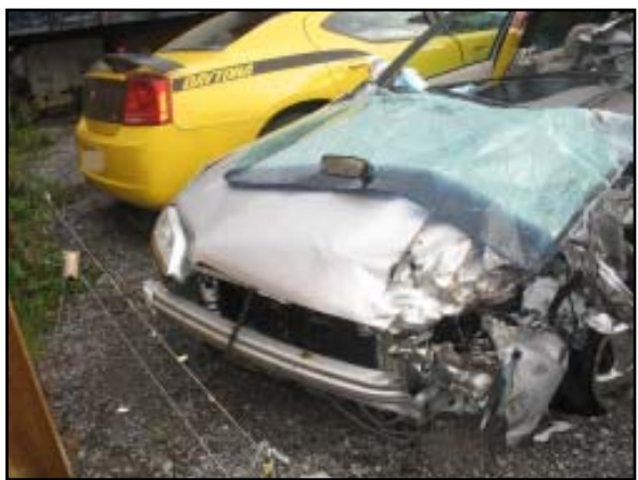
Figure 9: Left oblique view of the frontal crush to the Honda.

The 1998 Honda Accord sustained moderate-severity frontal damage as a result of the crash ( Figure 9 and 10 ). In addition to the crash damage, the roof was cut off by rescue personnel during the extrication of the driver and the front right passenger. The direct contact damage began 37 cm (14.5 in) left of the centerline and extended 39 cm (15.5 in) to the left bumper corner. Due to the corner impact, the direct contact damage extended onto the left plane, ending at the left front door. The maximum crush measured 64 cm (25.2 in) and was located on the left end of the bumper beam. A crush profile was documented along the bumper beam which was as follows: C1 = 64 cm (25.2 in), C2 = 36 cm (14.2 in), C3 = 30 cm (11.8 in), C4 = 22 cm (8.7 in), C5 = 10 cm (3.9 in), C6 = 0 cm. The CDC for this impact was 12FLEE6.