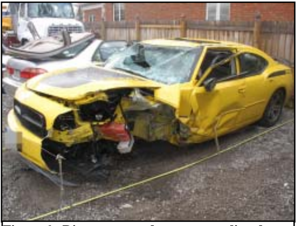
Figure 6: Direct contact damage extending down left side of the Dodge.

The Dodge sustained minor-severity damage to the right and top planes during the rollover event. The damage consisted of surface abrasions to both planes and vertical crush of the roof. The maximum vertical crush ( Figure 7 ) occurred at the right center aspect of the windshield header and measured 8 cm (3 in). There was no lateral deformation to the roof structure. The CDC of the rollover event was 00TDDO2. The four doors of the Dodge remained closed during the crash. The left side doors were jammed in the closed position