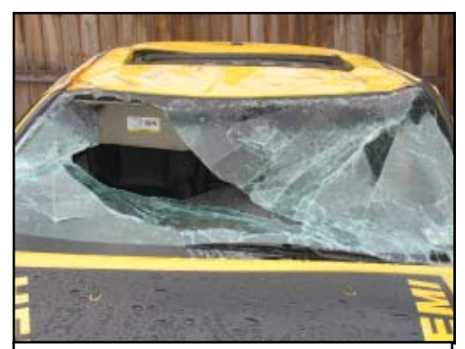
Figure 7: Image depicting the maximum vertical roof crush at the windshield header of the Dodge.

The Dodge sustained minor-severity damage to the right and top planes during the rollover event. The damage consisted of surface abrasions to both planes and vertical crush of the roof. The maximum vertical crush ( Figure 7 ) occurred at the right center aspect of the windshield header and measured 8 cm (3 in). There was no lateral deformation to the roof structure. The CDC of the rollover event was 00TDDO2. The four doors of the Dodge remained closed during the crash. The left side doors were jammed in the closed position