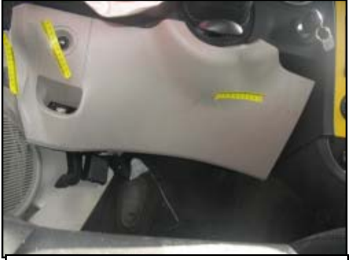
Figure 8: Overall view of the knee bolster contacts.

The driver's contact points consisted of two knee impacts to the knee bolster which were evidenced by deformation of the rigid plastic panel ( Figure 8 ). The first contact was attributed to the driver's left knee and was located 34 cm (13.5 in) left of the steering column centerline. The second contact was located 8 cm (3 in) right of the centerline and was attributed to the driver's right knee. The passenger compartment intrusions are listed in the following table: