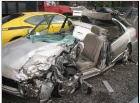
Figure 10: Residual left side damage to the Honda.