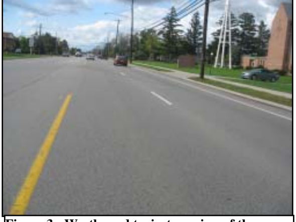
Figure 3: Westbound trajectory view of the Honda.