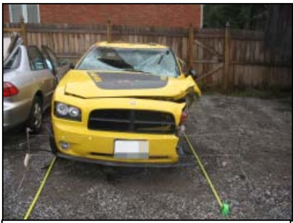
Figure 5: Frontal damage to the Dodge.

The 2006 Dodge Charger sustained moderate-severity damage to the front and left side planes as a result of the impact with the 1998 Honda Accord ( Figures 5 and 6 ). The damaged components included but were not limited to the bumper fascia, bumper beam, hood, left fender, left front door, and the left front wheel and suspension components. The direct contact damage began 46 cm (18 in) left of the centerline and extended 33 cm (13 in) to the left bumper corner. Due to the corner impact configuration, the direct contact damage extended 230 cm (90.5 in) along the left plane to the left front door area. The left front wheel and suspension components. The lower control arm fractured during the engagement and the inner tie rod end separated. The maximum crush measured 33 cm (13 in) and was located at the left corner of the bumper beam. The crush profile documented along the bumper beam was as follows: C1 = 33 cm (13 in), C2 = 12 cm (4.7 in), C3 = 13 cm (5.8 in), C4 = 12 cm (4.7 in), C5 = 6 cm (2.4 in), C6 = 0 cm. The Collision Deformation Classification (CDC) for this impact was 12FLEE7.