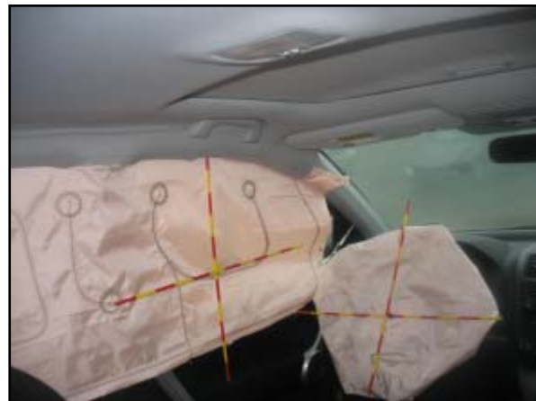
Figure 7: Deployed driver's frontal and left curtain air bags.

The Honda was equipped with front seat back mounted side impact air bags and roof side rail mounted inflatable side curtains with rollover sensing. The left and right seat back air bags did not deploy in this crash. The left and right inflatable curtains deployed during rollover crash sequence