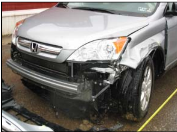
Figure 5: Overall view of the residual damage from the impact with the Mercedes-Benz.

The four doors remained closed during the crash and were operational at the time of the SCI inspection. The windshield, left side, backlight, roof, and right rear glazing were not damaged during the crash. The right front glazing was disintegrated from contact with the ground.