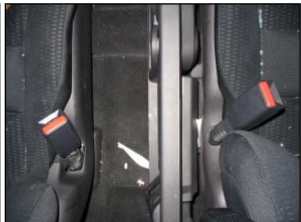
Figure 9: Actuated driver's buckle pretensioner (left in image).