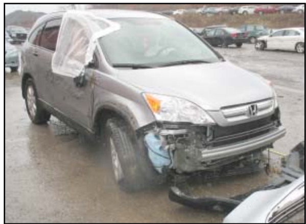
Figure 6: Front oblique view of the rollover damage.