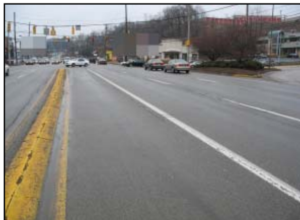
Figure 3: Area of impact from the Mercedes-Benz approach.

The front left corner of the Honda impacted the right front aspect of the Mercedes-Benz in the left through lane ( Figure 3 ). The engagement to the Honda began at the front left corner and extended down the left fender 95 cm (37.4”). The impact fractured the Honda’s left front suspension. This corner impact configuration resulted in a 12 o’clock impact force to the Honda. The corner engagement was outside the scope of the WINSMASH program; therefore, a delta-V could not be calculated for this impact. This frontal impact sequence actuated the driver’s dual safety belt pretensioners and deployed the driver’s frontal air bag.