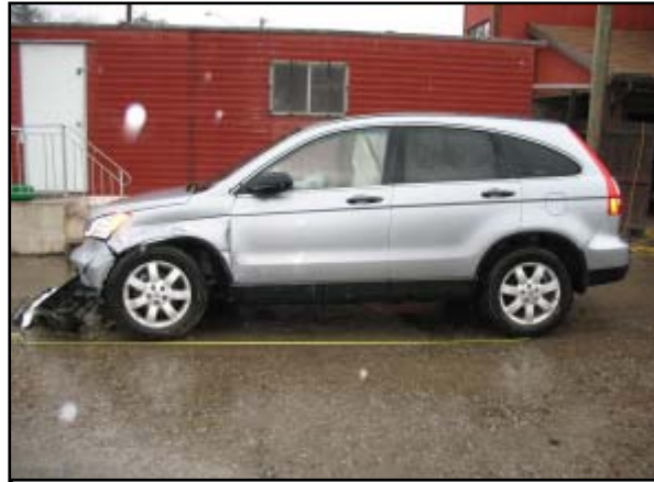
Figure 1: 2007 Honda CR-V.

This on-site investigative effort focused on the crash dynamics and injury sources surrounding the rollover crash of a 2007 Honda CR-V ( Figure 1 ). The Honda was driven by a 31-year-old restrained female. The Honda CR-V was equipped with a Certified Advanced 208-Compliant (CAC) frontal air bag system, front seat back mounted side impact air bags and roof-rail mounted inflatable side curtains with rollover sensing. A CAC vehicle is certified by the manufacturer to be compliant to the Advanced Air Bag portion of Federal Motor Vehicle Safety Standard (FMVSS) No. 208. The CAC safety system consisted of dual stage frontal air bags, an occupant presence sensor for the front right seat, and safety belt buckle switch sensors to monitor belt usage. The Honda's front safety belts were equipped with both buckle and retractor mounted pretensioners. The crash occurred when a 2004 Mercedes-Benz ML350, driven by a 26-year-old female, changed lanes to the right and entered the path of the Honda CR-V. The front aspect of the Honda impacted the right front side of the Mercedes. This contact induced a counterclockwise (CCW) rotation of the Honda. The Honda subsequently tripped into a single quarter-turn right side leading rollover event. The driver's frontal air bag and both inflatable side curtains in the Honda deployed as a result of the crash. The driver of the Honda was not injured.