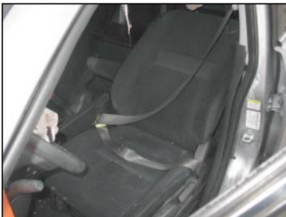
Figure 8: Driver's safety, restricted in the used position.

The second row safety belts were configured with continuous loop webbing, sliding latch plates and switchable ELR/ALR retractors.