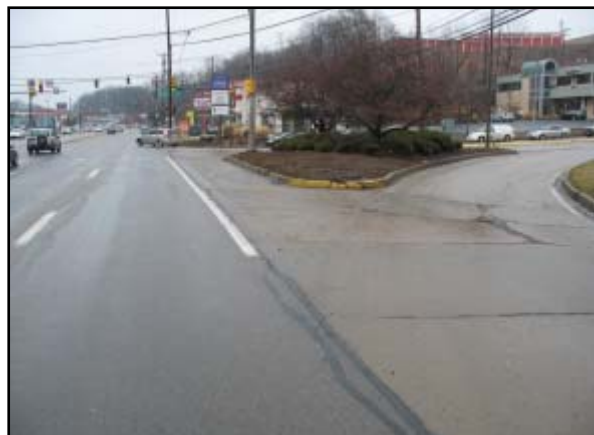
Figure 4: Approximate final rest area of the Honda.

The Honda separated from the impact with the Mercedes-Benz to the right with counterclockwise rotation. As the vehicle rotated, the right front tire rolled under the rim exposing the rim edge to the asphalt surface. This interaction tripped the Honda into a right side leading single quarter-turn rollover event. The Honda travelled approximately 12 meters (39 feet) from the trip point to final rest ( Figure 4 ). As a result of the rollover event, the rollover sensors triggered the deployment of the Honda’s left and right inflatable side curtains.