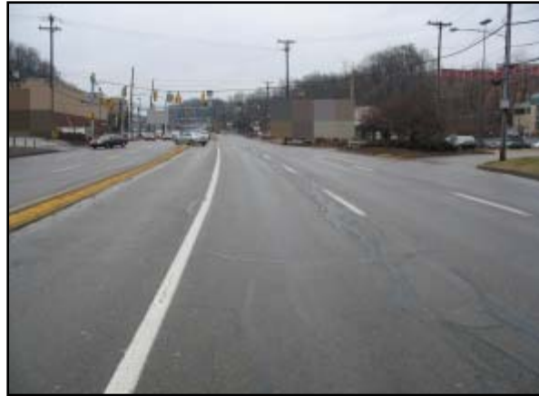
Figure 2: Northbound approach of the Honda.

The female driver of the Honda was operating the vehicle northbound in the left through lane approaching the intersection ( Figure 2 ). The driver of the Mercedes-Benz was operating the vehicle northbound in the left turn lane. While traveling in the left turn lane, the driver of the Mercedes-Benz initiated a lane change maneuver to the right.