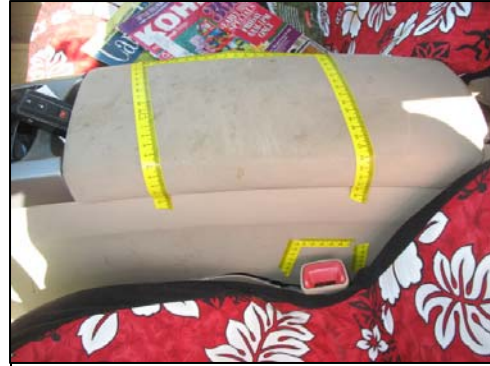
Figure 11: Driver contact to center console

resulted in a complaint of pain to the hip without contusion. The driver's right forearm scuffed the top of the console as it traveled across the console from left to right. As the driver loaded into the center console, his upper torso loaded the safety belt, causing a section to stretch and the belt to abrade where it passed through the sliding latchplate. As his upper torso loaded the safety belt, his head continued to the right, causing the neck strain. The driver did not engage the IC air bag. He did not seek treatment for his injuries.