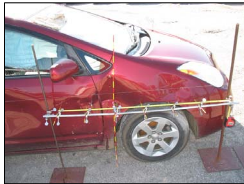
Figure 4: Side-slap damage to the Prius

The secondary sideslap damage involved the right front door and fender of the Prius in the area of the right A-pillar. The direct damage began on the right front door 70 cm (27.6 in) rear of the right front axle and extended forward 92 cm (36.2 in) onto the right front fender ( Figure 4 ). The Field L for this damage began 76 cm (29.9 in) rear of the right front axle and extended forward 106 cm (41.7 in). The residual crush profile measured at the mid door elevation was as follows: C1 = 0 cm, C2 = 2 cm (0.8 in), C3 = 6 cm (2.4 in), C4 = 4 cm (1.6 in), C5 = 3 cm (1.2 in), C6 = 0 cm. The maximum crush was located at C3, located 33 cm (13 in) rearward of the right front axle. The CDC for this impact was 03-RYEW-1.