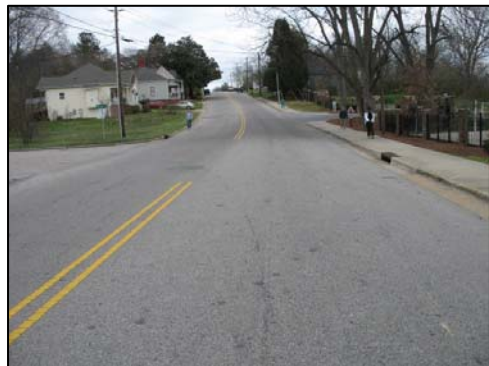
Figure 2: Prius' pre-crash trajectory

Prior to the crash, the 2005 Toyota Prius was eastbound on the roadway. The driver was traveling to work and was concerned with being late due to slow driving conditions in the snow. The driver was traveling on a straight, flat section of roadway at approximately 40 km/h (25 mph). The 1996 transit bus was traveling at approximately 40 km/h (25 mph). As the driver of the Prius ascended the hill and entered the slight curve to the left, he increased throttle ( Figure 2 ). The Prius broke traction on the snow covered road and rotated approximately 95 degrees counterclockwise (CCW), crossing the center line into the path of the transit bus.