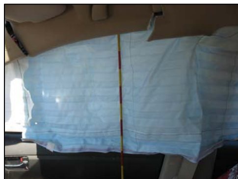
Figure 8: Right side inflatable curtain

The Prius was equipped with driver and front right passenger side impact air bags mounted in the upper aspect of the outboard side of the seat backs. IC air bags were mounted in the roof side rails and provided coverage to the four outboard seat positions. The seat back mounted side impact air bags did not deploy in this crash; however, the right IC air bag deployed during the initial impact event.