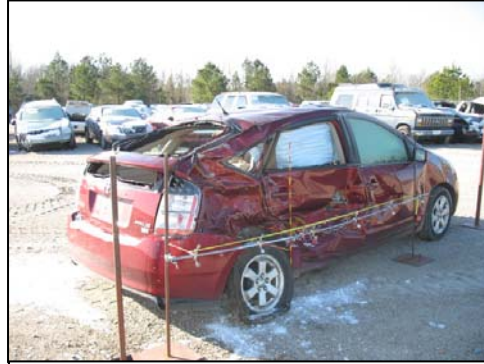
Figure 1. The 2005 Toyota Prius case vehicle

This on-site investigation focused on the crashworthiness of the hybrid battery system in a 2005 Toyota Prius Hybrid. The Prius was involved in a front-to-side impact configuration with a transit bus. Figure 1 is an image of the Prius involved in this case. The Prius was equipped with a high-voltage nickel-metal hydride battery pack using potassium hydroxide electrolyte. This battery pack had a total output rating of 200 volts and was used for low speed vehicle acceleration/motion and to assist the 1.5 liter (92 ci) gasoline engine in higher speed travel.