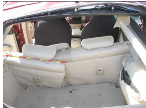
Figure 7: Rear seat lateral and longitudinal intrusion

The intrusion to the Prius is listed on the following table: