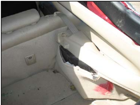
Figure 6: Cargo area intrusion.

The Toyota Prius sustained moderate right side intrusion in the front right and rear right seat positions as a result of the initial impact. The right B-pillar was displaced laterally into the outboard aspect of the front right seat back. This engagement did not compress the seat back. The right rear door and C-pillar intruded laterally and compressed the rear seat backs. The right roof side rail in the second row intruded laterally. The rear right and center seat backs intruded laterally 12 cm (4.7 in), causing them to move forward over the left rear seat back, causing a 15 cm (5.9 in) longitudinal intrusion of the right and center rear seat backs. The damage to the rear seats made it impossible to fold down the rear seats to access the front of the panels covering the hybrid battery and remove the panels to photograph the battery. The side panel aft of the right C-pillar intruded laterally and compressed the floor of the trunk/cargo area at the location of the hybrid battery and is depicted in Figure 6 . The rear seat damage is depicted in Figure 7 .