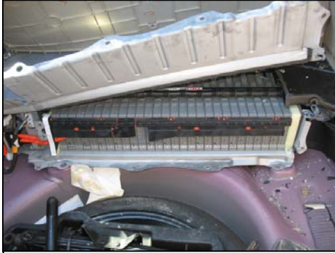
Figure 9: Hybrid battery centered over rear axle behind rear seat