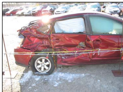
Figure 3: Initial impact damage to the right rear side area of the Prius.

The right side of the Toyota Prius was damaged in this multiple event crash. The initial impact involved moderate severity damage to the right rear side area of the Prius ( Figure 3 ). The direct contact damage began on the right front door 130 cm (51.2 in) aft of the right front axle and extended 173 cm (68.1 in) rearward to the right rear taillight area. Lateral crush was present to the right doors, C-pillar, and quarter panel. The right front and right rear door hinges were intact