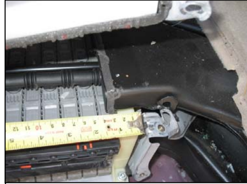
Figure 10: Right side of hybrid battery and ventilation duct