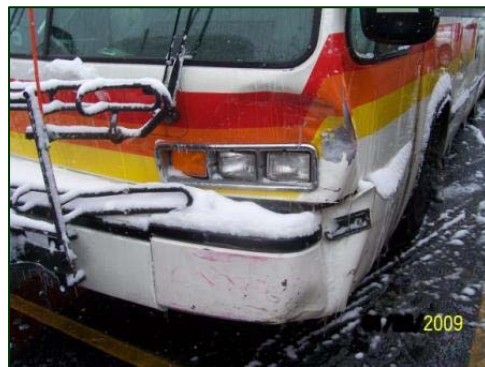
Figure 5: Initial impact damage to front left area of bus.

The front left and right front side areas of the transit bus were damaged in this crash. The bus was driven from the scene and was fully repaired and returned to service prior to the assignment of this case. Images of the initial impact damage to the front left area were obtained from the company that operates the transit bus. The damage involved the front bumper fascia, the front cowl in the area of the left headlamp assembly, and to the bicycle rack on the front of the bus ( Figure 5 ). No images of the secondary side-slap damage to the right front side area were available. The representative of the company