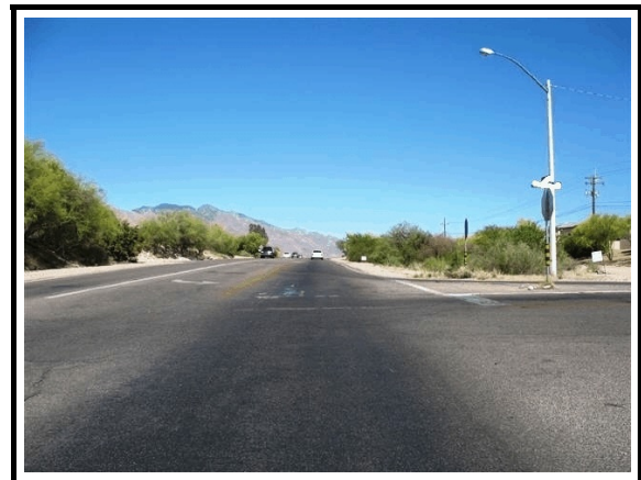
Figure 3. Crash site, subject vehicle eastbound approach