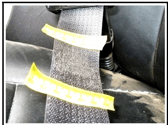
Figure 8. Occupant loading evidence, safety belt webbing