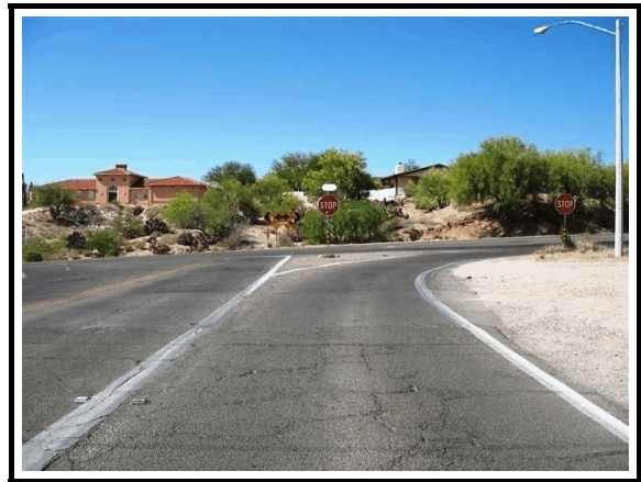
Figure 2. Crash site, other vehicle northbound approach

The intersection was controlled by posted stop signs and a painted surface stop line for northbound traffic that was turning either left or right onto the east/west roadway. One posted stop sign was