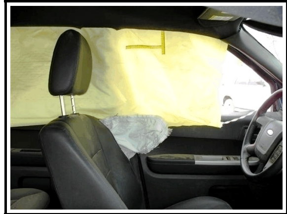
Figure 9. Deployed left IC and seat-mounted air bags

The Supplemental Restraint System (SRS) included an air bag control module (ACM), driver and passenger frontal air bags, side impact inflatable curtain (IC) air bags, seat-mounted side air bags, front and side impact sensors, and seat belt pretensioners for the front row. The driver of the vehicle stated during the interview that the air bags were original to the vehicle and had not been serviced.