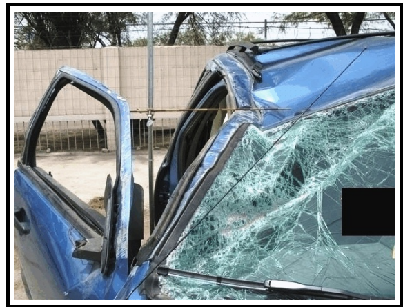
Figure 5. Windshield header vertical crush measurement