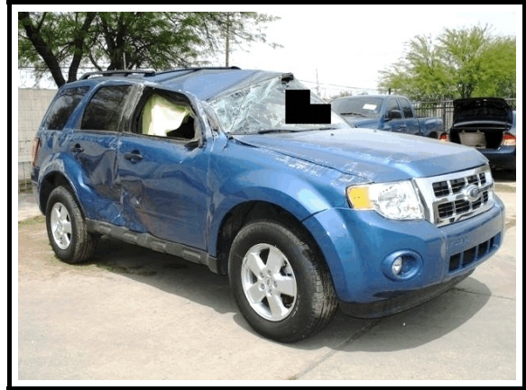
Figure 1. Subject vehicle, 2009 Ford Escape XLT

This on-site rollover investigation focused on the dynamics of a 2009 Ford Escape XLT sport utility vehicle ( Figure 1 ) that was involved in a vehicle-to-vehicle crash and subsequent rollover. The crash occurred in February 2009 in Arizona. The subject vehicle was being driven by a 36-year-old female and the other vehicle was a 2006 Volkswagen New Beetle that was being driven by a 33-year-old female. The second occupant in the Volkswagen was an 8-year-old female. The police report stated that her seat position was unknown and her restraint usage was a lap and shoulder belt.