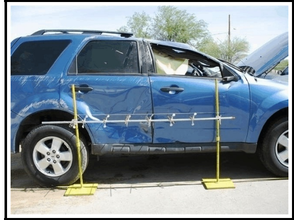
Figure 4. Right side crush measurement

The Fords's front row seating was equipped with 3-point manual lap and shoulder safety belts with sliding latch plates and adjustable D-ring anchorage assemblies. The safety belts were configured with dual buckle and retractor pretensioners. The driver's safety belt had an Emergency Locking Retractor (ELR) and the passenger's safety belt had a switchable ELR/Automatic Locking Retractor (ALR).