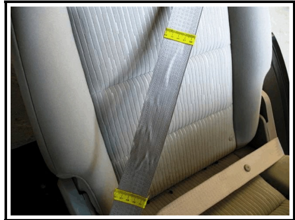
Figure 4. Second row left safety belt showing stretch marks

The left safety belt was used to secure a Graco ComfortSport convertible CRS. The latch plate was scratched from historical use. The safety belt webbing exhibited evidence of occupant loading in the form of a scuff mark and stretch marks. A scuff mark was located where the webbing contacted a seat adjustment lever on the outboard aspect of the seat cushion near the lower anchorage. The scuff was light in color, measured 1 x 5 cm (0.4 x 2.0 in), and was distributed across the width of the webbing. At 54 cm (21.3 in) above the lower anchorage a 29.5 cm (9.8 in) section of webbing was stretched ( Figure 4 ). The stretched section of belt was in contact with the latch plate and the CRS shell during the crash. The driver stated during the interview that the safety belt retractor was set to ALR mode during the crash.