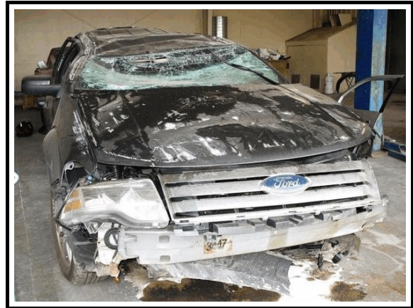
Figure 1. Subject vehicle, 2008 Ford Taurus X

This on-site child restraint system investigation focused on the occupants and child restraints in a vehicle that was involved in a rollover crash. The crash occurred in April 2009 in the state of California. The subject vehicle was a 2008 Ford Taurus X crossover utility vehicle ( Figure 1 ) that was being driven by a 33-year-old male. The front row right seat was occupied by a 30-year-old female. The second row left seat was occupied by a 3-year-old male who was restrained in a child restraint system (CRS), and the second row right seat was occupied by an 8-month-old male who was restrained in a CRS. The Ford was traveling northbound on an undivided north/south state highway.