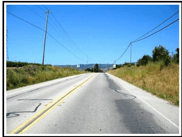
Figure 2. Crash site, northbound approach

The crash site was a two-lane north/south state highway which had one lane in each direction ( Figure 2 ). Outboard of the lanes were paved shoulders, followed by ascending dirt embankments. The lanes were separated by solid double-yellow stripes, and bordered by solid white fog lines. The widths of the northbound lane and shoulder measured 3.8 m and 1.2 m (12.5 ft and 4.0 ft), respectively. The paved shoulder abutted a dirt embankment that ascended at a 45-degree angle. The embankment was 3.7 m (12 ft) in width and ascended to 1.4 m (4.7 ft) above the roadway grade. The southbound lane and shoulder widths measured 3.7 m and 1.3 m (12.1 ft and 4.3 ft).