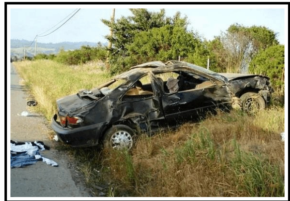
Figure 10. 1993 Honda Civic

The Honda's exterior damage data was determined based on police photographs only ( Figure 10 ). The vehicle sustained minor damage to the right side during the vehicle to vehicle impact (Event 1). The damage distribution was wide and comprised surface scratches; lateral crush was not determined but the overall damage was minor. For Event 1, the estimated Collision Deformation Classification (CDC) for the Honda was 02RBLW1.