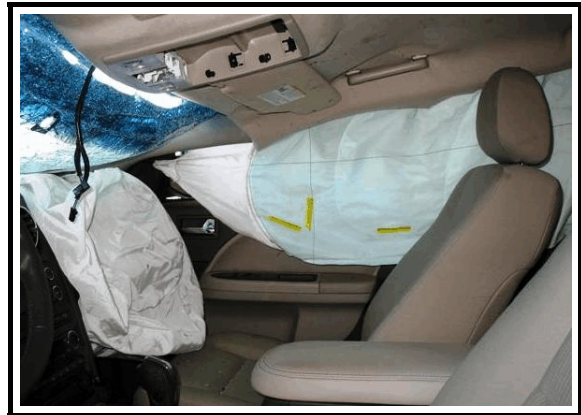
Figure 7. Passenger's deployed air bags

The driver's air bag module was located in the steering wheel hub ( Figure 6 ), and the air bag deployed through I-configured cover flaps. The flaps opened at their tear points and were not damaged. The air bag was circular in shape and measured 54 cm (21.3 in) in diameter in its deflated state. The air bag had one internal tether that terminated at the bag's front center. Two vent ports that measured 3 cm (1.2 in) in diameter were located at the 11 and 1 o'clock positions on the air bag's back panel.