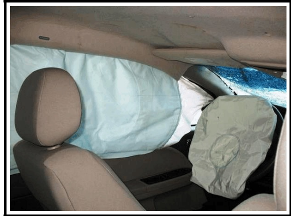
Figure 6. Driver's deployed air bags

The Ford's Supplemental Restraint System (SRS) included an air bag control module, driver and passenger frontal air bags, IC air bags, seat-mounted side air bags, and safety belt buckle pretensioners for the front row. The Ford was a Certified Advanced 208 Compliant (CAC) vehicle. A CAC vehicle is certified by the manufacturer to be compliant with the Advanced Air Bag portion of Federal Motor Vehicle Safety Standard (FMVSS) No. 208. Based on the interview with the driver, the vehicle's air bags were original equipment and had never been serviced.