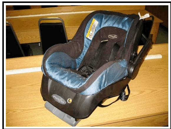
Figure 9. Evenflo Embrace CRS

The second row right occupant was a 8-month-old male who was seated in an Evenflo Embrace CRS ( Figure 9 ). The model number was 5982076P1 and the date of manufacture was 7/18/2005. The Embrace is designed for infants and was equipped with a 5-point harness system with a chest retainer clip and buckle, padded cushion, detachable base with adjustable tilt settings, LATCH hardware, and handle for carrying the CRS. The Embrace was designed to be used rear-facing only and proper installation required the use of the base in combination with the CRS shell.