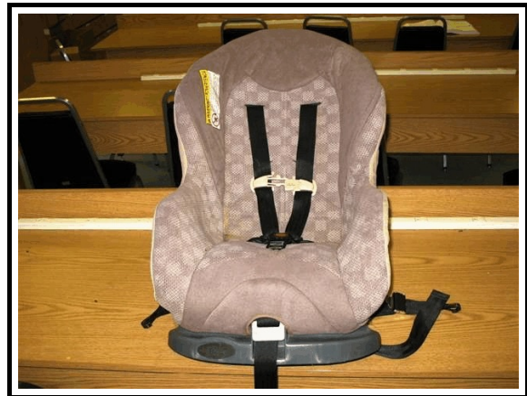
Figure 8. Graco ComfortSport CRS

The second row left occupant was a 3-year-old male who was seated in a Graco ComfortSport CRS ( Figure 8 ). The CRS model number was 8C00TMB and the date of manufacture was 6/28/2006. The ComfortSport was equipped with a 5-point harness system with a chest retainer clip and buckle, padded cushion, a non-detachable base, locking clip, and LATCH hardware.