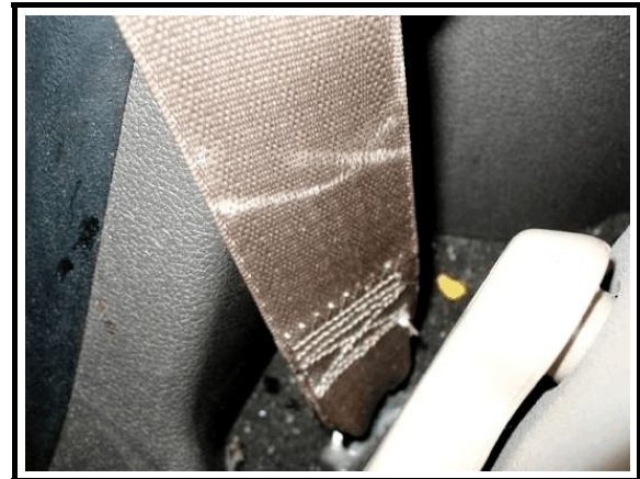
Figure 5. Second row right safety belt showing scuff marks

The right safety belt was used to secure an Evenflo Embrace rear-facing CRS. The latch plate was scratched indicating historical usage and exhibited abrasions from CRS loading. The belt webbing exhibited evidence of occupant loading in the form of scuffs and stretch marks. Two scuff marks were located where the webbing contacted a seat adjustment lever on the outboard aspect of the seat cushion near the lower anchorage. The scuffs were light in color and crossed in an X pattern ( Figure 5 ). The scuffs measured 1 x 5 cm (0.4 x 2.0 in) and 1 x 6 (0.4 x 2.4 in), respectively, and were distributed across the width of the webbing. At 85 cm (33.5 in) above the lower anchorage a 30 cm (11.8 in) section of webbing was stretched. The loaded section of belt was routed through the CRS shell at the time of the crash. Based on the driver interview and loading evidence to the belt webbing, it was concluded that the safety belt retractor was set to ALR mode during the crash.