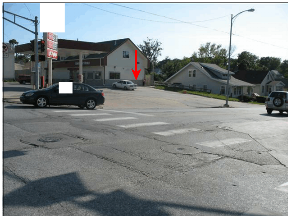
Figure 6: Post-impact travel of the Mazda and Ford southwest toward the convenience store lot; arrow shows location of Mazda's front impact on the north wall of the convenience store