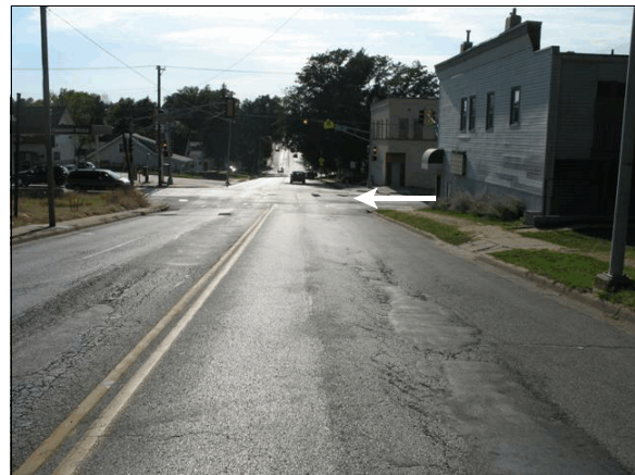
Figure 3: Approach of the Ford; arrow shows approach of the Mazda