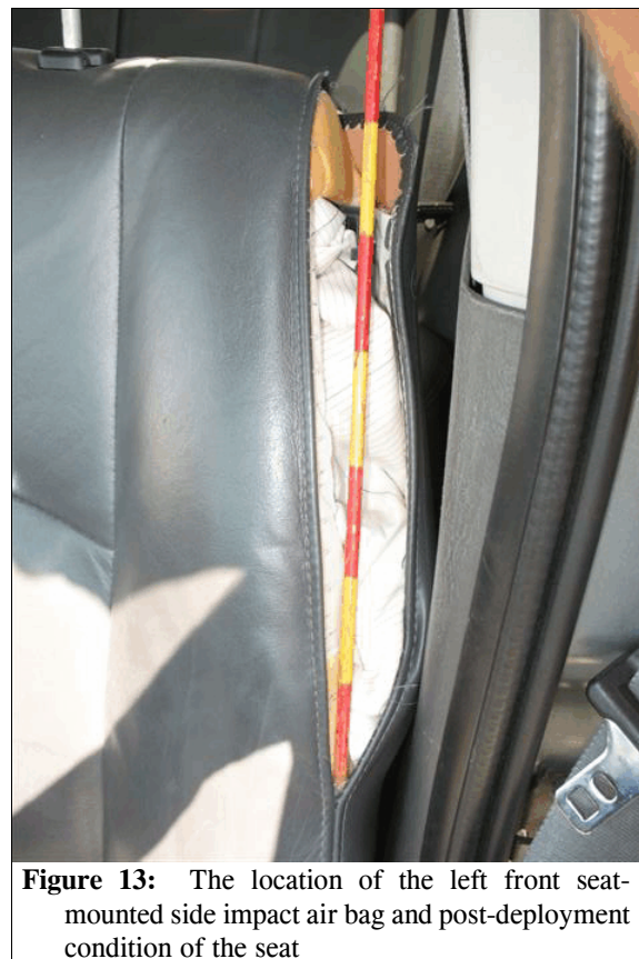
Figure 13: The location of the left front seat-mounted side impact air bag and post-deployment condition of the seat

The Mazda was equipped with driver and front right passenger redesigned frontal air bags and front seat-mounted side impact air bags. The vehicle's side impact sensors were located within the lower B-pillars. The driver's seat-mounted side impact air bag deployed in this crash. No other air bags deployed.