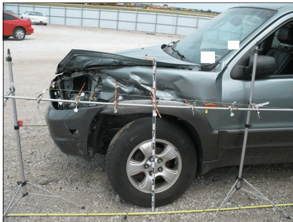
Figure 4: Damage on the left fender of the Mazda from impact with the front of the Ford