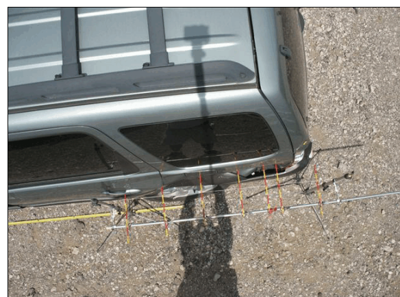
Figure 11: Top view of the crush on the left quarter panel of the Mazda

The second impact with the Ford also involved the left side plane of the Mazda. The left quarter panel and the side portion of the back bumper fascia were directly damaged. The direct damage began 34 cm (13.4 in) forward of the left rear axle and extended 116 cm (45.7 in) rearward along the quarter panel. The crush measurements were taken at the middle quarter panel level and the residual maximum crush was 12 cm (4.7 in) occurring 6 cm (2.4 in) forward of C 3 ( Figure 11 ). The induced damage involved the left rear door. The table below shows the crush profile on the left quarter panel.