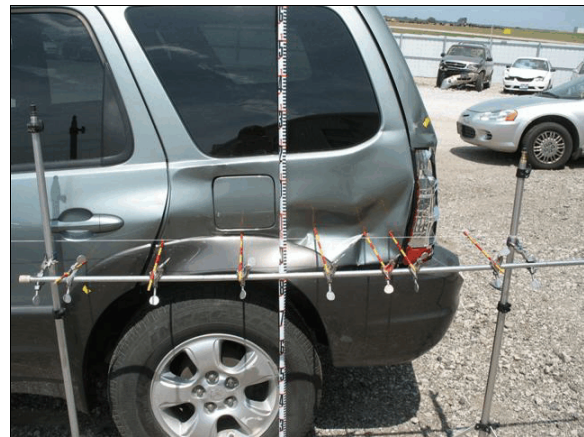
Figure 5: Damage on the left quarter panel of the Mazda from impact with the right quarter panel of the Ford