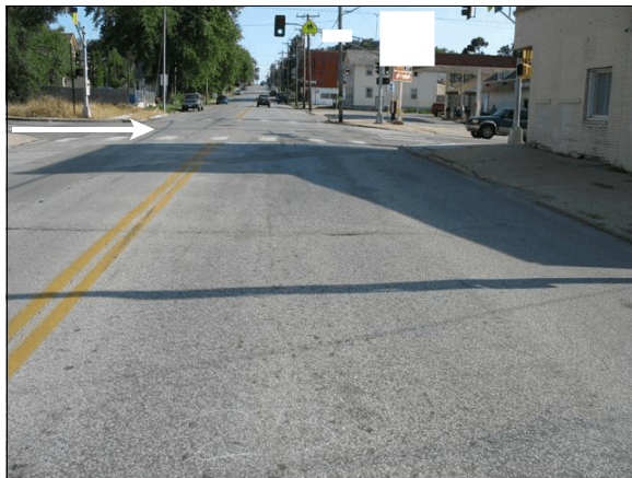
Figure 2: Approach of the Mazda to the intersection; arrow shows approach of the Ford

Crash: The front plane of the Ford impacted the Mazda's left fender ( Figure 4 , event 1). The direction of force on the Mazda was within the 11 o'clock sector, and the impact force was sufficient to trigger a deployment of the driver's seat-mounted side impact air bag. The impact caused the Mazda to rotate clockwise and the Ford rotated counterclockwise. The right quarter panel of the Ford impacted the left quarter panel of the Mazda ( Figure 5 , event 2). Both vehicles were redirected to the southwest ( Figure 6 ) and entered a convenience store lot where the front of the Mazda ( Figure 7 ) impacted the north wall of the convenience store ( Figure 6 , event 3). The Mazda's direction of force was within the 12 o'clock sector and the impact force was not sufficient to trigger deployment of the driver's frontal air bag. The Mazda rolled backward in a northerly direction across the street ( Figure 8 ) and its back plane ( Figure 9 ) impacted a metal fence (event 4) where the vehicle came to final rest heading southeast. The Ford came to final rest in the convenience store lot heading southwest.