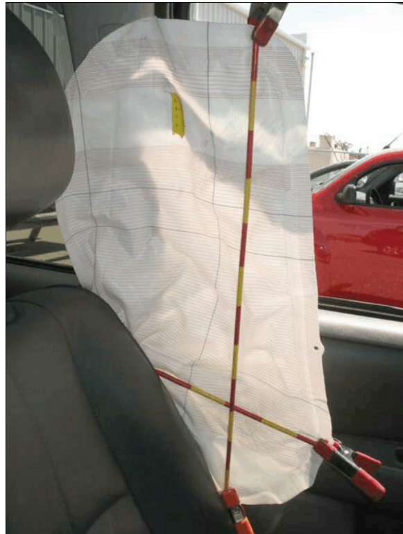
Figure 14: The deployed left front seat back-mounted side impact air bag

The Mazda was equipped with lap-and-shoulder safety belts for the front and second row outboard seating positions and a lap belt for the second row center seating position. The driver's safety belt consisted of continuous loop belt webbing, an Emergency Locking Retractor (ELR), sliding latch plate, and an adjustable upper anchor that was in the full-up position. The front right safety belt was similarly equipped, but had an ELR/Automatic Locking Retractor (ALR). The front row safety belts were equipped with buckle-mounted pretensioners, which did not actuate in this crash. The second row lap-and-shoulder belts were equipped the same as the front right, but had fixed upper anchors and no pretensioners. The second row center lap belt was equipped with a locking latch plate.