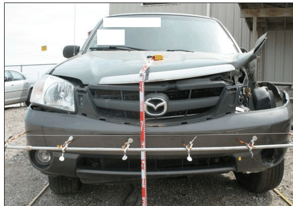
Figure 7: Damage to the Mazda's front plane from the impact with the wall of the convenience store