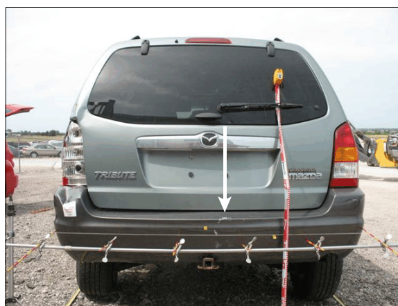
Figure 9: Arrow shows damage location on Mazda's back bumper from impact with the metal fence

Post-Crash: The police and emergency medical personnel responded to the scene. The Mazda's driver and the Ford's second row left passenger were transported by ambulance to a hospital. The Ford's driver and second row right passenger were not injured. The Ford's front right passenger sustained a C (possible) injury, but was not transported. Both vehicles were towed from the crash scene due to damage.