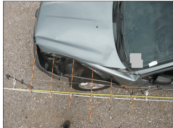
Figure 10: Top view of the crush on the left fender of the Mazda

Exterior Damage: The initial impact with the Ford involved the left side plane of the Mazda. The left fender, corner of the front bumper, and the left front wheel were directly damaged. The direct damage began 32 cm (12.6 in) rear of the left front axle and extended 112 cm (44.1 in) along the fender. The crush measurements were taken at the upper fender level and the residual maximum crush was 34 cm (13.4 in) occurring at C 4 ( Figure 10 ). The induced damage involved the left front door and the left side wheelbase was reduced 3 cm (1.2 in). The table below shows the vehicle’s left side crush profile.