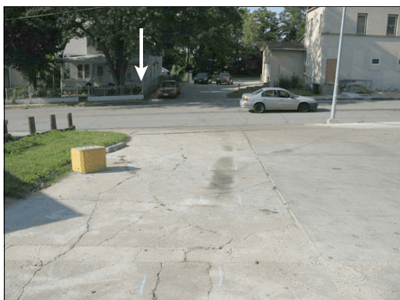
Figure 8: View south at Mazda's travel path from the impact location on the convenience store to impact with a metal fence (arrow)