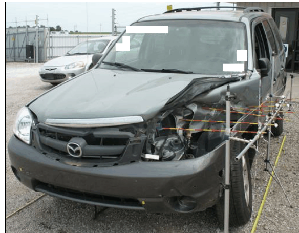
Figure 1: The damaged 2004 Mazda Tribute ES

This on-site investigation focused on the seat-mounted side impact air bags, the crash dynamics, and the sources of the driver's injuries of a 2004 Mazda Tribute ES ( Figure 1 ). This crash was brought to our attention by the National Highway Traffic Safety Administration (NHTSA) on July 24, 2009 through the sampling activities of the National Automotive Sampling System-General Estimates System (NASS-GES). This investigation was assigned on August 6, 2009. The crash involved the Mazda and a 2006 Ford Escape XLT. The crash occurred in June 2009, at 0001 hours, in Nebraska and was investigated by the city police department. The Mazda and the crash scene were inspected on August 6-7, 2009.