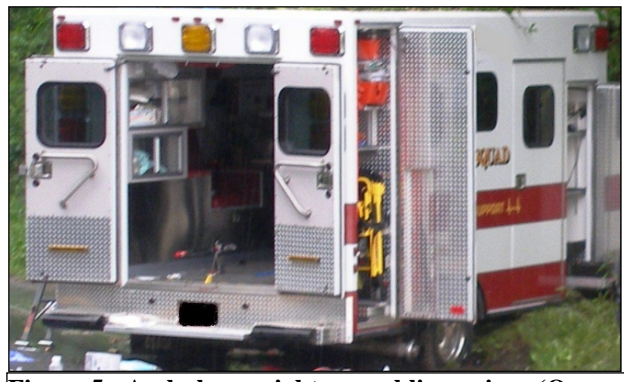
Figure 5: Ambulance right rear oblique view.

The ambulance body was manufactured by Osage Industries, Inc. and was identified as a model 2168 Super Warrior Type III, Class I ambulance. Overall dimensions of the ambulance body were 221 cm (87 in) in height, 244 cm (96 in) in width, and 427 cm (168 in) in length. The welded body construction consisted of aluminum roof and side panels on 5 cm (2 in) square aluminum tubing framework. There were five exterior storage compartments with pan-formed hinged doors, and two passenger access points.