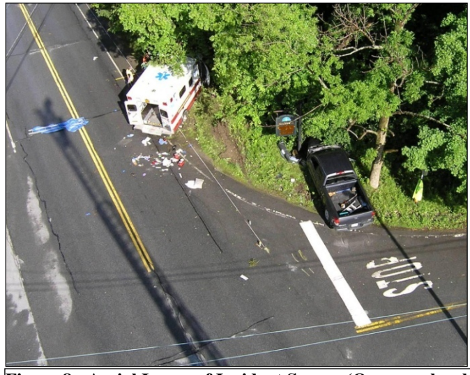
Figure 8: Aerial Image of Incident Scene.

The ambulance rebounded and simultaneously rotated 40 degrees CW before the rear axle regained contact with the ground. Although the ambulance's GVWR is outside of the scope of the WINsmash model, a barrier equivalent delta-V of 52 km/h (32 mph) serves as a borderline reconstruction for this event. The longitudinal and lateral components