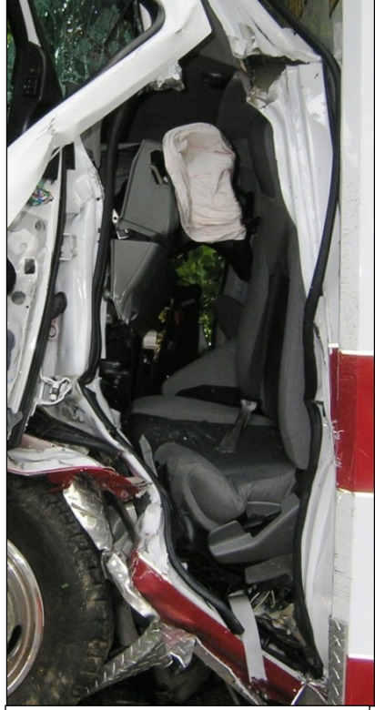
Figure 10: Driver intrusion.

deflection to the floor under and surrounding the driver's seat. Combined, the intrusion and deformation had crushed the left