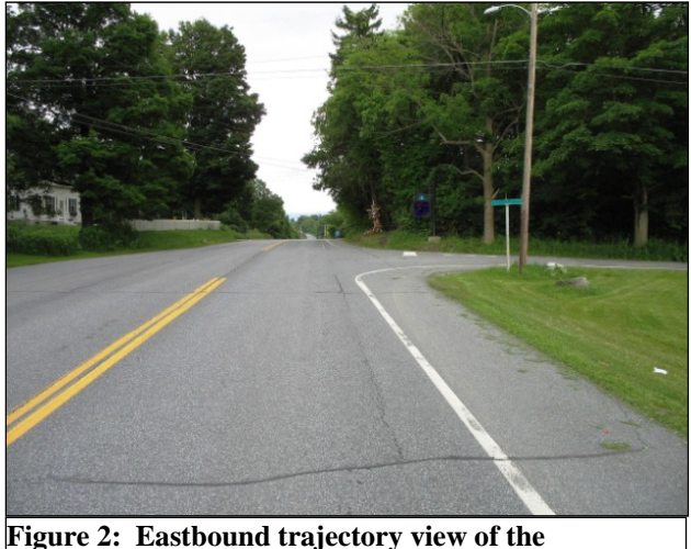
Figure 2: Eastbound trajectory view of the ambulance.

This crash occurred at a controlled four-leg intersection during daytime hours. Weather conditions at the time of the crash were overcast with thunderstorm activity, with a temperature of 14 degrees Celsius (57 Fahrenheit) and easterly winds of 13 km/h (8 mph). The bituminous roadway was wet from heavy rain and hail associated with the aforementioned weather conditions. The ambulance was eastbound in the 3.7 m (12 ft) wide travel lane of a two-lane roadway, supported by a 1.3 m (4 ft) shoulder. The roadway followed a slight right curve with positive 3 percent grade before leveling off