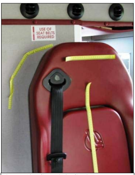
Figure 12: Captain's Chair contact evidence.