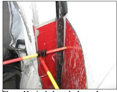
Figure 11: Ambulance body crush.

The wall behind the Captain's Chair had contact evidence from the upper seatback of the chair. This was located from 94-122 cm (37-48 in) above the floor, at 41-61 cm (16-24 in) left of centerline. The Captain's Chair was not deformed, and the integral CRS remained stowed within the seatback. This is depicted in Figure 12 .