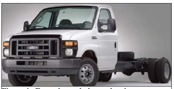
Figure 4: Exemplar ambulance chassis.

passenger. This was similar to the exemplar shown in Figure 4. The chassis had a 401 cm (158