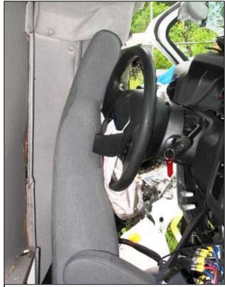
Figure 13: Driver air bag and displaced steering assembly of the ambulance.

The passenger air bag was mounted beneath two 7 cm (3 in) tall by 23 cm (9 in) wide flaps, was not tethered, and had a 2.5-5 cm (1-2 in) vent at the 3 o'clock position. No contact evidence was found on this bag.