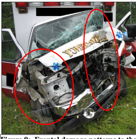
Figure 9: Frontal damage patterns to the ambulance.

Direct contact damage from the impact with the Toyota began 65 cm (25.5 in) right of center line and extended 28 cm (11 in) to the corner. The corner impact resulted in engagement on the right side plane extending rearward to the right front axle area. The right front fender crushed rearward, was pulled right laterally, and folded back over itself. The right headlight assembly was