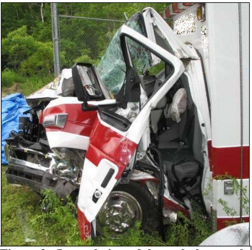
Figure 3: Lateral view of the ambulance cab.

The chassis was an incomplete chassis with the ambulance prep package, incorporating a two-door cutaway cab configured for a driver and front right