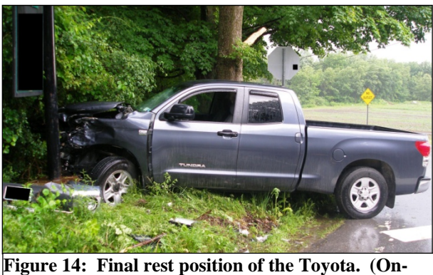
scene local police image)

The initial impact caused moderate damage to the front of the vehicle, crushing the left front fender laterally into the hood and underhood components. This deformation damaged and displaced the battery, headlight assemby, hood, grille, and bumper. The left front tire lost air pressure as a result of the impact, though photographs taken on-scene by police officers show that the tire remained mounted on the wheel rim and did not debead. As the ambulance engaged the Toyota, the front