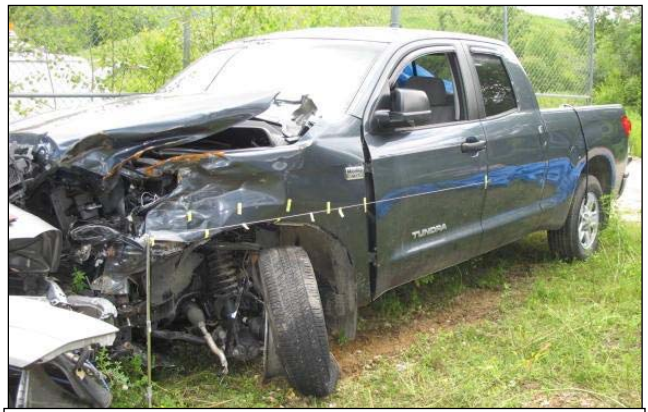
Figure 7: Left front oblique view of the Toyota.

The 2008 Toyota Tundra pickup truck was manufactured in April 2008 and identified by the VIN: 5TFBT54128X (production sequence deleted). Shown in Figure 7, this four-wheel drive pickup truck was configured with a short bed and four-door Power came from a 4.7-liter crew cab. iForce V-8 gas engine linked to a 5-speed automatic transmission. The odometer reading could not be obtained at the time of SCI inspection because the electrical system had been disabled as a result of the collision.