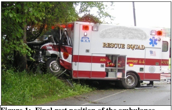
Figure 1: Final rest position of the ambulance.

This on-site investigation focused on the severity of an ambulance crash involving a 2009 Ford E450 chassis with an Osage Type III ambulance body and a 2008 Toyota Tundra pickup truck. The crash resulted in the death of the restrained 48-year-old male paramedic driver and injury of three occupants in the patient compartment. Figure 1 is an on-scene view of the ambulance at final rest.