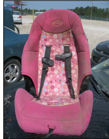
Figure 10: Second row left CRS.

The CRS installed in the second row left seating position was a Cosco/Dorel High Back booster seat that could be used as a forward-facing CRS or as a booster CRS ( Figure 10 ). The 5-point harness was installed in the CRS and the CRS was installed and used as a forward-facing restraint. The seat was manufactured on January 12, 2009, and was labeled with the Model NO. 22-233-PDP. A stamp on the rear aspect showed that this seat should not be used after December 2015. The seat was equipped with Lower Anchors and Tethers for Children (LATCH). The LATCH system was not in use at the time of the crash. The vehicle's safety belt had been routed through the forward-facing belt path at the rear shell of the CRS. The child passenger was restrained within the CRS by the 5-point harness system. The chest positioning clip was used.