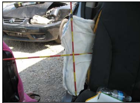
Figure 9: Right side impact air bag.

The right side impact air bag deployed from a 28 cm (11 in) panel in the upper outboard aspect of the right seatback. The air bag measured 11 cm (4.3 in) in width and 29 cm (11.4 in) in height. The air bag was not vented or tethered. There was no damage to the air bag and no occupant contact evidence on the air bag. Figure 9 depicts the front right side air bag.