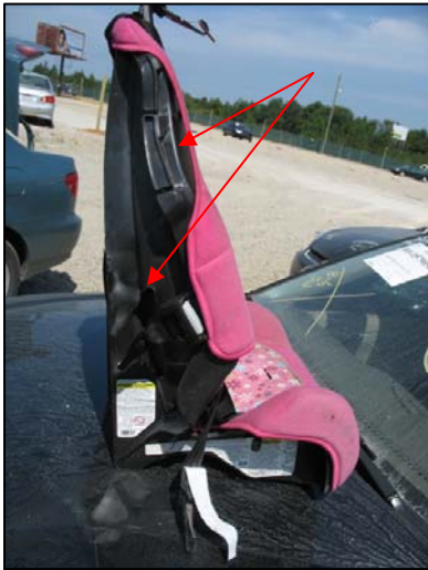
Figure11: Damage to the right side of CRS.

right side belt positioning clip for the shoulder belt when used as a booster seat. On the rear aspect of the CRS, there was abrasion on the shell at both rail sections and on the right rail, a 4 cm (1.6 in) wide by 14 cm (5.5 in) high section where a thin strip of plastic had separated from the shell. At the right side of the shell, there were two areas of color loss due to stress loading near the opening for the belt path and a 5 cm (2 in) area of stress loading on the upper right aspect neat the shoulder strap positioning clip. Figures 11 and 12 depict the damage to the CRS used in the second row left seating position.