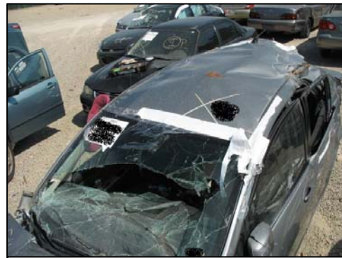
Figure 4: Overhead view of the rollover damage.