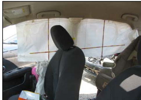
Figure 8: Right inflatable curtain air bag.

The right side impact air bag deployed from a 28 cm (11 in) panel in the upper outboard aspect of the right seatback. The air bag measured 11 cm (4.3 in) in width and 29 cm (11.4 in) in height. The air bag was not vented or tethered. There was no damage to the air bag and no occupant contact evidence on the air bag. Figure 9 depicts the front right side air bag.