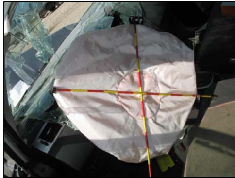
Figure 6: Driver's frontal air bag.

There were no occupant contact on the air bag; however, the left side of the face of the air bag included a plastic deployment transfer. The front right air bag was mounted within the top aspect of the right instrument panel. The front right seat was not occupied during the crash; therefore the CAC system suppressed the deployment of the air bag.