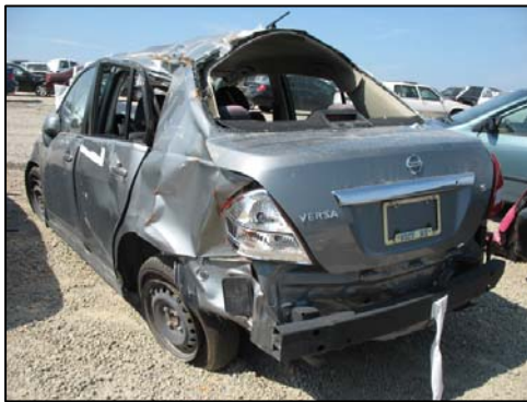
Figure 3: Rollover damage to the Nissan from the left rear.

The exterior of the Nissan sustained moderate severity damage to the left, top and right planes as a result of the rollover event. The scratches on the roof were oriented in multiple directions as the vehicle had rolled onto the roof at least twice during the event. The direct contact damage to the roof extended 108 cm (42.5 in) laterally from roof side rail to roof side rail and 332 cm (130.7 in) longitudinally from the leading edge of the hood to the backlight header. The maximum vertical and lateral crush was at the same location, on the left roof side rail 59 cm (23.2 in) aft of the B-pillar. The maximum vertical crush measured 10 cm (3.9 in), and the maximum lateral crush measured 13 cm (5.1 in). The windshield glazing was completely fractured with a laminate tear that extended from the left A-pillar to the right A-pillar approximately one-third of the distance from the top of the windshield. The left rear door window and quarter glazing, the backlight and the right front door windows all disintegrated during the rollover. The left front, right rear and right rear quarter glass was not damaged during the crash. All four doors remained closed during the crash and were operational post-crash. Figures 3 and 4 depict the rollover damage sustained by the Nissan. The CDC assigned for the rollover was 00TDDO3.