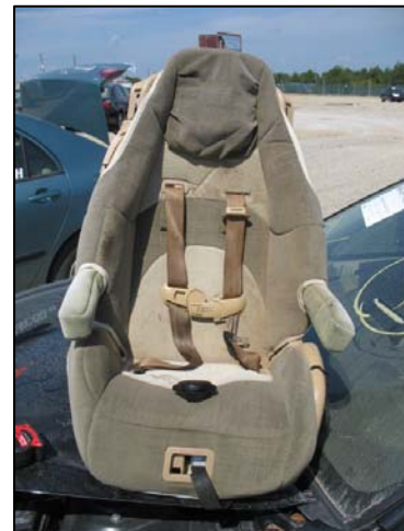
Figure 13: Second row right CRS.

The CRS installed in the second row right seat of the Nissan was a Cosco/Dorel Ventura DX High Back booster, Model No. 22-248-WAL. The CRS was manufactured on March 2, 2005 and could be used as a forward-facing CRS or a belt positioning booster. The CRS was installed in the Nissan as a forward-facing CRS. The child was secured within the CRS with the 5-point integral harness. The Nissan's safety belt was routed through the forward-facing belt path on the rear of the CRS. The seat was still installed in the Nissan at the time of the SCI inspection. There was slack in the safety belt system sufficient to allow 12 cm (4.7 in) of CRS movement in either the vertical or horizontal directions. The safety belt retractor was in the ELR mode. There was 159 cm (62.6 in) of the vehicle's safety belt spooled out of the retractor and routed through the CRS.