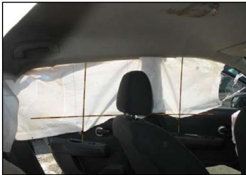
Figure 7: Left inflatable curtain air bag.