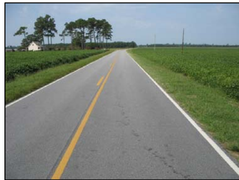
Figure 2: Northbound direction of travel.

The restrained 24-year-old female driver of the Nissan was operating the vehicle in a northbound direction on the two-lane roadway ( Figure 2 ). Her travel lane was straight and level. The Nissan was traveling at a driver estimated speed of 105-113 km/h (65-70 mph). The driver of the Nissan stated that she turned around and directed her attention to one of the children in the second row seat. As a result of her inattention, the Nissan drifted to the right and departed the roadway. The driver of the Nissan initiated an avoidance maneuver by applying the brakes and steering left in an attempt to return to the roadway. The Nissan yawed in a CCW direction down the embankment and entered the soft soil of the agricultural field. The front wheels and front undercarriage of the Nissan furrowed into the soft soil of the field.