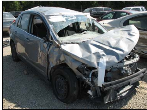
Figure 1: 2007 Nissan Versa case vehicle.

This on-site investigation focused on two Child Restraint Systems (CRS) that were installed in a 2007 Nissan Versa sedan ( Figure 1 ) that was involved in an off-road rollover crash. The Nissan was equipped with a Certified Advanced 208-Compliant (CAC) frontal air bag system, side impact air bags and inflatable curtain (IC) air bags. The manufacturer of the Nissan has certified that the vehicle is compliant to the advanced air bag portion of Federal Motor Vehicle Safety Standard (FMVSS) No. 208. The CAC system consisted of dual-stage frontal air bags for the