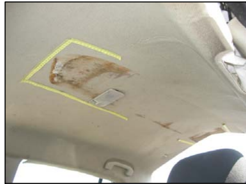
Figure 5: Roof contact to the Nissan.

The Nissan sustained moderate severity interior damage that was attributed to passenger compartment intrusion, occupant/CRS contact, and air bag deployment. The front right seatback and head restraint were deformed forward by contact with the unrestrained second row left CRS. This contact also resulted in three horizontal scuff marks to the cloth fabric on the rear aspect of the head restraint. All three marks were 6 cm (2.4 in) in width and were located 7, 10 and 14 cm (2.8, 3.9 and 5.5 in) below the top of the right head restraint. The front right seatback was displaced forward and there was a Z-shaped scuff mark in the cloth on the rear aspect of the seatback. This scuff mark was located 26-45 cm (10.2-17.7 in) below the top of the seatback and 10-28 cm (3.9-11 in) right of the left edge of the seat. The roof was abraded with a plastic and cloth transfer that was 113 cm (44.5 in) in length and 22 cm (8.7 in) in width, attributed to contact with the second row left CRS ( Figure 5 ).