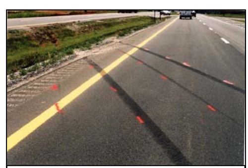
Figure 4. CCW rotation of the Lincoln off the south shoulder to the trip point.

The Lincoln crossed both westbound travel lanes ( Figure 3 ) and exited the south shoulder onto the stone at the edge of the median. The investigating officer (IO) documented a length of 101.8 m (334.0 ft) for the right rear yaw mark, 37.2 m (122.0 ft) of the left rear yaw mark, and 67.1 (220.0 ft) of the right front yaw mark. The left front yaw mark originated in the middle of the outboard travel lane and was not documented by the IO. All four tire marks ended on the stone shoulder at the north edge of the grass median. The right side tires apparently aired out as the Lincoln exited the paved shoulder onto the stone ( Figure 4 ). The alloy wheels engaged the dirt and stone surface and tripped the Lincoln into a right side leading rollover. At the trip point, the vehicle had rotated approximately 80 degrees CCW with respect to its path of travel and was rolling about its longitudinal axis. The Lincoln traveled over the depressed grass center median as the tires lost ground contact. At this early stage of the rollover, the front end of the Lincoln pitched downward.