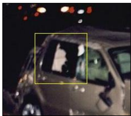
Figure 10. On-scene image of the status of the right rear door glazing.

An aftermarket deep window tint film was applied to the rear door glazing and possibly the rear quarter windows and backlight glazing. The left rear door glazing was closed and remained intact post-crash. The left rear quarter window, backlight, and right rear quarter window glazing was disintegrated during the crash. It is unknown if the left rear quarter window was disintegrated by body deformation or by the driver as she was ejected through this opening. The on-scene image of the Lincoln showed that the right rear door glazing was shattered and holed at the scene of the crash with the forward third portion of the glazing held in place by the aftermarket tint film