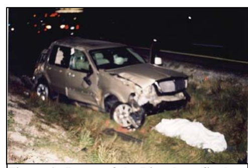
Figure 1. Image of the Lincoln at final rest.

This remote investigation focused on the rollover of a 2004 Lincoln Aviator sport utility vehicle. The Lincoln was equipped with frontal air bags, Inflatable Curtain (IC) air bags with rollover sensing, and laminated glazing in the front doors. The Lincoln was involved in a single vehicle loss of control crash on a four-lane divided roadway in a posted 72 km/h (45 mph) speed zone. The driver lost directional control following an aggressive steering input that resulted in a counterclockwise (CCW) yaw. The Lincoln entered the depressed grass median and tripped