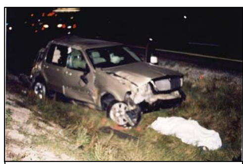
Figure 6. Final rest position of the Lincoln and the ejected driver.

The Lincoln rolled clockwise from the back plane contact and about its longitudinal axis and impacted the median with its right side, completing its third-quarter turn. This contact point was supported by abrasions to the right roof side rail area, the lower aspect of the right front door, and the right side of the hood. The right front fender, although displaced outboard of its original position, was not damaged by the ground contact. The Lincoln subsequently returned to its wheels (4<sup>th</sup>-quarter turn) and came to rest