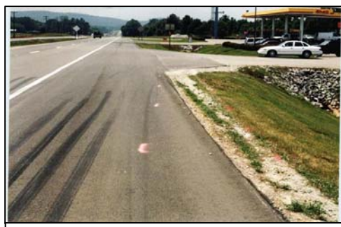
Figure 2. Point of departure from the north shoulder.