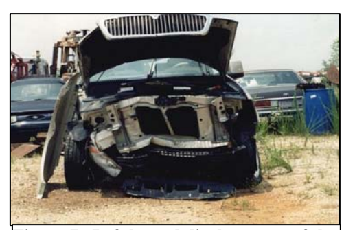
Figure 7. Left lateral displacement of the frontal structure.

The right step bar that was mounted to the sill between the A- and the C-pillars was crushed