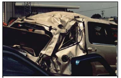
Figure 9. Close-up view of the crush to the right D-pillar area.

There was minor severity damage to the left side of the Lincoln that could not be attributed to this crash. A horizontally oriented abrasion was noted to the midline of the left rear door panel. A diagonally oriented pattern that resembled a guy wire impact originated at the dogleg of the right rear door/C-pillar area and extended upward to the left B-pillar.