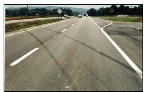
Figure 3. CCW yaw marks across travel lanes.

The Lincoln crossed both westbound travel lanes ( Figure 3 ) and exited the south shoulder onto the stone at the edge of the median. The investigating officer (IO) documented a length of 101.8 m (334.0 ft) for the right rear yaw mark, 37.2 m (122.0 ft) of the left rear yaw mark, and 67.1 (220.0 ft) of the right front yaw mark. The left front yaw mark originated in the middle of the outboard travel lane and was not documented by the IO. All four tire marks ended on the stone shoulder at the north edge of the grass median. The right side tires apparently aired out as the Lincoln exited the paved shoulder onto the stone ( Figure 4 ). The alloy wheels engaged the dirt and stone surface and tripped the Lincoln into a right side leading rollover. At the trip point, the vehicle had rotated approximately 80 degrees CCW with respect to its path of travel and was rolling about its longitudinal axis. The Lincoln traveled over the depressed grass center median as the tires lost ground contact. At this early stage of the rollover, the front end of the Lincoln pitched downward.