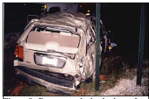
Figure 8. Damage to the back plane of the Lincoln.

The back of the Lincoln sustained severe damage that was biased to the upper right aspect of the D-pillar/backlight header juncture. The direct contact damage that consisted of abrasions and dirt and grass debris extended the full width of the rear bumper fascia and the backlight header. The upper right D-pillar was displaced forward and downward. The roof side rail between the C- and D-pillar was buckled and displaced downward from the back plane engagement. The right rear quarter panel was compressed forward and downward as a result of the back plane contact. The maximum vertical roof crush was located at the right D-pillar and was estimated at 20-25 cm (8-10 in). The upper D-pillar was displaced approximately 20 cm (8 in) forward. Figures 8 and 9 are images of the damage to the back plane of the Lincoln.