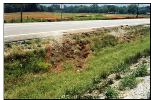
Figure 5. Initial contact with the median slope.