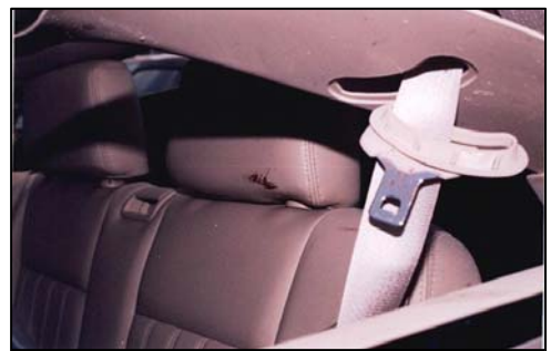
Figure 12. Body fluid evidence of the third row left head restraint and latch plate.

The back plane of the Lincoln impacted the median resulting in a forward crush pattern across the backlight header. The driver responded to this impact by initialing a rearward trajectory. She loaded the front left seat back, deforming the seat back rearward. The driver traveled between the seat backs of the first and second rows and contacted the third row left head restraint and safety belt buckle. Blood evidence was present on these components ( Figure 12 ).