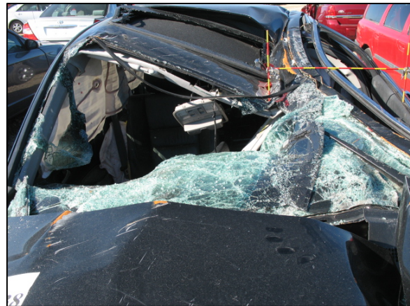
Figure 5: Vertical crush to the windshield header and left roof side rail.

During the rollover event, the front aspect of the Honda's undercarriage impacted a tree that consisted of a two 13 cm (5.1 in) tree trunks, which shared the same base. This impact resulted in minimal damage to the undercarriage and overlapped the initial impact damage from the embankment. The CDC assigned for this non-horizontal impact was 00UFD999 (99 = unknown values).