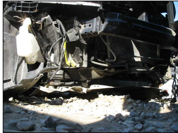
Figure 3: Undercarriage damage to the Honda, from lower right.

The rollover event resulted in two separate surface abrasion patterns on the left rear aspect of the roof, indicating that the Honda's top plane had contacted the ground on two separate occasions ( Figure 4 ). The longitudinal direct contact damage to the top plane began at the leading edge of the hood and extended rearward 448.0 cm (176.4 in) to the rear of the trunk lid. Laterally, the direct contact damage extended 112.0 cm (44.1 in) between roof side rails. The maximum vertical crush measured 40 cm (15.7 in), which was located on the windshield header 21 cm (8.3 in) inboard of the left roof side rail. The maximum lateral crush was located at the junction of the windshield header and the left A-pillar, which measured 18 cm (7.1 in). During the rollover, the right rear wheel impacted the ground, resulting in deformation and separation of the suspension components that allowed for the wheel to be displaced under the vehicle. Figure 5 depicts the maximum roof crush to the Honda. The CDC assigned for the rollover event was 00TDDO6.