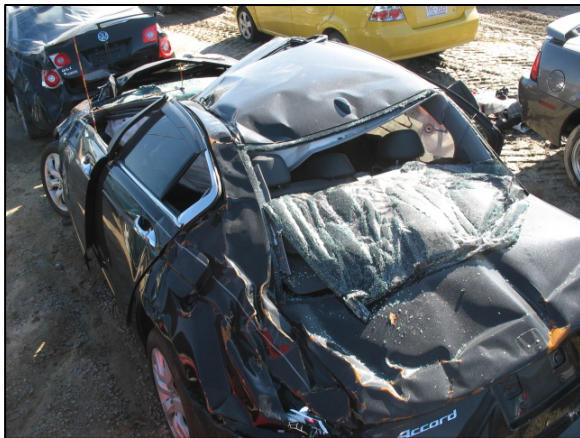
Figure 4: Overhead view of the rollover damage to the Honda.