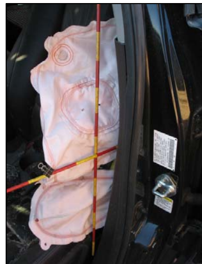
Figure 8: Left side impact air bag.

The side impact air bags deployed from panels in the outboard aspects of the front seatbacks. These panels measured 45.0 cm (17.7 in) in height. The seatback mounted air bags measured 28.0 cm (11 in) in width and 57 cm (22.4 in) in height in the deflated state. These side air bags contained one vent port located on the outboard aspect of forward most top corner. There was no damage or contact evidence on either side impact air bag. Figure 8 depicts the left side impact air bag.