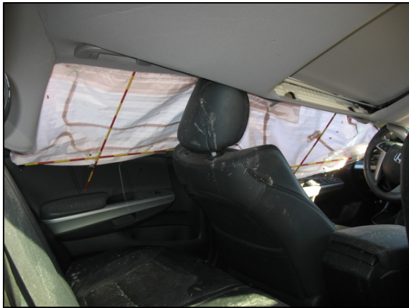
Figure 6: Interior view of the deployed left IC air bag.

Figure 6 depicts the deployed left IC air bag. The left IC was labeled with the following nomenclature: 2420364 2006082701 250608GL31 S. Figure 7 depicts the right IC air bag. The right IC was labeled with the following nomenclature: 2420364 2406082706 260608GL32 S.