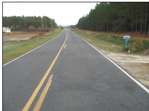
Figure 2: Pre-crash trajectory of the Honda.

The restrained 30-year-old female driver of the Honda was operating the vehicle eastbound in a shallow left curve on the rural roadway at a driver estimated speed of 97-105 km/h (60-65 mph). It was raining heavily at the time of the crash. Figure 2 depicts the Honda’s pre-crash trajectory. As the Honda entered the straight and level segment of roadway, the vehicle lost traction and initiated a CCW yaw. The Honda’s loss of traction was attributed to the vehicle’s relative speed in conjunction with the lack of