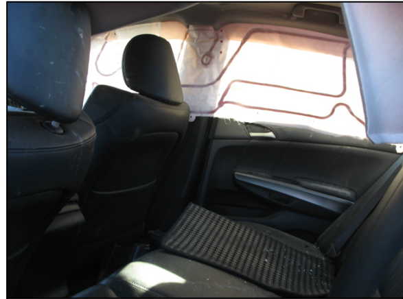
Figure 7: Interior view of the right IC air bag.

The side impact air bags deployed from panels in the outboard aspects of the front seatbacks. These panels measured 45.0 cm (17.7 in) in height. The seatback mounted air bags measured 28.0 cm (11 in) in width and 57 cm (22.4 in) in height in the deflated state. These side air bags contained one vent port located on the outboard aspect of forward most top corner. There was no damage or contact evidence on either side impact air bag. Figure 8 depicts the left side impact air bag.