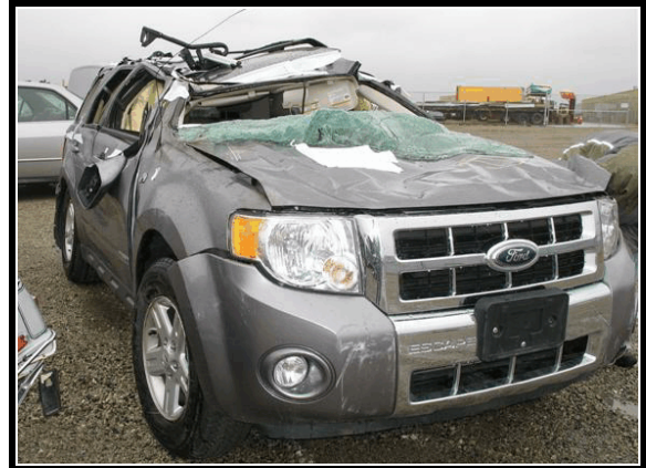
Figure 1. Subject vehicle, 2008 Ford Escape Hybrid

This investigation focused on a 2008 Ford Escape Hybrid that sustained multiple impacts and rolled over ( Figure 1 ). This two-vehicle crash occurred in November 2009 at 1410 hours in an unincorporated area of California. The crash site was the four-leg intersection of a north/south roadway and an east/west roadway. The subject vehicle was being driven by a 37-year-old female. The other vehicle is a 2003 Chevrolet Cavalier that was being driven by a 23-year-old female. The Chevrolet was traveling north and slowed in preparation to turn left at the intersection. The Ford was traveling north directly behind the Chevrolet at an EDR-reported speed of 80.28 km/h (49.88 mph). The Chevrolet initiated a left turn and the driver of the Ford attempted to avoid impacting the Chevrolet by steering left. The right side of the Ford impacted the left front of the Chevrolet causing the driver of the Ford to lose control of her vehicle. The left and right IC air bags deployed during this side impact. The vehicle then departed the northbound roadway on the right side, impacted a mail box unit, overturned five quarter-turns, and came to rest on its left side in a ravine. The Chevrolet came to rest in the intersection.