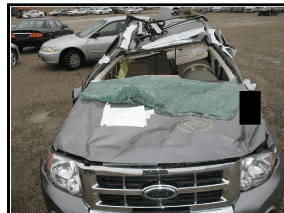
Figure 7. Top rollover damage (Event 3)

The Ford sustained moderate damage to the top plane during the rollover event ( Figure 7 ). The direct damage to the top of the vehicle extended laterally from roof side rail to roof side rail and measured 142.0 cm (55.9 in). The damage extended from the backlight header forward 374.0 cm (147.2 in). The maximum vertical crush was located 53.0 cm (20.9 in) from the vehicle centerline at the right roof 3.0 cm (1.2 in) from the right A-pillar and measured 28.0 cm (11.0 in). The maximum lateral crush on the right roof side rail was located 127.0 cm (50.0 in) aft of the front axle and measured 5.0 cm (1.9 in). The CDC for Event 3 was 00TDDO4.