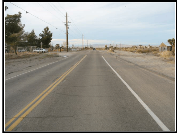
Figure 2. Northbound approach

southbound travel lane that were separated by double yellow lines prior to the intersection ( Figure 2 ). The asphalt roadway was straight and had an undulating profile. A hillcrest was located 82.9 m (272.0 ft) south of the intersection. At 60.9 m (200 ft) from the intersection the profile was a negative 5.4%, at 30.5 m (100.0 ft) the profile was a negative 2.9%, and at 15.2 m (50.0 ft) the profile was a negative 2%. At the intersection, the roadway began a positive grade and the profile was 1.5%. The posted speed limit was 89 km/h (55 mph). North of the intersection, the east edge of the roadway was delineated by a white stripe, followed by a 2.7 m (9.0 ft) asphalt shoulder, followed by a generally level area of dirt/gravel that terminated in a ravine that was located approximately 13.7 m (45.0 ft) from the road edge. The ravine was generally parallel with the roadway but had an irregular alignment and varying widths. The depth of the ravine ranged from 1.5m (5.0 ft) to 2.4 m (8.0 ft). East of the roadway there were three sets of group cluster mailbox units. The mailbox unit located furthest north measured 142.0 cm (55.9 in) in height and 143.0 cm (56.2 in) wide; it was supported by four 7.0 cm (2.8) diameter pipes that were embedded in a concrete base. The east/west intersecting roadways had an asphalt and dirt composition and were controlled by stop signs. The weather was clear and visibility in all directions was good.