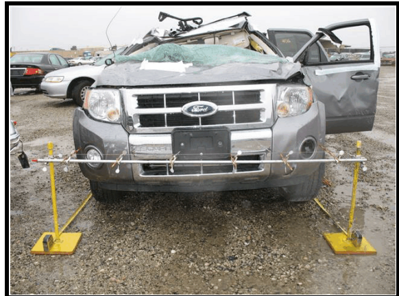
Figure 6. Frontal damage

The Ford sustained minor front end damage from the impact with the mailboxes ( Figure 6 ). The damage extended from bumper corner to bumper corner. Six crush measurements were taken at the bumper level as follows: C_1 = 1.0 cm (0.4 in), C_2 = 1.0 cm (0.4 in), C_3 = 0 cm, C_4 = 0 cm, C_5 = 0 cm, C_6 = 0 cm. Maximum crush was located at C1. The CDC for Event 2 was 12FDLW1.