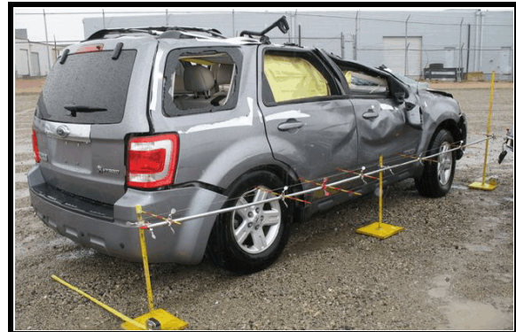
Figure 5. Right side crush profile (Event 1)

The Ford sustained direct and induced damage to the right side from the impact with the Chevrolet ( Figure 5 ). The direct damage began at the left rear bumper corner and extended forward 412.0 cm (162.2 in). The Field L measurement was identical to the direct damage measurement. Six crush measurements were taken at the frame level as follows: C_1 = 3.0 cm (1.2 in), C_2 = 0 cm, C_3 = 1.0 cm (0.4 in), C_4 = 2.0 cm (0.8 in), C_5 = 1.0 cm (0.4 in), C_6 = 1.0 cm (0.4 in). Maximum crush was located 120.0 cm (47.2 in) forward of rear bumper corner and measured 5.0 cm (1.9 in). The Collision Deformation Classification (CDC) for Event 1 was 01RDES1.