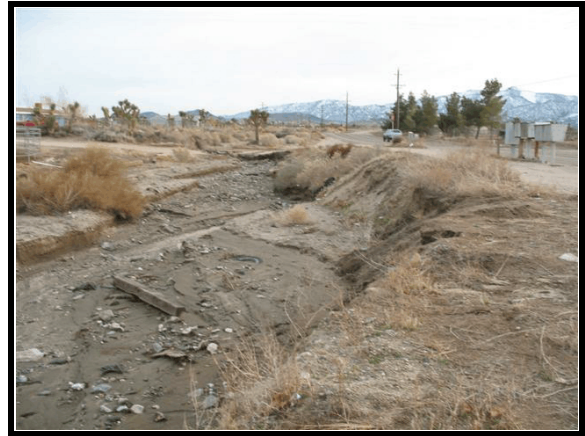
Figure 4. Overview of final rest (south)

The driver of the Ford sustained minor lacerations to both hands and complained of pain to her neck and back. She was able to exit the vehicle under her own power and was examined at the scene by paramedics. She indicated that she would seek her own medical treatment. The driver of the Chevrolet complained of pain to his neck and back and was transported to a local hospital for treatment. Both vehicles were towed due to damage and the Ford was later declared a total loss by the insurance company. The mailbox unit was damaged and was replaced prior to the scene inspection.