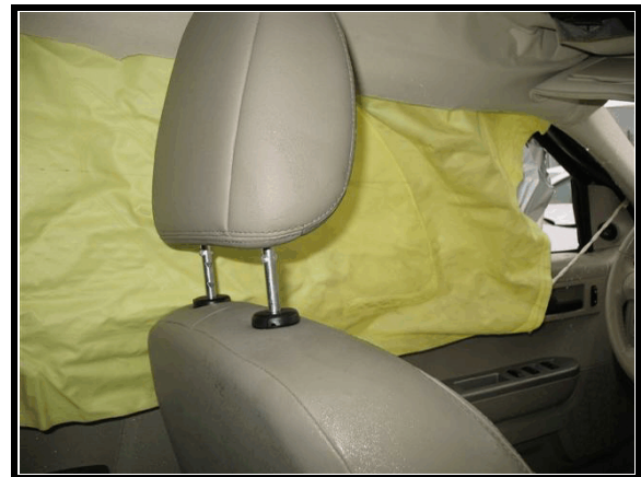
Figure 9. Left IC air bag

This vehicle's Supplemental Restraint System (SRS) included a Restraint Control Module (RCM), driver and passenger frontal air bags, seat-mounted side air bags for the front row, combination rollover/side impact IC air bags, and safety belt pretensioners for the front row. The Ford was a Certified Advanced 208-Compliant (CAC) vehicle and was equipped with advanced frontal air bags. The multi-stage air bags were certified by the manufacturer to be compliant with the advanced air bag requirements of Federal Motor Vehicle Safety Standard (FMVSS) No. 208. The driver's air bag was located within the steering wheel hub and the front right passenger air bag was located within the middle of the right instrument panel. During the side impact, the left and right IC air bags deployed ( Figure 9 ). The frontal and seat-mounted side air bags did not deploy.