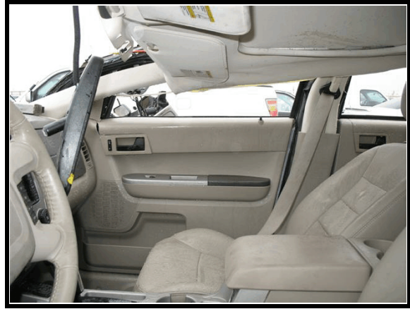
Figure 8. Roof intrusion

The front row seating positions were equipped with 3-point manual lap and shoulder belts with sliding latch plates, adjustable D-ring anchorage assemblies, and buckle/retractor pretensioners. The driver's safety belt had an Emergency Locking Retractor (ELR) and the front right passenger's safety belt had a switchable ELR/Automatic Locking Retractor (ALR).