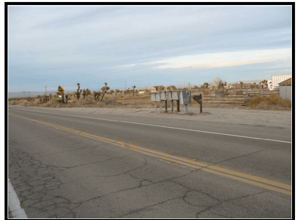
Figure 3. Path to impact with mailbox unit

The right side of the Ford impacted the left front of the Chevrolet (Event 1), and the driver of the Ford lost control of her vehicle. The left and right IC air bags deployed and the driver's pretensioner actuated during this side impact. The EDR indicated that the driver began braking again. The Ford began a clockwise rotation, crossed the northbound travel lane, departed the northbound roadway on the right side ( Figure 3 ) and impacted a metal mailbox unit (Event 2), and then began a left side leading rollover (Event 3). At one second prior to the rollover, the EDR reported that the vehicle speed was 25 km/h (16 mph). The Ford