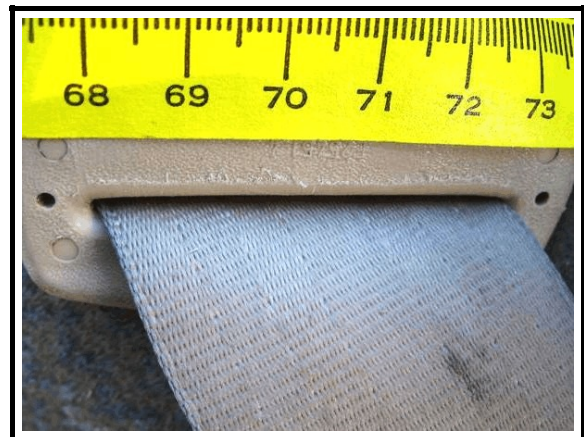
Figure 7. Left rear position safety belt latch plate showing occupant load marks

The front right passenger's safety belt D-ring was in the full-down position and the latch plate was scratched indicating historical usage. The lap and shoulder belt webbing were cut during extrication activities and at the time of the inspection the latch plate was found inserted into the buckle ( Figure 6 ). The lap belt webbing was cut 43.0 cm (16.9 in) from the latch plate and the shoulder belt webbing was cut 41.0 cm (16.1 in) from the latch plate. The upper section of the shoulder belt was in the spooled out position and measured 41.0 cm (16.1 in) from the D-ring. The safety belt retractor was not functional due to B-pillar deformation. Based on the vehicle inspection, the front right safety belt was used to restrain the front right occupant during the crash.