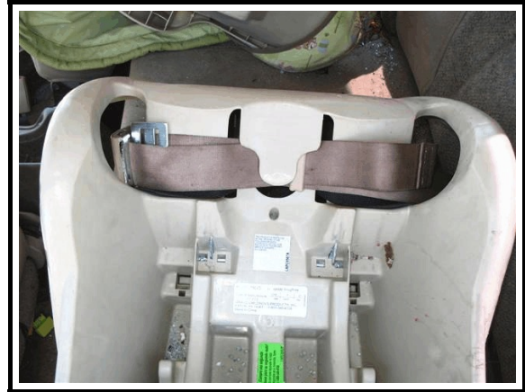
Figure 8. Rear center seat position lap safety belt as found routed through ISS base

The Saturn was equipped with upper tether anchors for the second row seats and was not equipped with lower anchors.