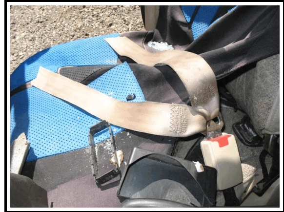
Figure 6. Front right occupant's safety belt as found during vehicle inspection

The Saturn's front row seating was equipped with 3-point manual lap and shoulder safety belts with sewn-on latch plates and adjustable D-rings. The driver's safety belt was equipped with an Emergency Locking Retractor (ELR) and the front right passenger's safety had a switchable ELR/Automatic Locking Retractor (ALR). The driver's safety belt D-ring anchorage was in the full-up position, the latch plate was scratched indicating historical usage, and the safety belt webbing showed wear marks. The vehicle's EDR reported the driver's safety belt switch circuit status as unbuckled. The safety belt webbing and D-ring did not reveal evidence of occupant loading and the steering wheel was severely deformed due to occupant loading. Based on the vehicle inspection it was determined the driver was not restrained by the safety belt during the crash.