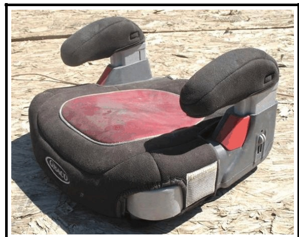
Figure 9. Graco TurboBooster BSS

The Saturn's second row left seat position was occupied by a 4-year-old male occupant seated in a Graco TurboBooster forward-facing belt positioning BSS ( Figure 9 ). The TurboBooster was intended to be used with or without a detachable high back support with a headrest, depending on the user's age, height and weight. The occupant was using the BSS without a back support at the time of the crash. Proper usage of the BSS required it be used in combination with the vehicle's lap and shoulder belt and not the lap