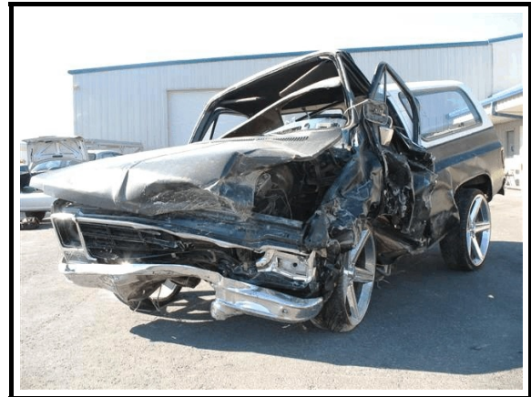
Figure 2. Other vehicle, 1979 Chevrolet Blazer

The crash occurred on an undivided two-lane roadway in June 2010 in the state of Nevada. The Saturn was being driven westbound by an unrestrained 26-year-old male. The front right occupant was a restrained 19-year-old female. The other vehicle was a 1979 Chevrolet Blazer ( Figure 2 ) that was being driven eastbound by a 24-year-old male. While traveling at a high rate of speed, the driver of the Saturn lost control of the vehicle and entered the eastbound lane. The Saturn initiated a counterclockwise yaw and the front end of the Chevrolet impacted the right side of the Saturn. Following the impact, the Saturn came to rest on the roadway and the Chevrolet departed the roadway and overturned in a ditch.