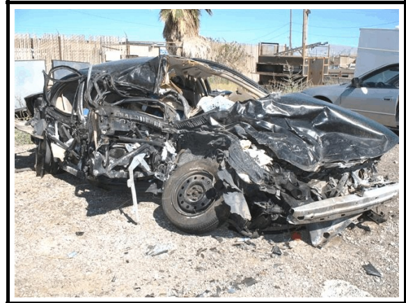
Figure 1. Subject vehicle, 1996 Saturn SL1

This on-site investigation focused on the Child Restraint Systems (CRS) used by two occupants in a 1996 Saturn SL1 ( Figure 1 ) that was involved in a crash with another vehicle. The Saturn's second row occupants were a 4-year-old male seated in a forward-facing belt positioning booster safety seat (BSS) and a 12-week-old female seated in a rear-facing infant safety seat (ISS). During the crash, the 4-year-old male sustained non-incapacitating injuries and the 12-week-old female was not injured. The vehicle's driver and front right occupant died following the crash from their injuries.