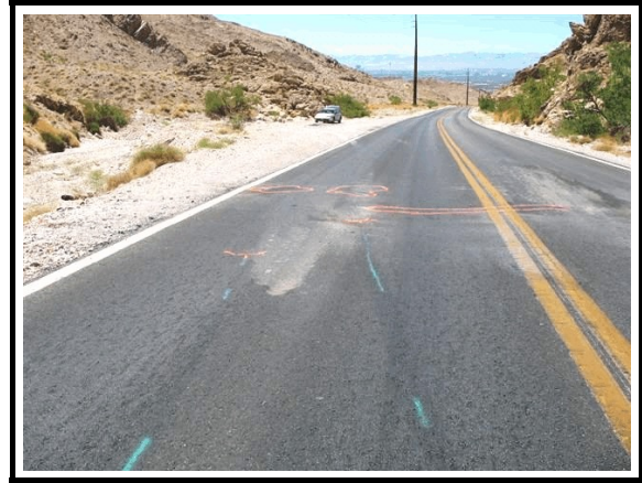
Figure 4. View showing the Saturn's westbound approach to the point of impact in the eastbound travel lane

including the Saturn's tire yaw marks, a scrape mark located 80.0 cm (31.5 in) north of the south roadway edge, and a fluid spill deposit. For Event 1 the directions of force were within the 2 o'clock sector for the Saturn and the 12 o'clock sector for the Chevrolet. Following the first impact, the Saturn continued its counterclockwise rotation and was displaced rearward. It deposited a scrape mark measuring 2.3 m (7.5 ft) in length across the center line on its path to final rest, which was identified by a fluid spill deposit. The vehicle came to rest facing north in the eastbound lane and its estimated post-impact travel distance to final rest was 4.0 m (13.0 ft).