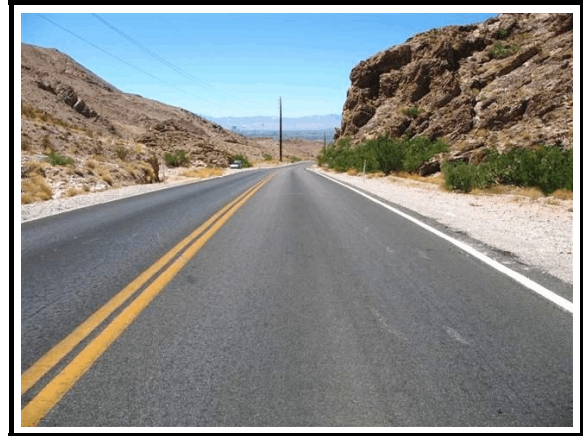
Figure 3. Crash site, looking west

The crash occurred on an undivided east/west asphalt roadway that had a posted speed limit of 72 km/h (45 mph). At the time of the crash, conditions were dusk without street lamp illumination, partly cloudy and dry. The temperature at the nearest reporting station was 34.0° C (93.2° F), winds were east/southeast at 5.6 km/h (3.5 mph) and visibility was 16.0 km (10.0 mi).