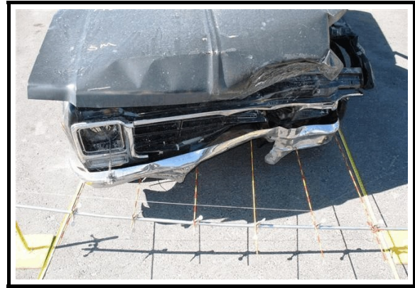
Figure 11. Front end crush profile measurement, 1979 Chevrolet Blazer

The direct damage to the front end began at the front left bumper corner and extended 178.0 cm (70.1 in) to the right. The Field L was distributed from bumper corner to bumper corner and measured 162.0 cm (63.8 in). Six crush measurements were taken at bumper level as follows ( Figure 11 ): C_1 = 74.0 cm (29.1 in), C_2 = 61.0 cm (24.0 in), C_3 = 59.0 cm (23.2 in), C_4 = 31.0 cm (12.2 in), C_5 = 20.0 cm (7.9 in), C_6 = 5.0 cm (2.0 in). Maximum crush was located at C_1 . Additionally, induced damage extended down the left side 347.0 cm (136.6 in) and ended 25.0 cm (9.8 in) aft of the left rear axle. The CDC for Event 1 was 12FDEW3.