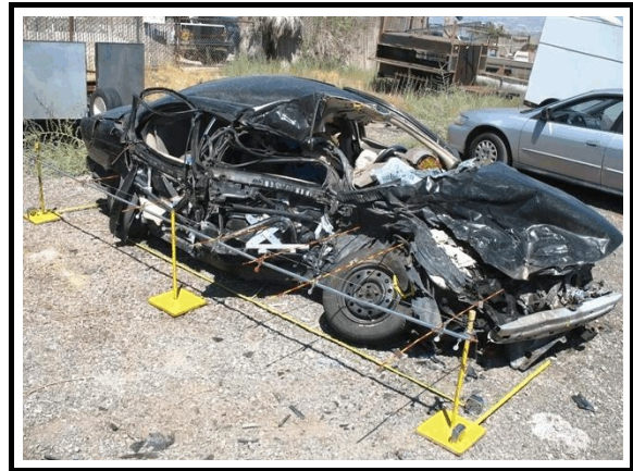
Figure 5. Right side crush profile measurement of subject vehicle

The direct damage to the right side began 95.0 cm (37.4 in) forward of the rear axle and extended forward 220.0 cm (86.6 in) to the front right bumper corner. The Field L extended from the rear bumper corner to the front bumper corner and measured 378.0 cm (148.8 in). Vertically, the direct damage to the right side extended from the sill to the roof and measured 109.0 cm (42.9 in). Six crush measurements were taken at mid-door level as follows ( Figure 5 ): C_1 = 8.0 cm (3.1 in), C_2 = 0 cm, C_3 = 7.0 cm (2.8 in), C_4 = 50.0 cm (19.7 in), C_5 = 54.0 cm (21.3 in), C_6 = 19.0 cm (7.5 in). Maximum crush was located 199.0 cm (78.3 in) forward of the rear axle between C_4 and C_5 and measured 59.0 cm (23.2 in). The Collision Deformation Classification (CDC) for Event 1 was 02RYAW4.