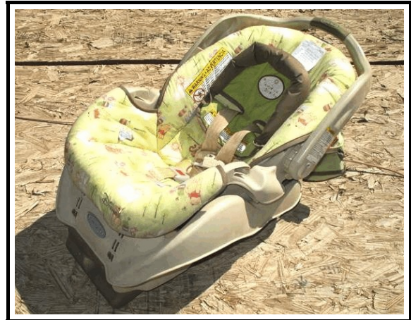
Figure 10. Graco SnugRide rear-facing ISS

The Saturn's second row center seat position was occupied by the 12-week-old female occupant seated in a Graco SnugRide rear-facing ISS ( Figure 10 ). During the vehicle inspection the ISS was located in the center seat position with the vehicle's lap belt routed through the rear-facing slots. A locking clip was attached to the lap belt webbing near the latch plate.