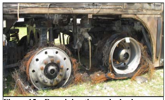
Figure 15. Remaining tire and wheel material at the right rear axle positions.

The outer left drive axle wheel was burned/melted with the bolt pattern area remaining intact. The molten aluminum cooled to a puddle at the bottom aspect of the wheel. Fragments of the tire remained at the bottom of the tread. The inner aluminum wheel at the left drive axle position was completely melted. The inboard left drive axle tire was completely consumed by the fire with the wire bead and steel tread ply remaining. The left tag axle wheel was melted with a minimal amount of wheel reaming at the lower bolt