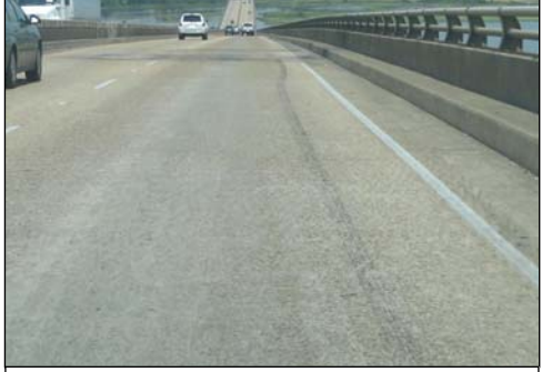
Figure 7. Approach of the motorcoach to the incident site and the right tag axle tire mark.

The motorcoach began its return trip of approximately 1,561 km (970 mi) on the evening prior to this daytime incident. At an average speed of 105 km/h (65 mph), the trip would take approximately 16 hours non-stop. All passengers boarded the motorcoach with small carry-on items and personal belongings, with their larger luggage and musical instruments stowed in the large storage compartments underneath the passenger compartment. After driving approximately 800 km (500 mi) through the night, the motorcoach stopped at a pre-