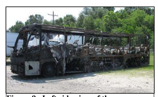
Figure 9. Left side view of the motorcoach.

The left side of the motorcoach sustained extensive damage with near total consumption of all materials excluding the frame (Figure 9). The majority of the exterior body panels and glazing were completely consumed by the fire. The aluminum window frames and the rubber gaskets were completely consumed. The inner panel of the access door at the lower forward portion of the motorcoach remained intact, located between the lower A and B-pillar. This door provided