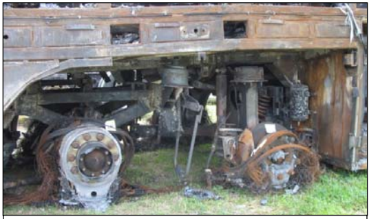
Figure 14. Tire and wheel remains at the left rear axle positions.

The OEM-style aluminum wheels were equipped with a stainless steel trim ring at the bolt pattern and lug nut caps. The left front wheel was blackened by soot; however, the trim ring and lug caps remained intact. The right front wheel was not damaged.