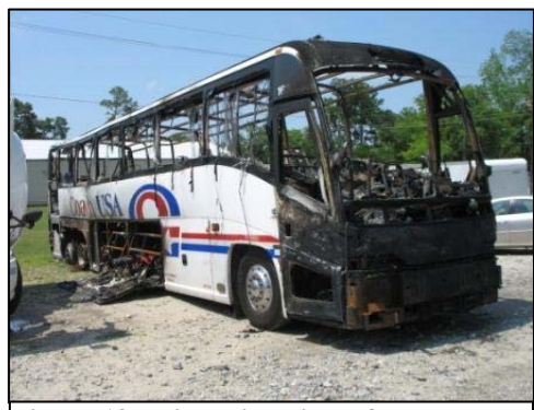
Figure 12. Right side view of the motorcoach.

The right side of the motorcoach sustained extensive damage above the level of the beltline. The body panels below the beltline remained intact with scattered charring and blistering of the painted surfaces (Figure 12). The body panel at the location of the right E-pillar was bowed as a result of partial separation due to heat. All of the glazing panels melted with glass fragments remaining at the corners. The aluminum window frames were predominately intact with scattered melting and distortion of the material. The wheelchair access door to the passenger compartment was completely consumed by the