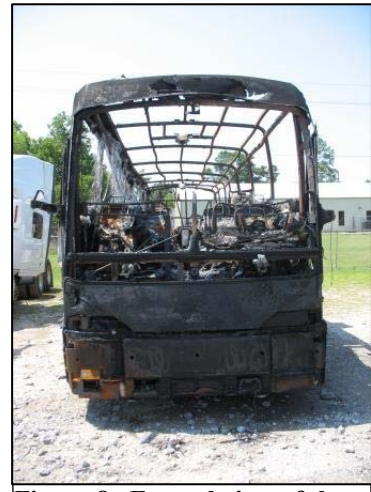
Figure 8. Frontal view of the MCI motorcoach.

All frontal components including the windshield glazing, bumper fascia, and painted surfaces were burned by the fire (Figure 8). The upper fiberglass panel above the windshields was burned full-thickness at the center area and had begun to collapse inward. The outer portions remained intact, although the paint had burned off. In the upper right corner, a portion of the identifying motorcoach number remained discernable. Both windshields were completely consumed. The lower portions of the windshield gaskets were charred, but remained in place. All other sections of the gaskets were completed consumed by the fire. The lower 56 cm (22 in) of the extruded aluminum center divider between the two windshields remained intact. The upper aspect of this support was completed melted. All windshield wiper components were melted. The fiberglass paneling below the windshields