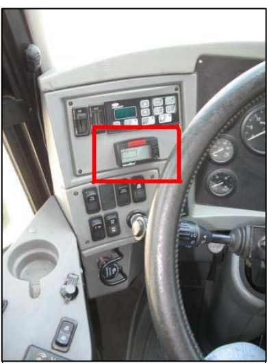
Figure 4. Exemplar SmarTire installation