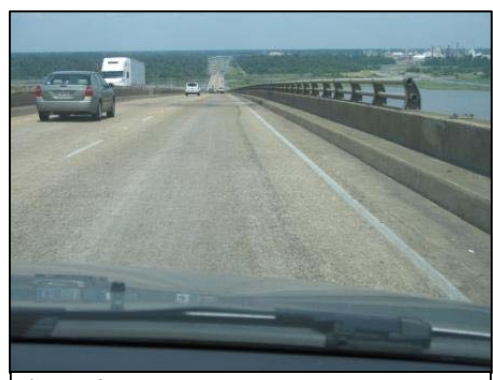
Figure 2. Westbound approach to the incident site.

This incident occurred on a 3 km (2 mi) long, two-lane, asphalt surfaced interstate bridge that extended over a large waterway. In the motorcoach's direction of travel, the bridge initially extended in a westerly direction, elevated and curved right to the north-northwest direction before straightening out at its crest. The high-elevation bridge then remained straight on its down slope as it transitioned to level ground. The travel lanes were bordered by narrow asphalt shoulders and a concrete bridge rail. At the time of the incident, a construction