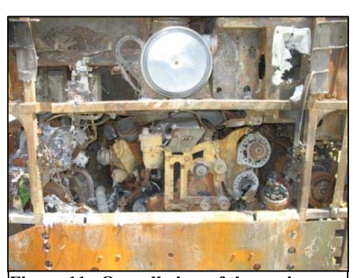
Figure 11. Overall view of the engine compartment.

Within the engine compartment, all belts, hoses, wires. connectors. insulation. and other combustible material were completely consumed by the fire. The fiberglass valve cover was charred and burned through at several locations. The majority of the aluminum components were burned and melted. The mounts to the lower of two alternators had melted and separated. The turbocharger was intact and displayed no evidence of high heat, and the exhaust pipe to the muffler was intact and in place. A normal amount of soot was present inside the exhaust tailpipe. Some paint residue remained on the air