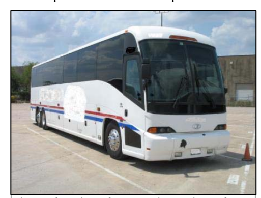
Figure 3. Right front oblique view of an exemplar motorcoach.

The motorcoach involved in this incident was a 2005 MCI Model J4500, with a 55-passenger capacity, inclusive of the driver. The motorcoach was identified by the Vehicle Identification Number (VIN): 2M93JMDA15W (production number deleted), and was similar to the exemplar motorcoach shown in Figure 3 . The motorcoach company reported that the motorcoach was purchased and placed in service on December 9, 2004. The actual mileage is unknown, and no reading could be obtained during the SCI inspection as all components had been consumed by the fire.