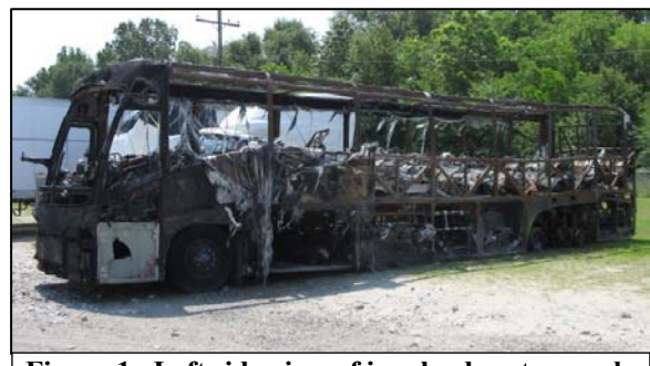
Figure 1. Left side view of involved motorcoach.

This on-site investigation focused on the origin and severity of a fire that consumed a 2005 Motor Coach Industries (MCI) Model J4500 motorcoach. The vehicle was in-transit, occupied by a 63-year-old male driver and 32 passengers consisting of 26 middle school students and six adult chaperones. The motorcoach was traveling westbound on an interstate roadway and was traversing a high-