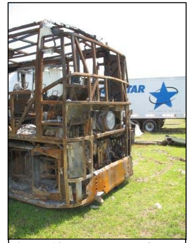
Figure 10. Back plane of the motorcoach.

All of the back mounted components were completely burned by the fire (Figure 10). The composite rear bumper fascia was completely consumed as were all taillight and marker light assemblies. The engine compartment door was fiberglass with a steel frame that was top hinged. The external panel was totally consumed and the door framework was in the open position at the time of the SCI inspection. The upper fiberglass panels above the engine compartment were completely burned with exposure of the structural frame of the motorcoach. This framework was minimally distorted by heat; however, there was no evidence of high heat oxidation.