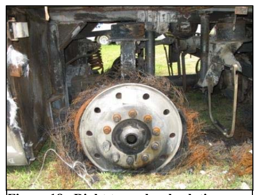
Figure 18. Right tag axle wheel, tire remnants, and the adjacent undercarriage.

The dragging right tag axle tire self-combusted due to increased friction against the road surface. The remote location of the motorcoach prevented disassembly and a thorough inspection of the