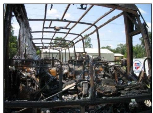
Figure 16. Overall view of the burned interior of the motorcoach.

The fire spread to the interior of the motorcoach and consumed all combustible materials and components (Figure 16). The aircraft-style overhead storage compartments and components were completely burned. The ceiling of the motorcoach was consumed and the plywood floor was completely burned. The seat cushions, fabric and composite armrests were burned. The tubular seat frames remained with all falling rearward as the recline mechanisms released due