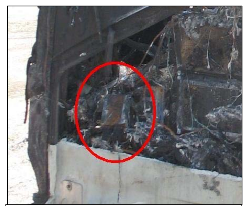
Figure 17. Remnants of the SmarTire receiver

On the right drive axle, both the inboard and outboard drive band clamps were still present, with markings on the outboard wheel indicating the location where it was mounted. Also, the band clamp from the tag axle was found among the tire and wheel remnants.