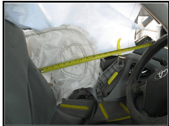
Figure 7. Seat-mounted side impact air bag