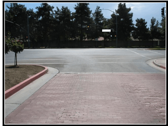
Figure 3. Southbound approach