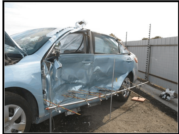
Figure 4. Left side damage, 2009 Toyota Camry

Six crush measurements were documented along the lower door as follows: C_1 = 0 cm, C_2 = 12.0 cm (4.7 in), C_3 = 22.0 cm (8.7 in), C_4 = 27.0 cm (10.6 in), C_5 = 24.0 cm (9.4 in), C_6 = 0 cm. Maximum crush was located at 129.0 cm (50.7 in) aft of the front axle and measured 37.0 cm (14.5 in). The height of the maximum door crush was 43.0 cm (16.9 in) and the Door Sill Differential (DSD) was 23.0 cm (9.0 in). The Collision Deformation Classification (CDC) for Event 1 was 10LPEW2.