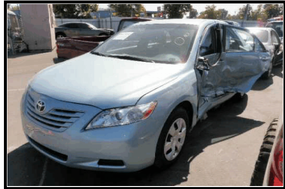
Figure 1. Subject vehicle, 2009 Toyota Camry

This on-site side air bag investigation was identified by a Dynamic Science, Inc. (DSI) investigator from a review of an auto auction internet sale list. DSI obtained images of the vehicle from the auction facility website and obtained the police report. On September 27, 2010, DSI submitted images of the subject vehicle and a copy of the police report to the National Highway Traffic Safety Administration (NHTSA) for review and on September 28, 2010 DSI was instructed to commence the investigation. Field work was completed on October 5, 2010. The Toyota's Event Data Recorder (EDR) was imaged during the inspection and the data is summarized later in this report.