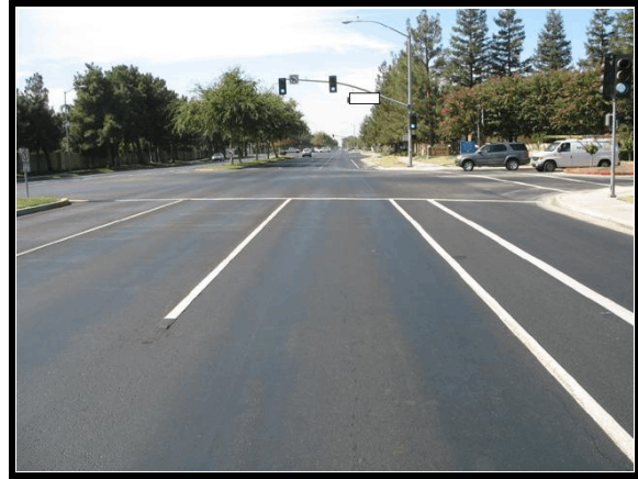
Figure 2. Westbound approach

The driver of the Kia was unable to stop in time and the front end of the Kia impacted the left side of the Toyota (Event 1). The missing vehicle algorithm of the WinSMASH program computed a Total Delta-V of 21.0 km/h (13.0 mph). The longitudinal and lateral components were -10.0 km/h (-6.8 mph) and 18.0 km/h (11.2 mph), respectively. The Barrier Equivalent Speed (BES) was 26.0 km/h (16.1 mph). The results appear reasonable based on the crush profile and vehicle speeds. The EDR reported a maximum longitudinal Delta-V of 16.4 km/h (10.2 mph) at 100 milliseconds (ms) after Algorithm Enable (AE), a maximum lateral Delta-V of 30.5 km/h (19.0 mph) at the B-pillar at 34 ms, and a maximum lateral Delta-V of 36.3 km/h (22.6 mph) at the C-pillar at 74 ms. The impact resulted in sufficient lateral deceleration of the Toyota to command the deployment of the left side IC air bag and the driver's seat-mounted side impact air bag. For the Kia, the WinSMASH program computed a Total Delta-V of 24.0 km/h (14.9 mph). The longitudinal and lateral components were -24.0 km/h (-14.9 mph) and -4.0 km/h (-2.5 mph), respectively.