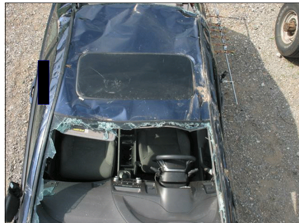
Figure 4: Rollover damage to roof