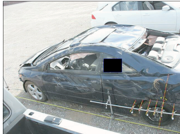
Figure 3: Left side rollover and sign post impact damage

Exterior Damage Event 2: The Honda sustained damage on the both side planes and the top plane during the rollover (event 2). The direct damage on the left side plane began 39 cm (15.4 in) forward of the left front axle and extended 353 cm (138.9 in) rearward along the left fender, A-pillar, door, and quarter panel ( Figure 3 ). The direct damage on the right side plane began 57 cm (22.4 in) forward of the right front axle and extended 350 cm (137.8 in) rearward along the right fender, A-pillar, door, and quarter panel. The direct damage on the top of the Honda began on the roof at the windshield header and extended 55 cm (21.6 in) along the roof rail, tapering off to the left side of the vehicle ( Figure 4 ). The maximum width of the direct damage was 108 cm (42.5 in). The maximum lateral crush was located at the right roof side rail ( Figure 5 ), 90 cm (35.4 in) forward of the right rear axle and measured 3.5 cm (1.4 in). The maximum vertical crush was located at the right rear roof area ( Figure 6 ), 64 cm (25.1 in) forward of the right rear axle, and measured 13 cm (5.1 in). The left and right side wheelbases were extended 1 cm (0.4 in) but there was no other induced damage. Based on the amount of crush to the roof, the severity of the rollover damage was moderate.