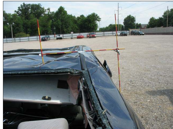
Figure6: Vertical max crush to roof

The vehicle manufacturer’s recommended tire size was P205/55R16. The Honda was equipped with tires of the recommended size. The vehicle’s tire data are shown in the table below.