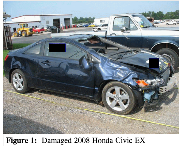
Figure 1: Damaged 2008 Honda Civic EX

The focus of this on-site investigation was the 2008 Honda Civic EX, which rolled over after departing the roadway. This crash was brought to the National Highway Traffic Safety Administration's (NHTSA) attention on June 22, 2010 by the Transportation Research Center at Indiana University. This investigation was assigned on July 12, 2010. The crash involved only the Honda ( Figure 1 ). The crash occurred in May, 2010, at 0940 hours, in Missouri and was investigated by the Missouri State Highway Patrol. The crash scene was inspected on July 19, 2010 and the Honda on July 20, 2010. The occupant interview was completed on July 26, 2010. This report is based on the police crash report, vehicle inspection, crash scene inspection, inspection of an exemplar vehicle, front right passenger interview, occupant kinematic principles, and evaluation of the evidence.