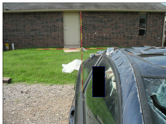
Figure 5: Lateral max crush to right roof rail

Damage Classification Event 2: The CDC for the rollover was 00TYDO2. The WinSMASH program could not be used to calculate the Delta V for this event since rollovers are out of scope for the program. Based on the extent of the roof crush, the severity of the rollover damage was minor.