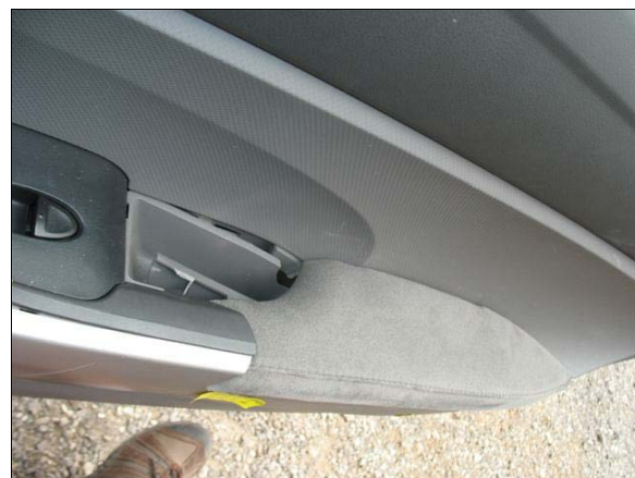
Figure 7 Deformed right arm-rest

Vehicle Interior: The inspection of the Honda’s interior revealed evidence of occupant contact on the right front door arm rest (Figure 7). The arm rest was probably deformed from contact by the passenger’s right hip during the rollover.