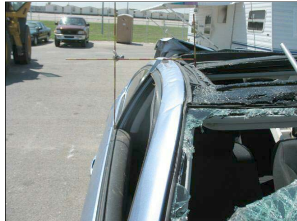
Figure 7: The maximum vertical crush to the roof of the Scion

Exterior Damage Event 3: Both side planes and the top plane of the Scion were damaged during the rollover. The damage on the left side plane began 49 cm (19.3 in) forward of the left front axle and extended 110 cm (43.3 in) rearward along the left fender, hood, and A-pillar. The damage resumed 68 cm (26.8 in) forward of the left rear axle and extended 140 cm (55.1 in) rearward along the roof side rail, C-pillar, and quarter panel. The damage on the right side plane began 323 cm (127.2 in) forward of the right rear axle and extended 87 cm (34.3 in) rearward along the right fender. The damage resumed 70 cm (27.6 in) forward of the right rear axle and