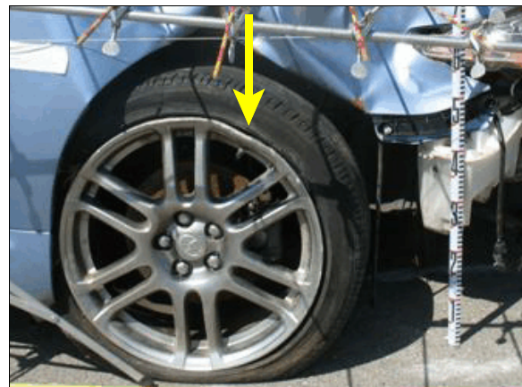
Figure 4: The right front wheel rim was dented (arrow) and the wheel displaced rearward 12 cm (4.7 in) from the culvert impact