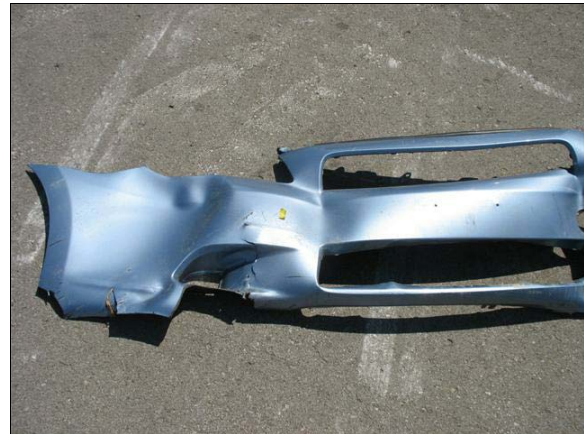
Figure 3: Direct damage on the front right corner of the bumper fascia of the Scion from the impact with the culvert

The 2009 Scion tC was a front wheel drive, 2-door lift-back (VIN: JTKTDE167590-----), equipped with a 2.4-liter, L-4 gasoline engine and a 4 speed automatic transmission. The front row was equipped with bucket seats with folding backs, adjustable head restraints, lap-and-shoulder