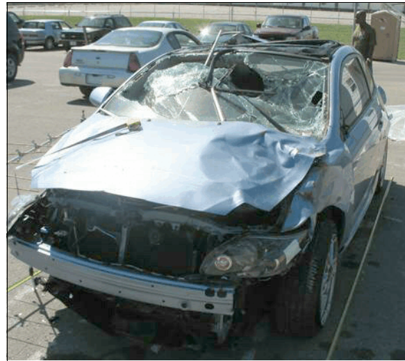
Figure 6: Damage to the Scion from the rollover

safety belts, driver and front right passenger dual stage frontal air bags, driver’s knee air bag, front seat-mounted side impact air bags, and side impact IC air bags that provided protection for the front and second row outboard occupants. The second row was equipped with a bench seat with folding backs, lap-and-shoulder safety belts, adjustable head restraints, and Lower Anchors and Tethers for Children (LATCH) in the outboard seating positions. The driver estimated the vehicle’s mileage was approximately 40,234 kilometers (25,000 miles). The vehicle’s specified wheelbase was 270 cm (106.3 in).