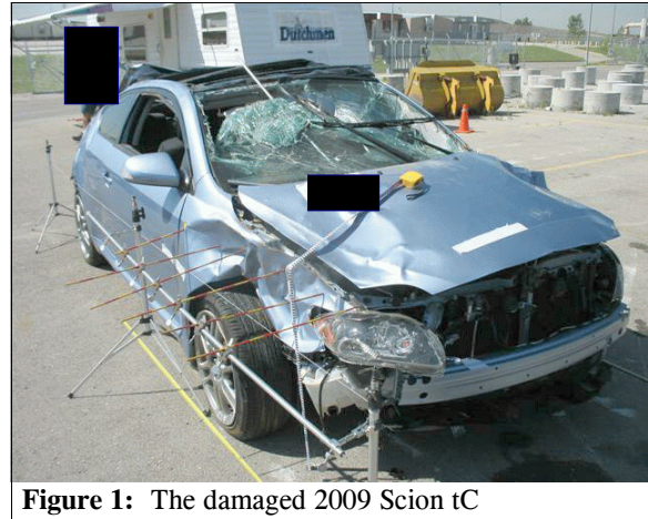
Figure 1: The damaged 2009 Scion tC

This on-site investigation focused on the rollover of a 2009 Scion tC. This crash was brought to the National Highway Traffic Safety Administration's (NHTSA) attention on August 10, 2010 by the Transportation Research Center at Indiana University. This investigation was assigned on August 19, 2010. The crash involved only the Scion ( Figure 1 ), which departed the roadway and rolled over after impacting a culvert. The crash occurred in July, 2010, at 2315 hours, in Missouri and was investigated by the Missouri State Highway Patrol. The Scion and the crash scene were inspected on August 25-26, 2010. A resident of the property where the crash occurred was interviewed on August 25, 2010. The driver was interviewed on August 30, 2010. This report is based on the police crash report, vehicle inspection, crash scene inspections, inspection of an exemplar vehicle, driver interview, occupant kinematic principles, and evaluation of the evidence.