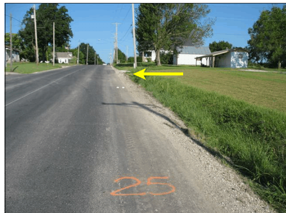
Figure 2: Approach of the Scion to area of roadway departure; arrow shows location of culvert impact

Crash Environment: This crash occurred on a 2-lane, state highway during night time hours and heavy rain. There was no artificial lighting. At the time of the crash, the roadway was under construction and the pavement was new bituminous. The police crash report indicated that the centerline and road edges were marked by raised reflectors. The driver stated during the SCI interview that no construction warning signs were present. The roadway traversed in an east-west direction and had two straight through lanes. The eastbound lane was 4 m (13.1 ft) in width. The westbound lane was 4.3 m (14.1 ft) in width. The roadway had a positive 5% grade to the east and was bordered by gravel shoulders. The north shoulder was 1.6 m (5.2 ft) in width, while the south shoulder was 0.5 m (1.6 ft) in width. Based on the SCI interview with a resident of the property where the crash occurred, at the time of the crash, the south shoulder surface dropped approximately 15 cm (6 in) from the roadway surface. A ditch 0.6 m (2 ft) in depth was adjacent to this shoulder. A culvert and residential driveway were located on the south side of the roadway where the initial impact occurred. The speed limit was 97 km/h (60 mph), which reduced to 48 km/h (30 mph) approximately 30 m (98 ft) prior to the impact. There was no traffic on the roadway at the time of the crash. The site of the crash was rural. The Crash Diagram is on page 10 of this report.