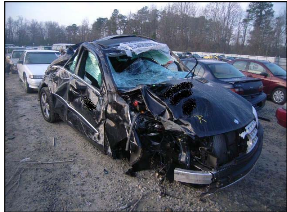
Figure 1: Front right oblique view of the 2011 Mercedes ML350.

This on-site investigation focused on the rollover and source of occupant injury for the run-off-road, rollover crash of a 2011 Mercedes-Benz ML350 ( Figure 1 ). This vehicle was identified by the Calspan Special Crash Investigations (SCI) team through a visit to a regional vehicle salvage facility on March 25, 2011. Based on the rollover of the late model year vehicle and the injured status of the passengers, this case was assigned by the Crash Investigation Division (CID) of the National Highway Traffic Safety Administration (NHTSA) for investigation on March 25, 2011. The on-site portion of the investigation was initiated on March 29, 2011 and involved the inspection and documentation of the Mercedes and the crash scene, and a detailed interview with the driver.