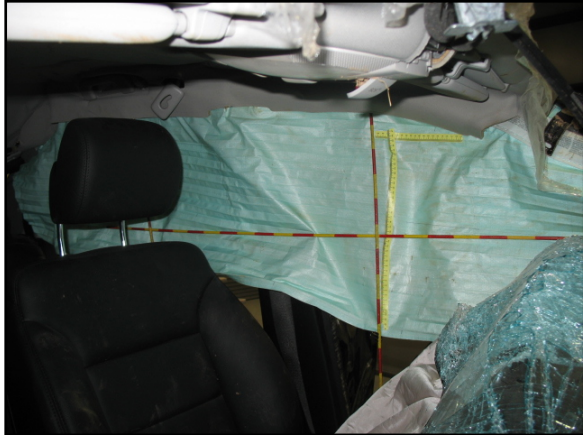
Figure 10: View of the Mercedes left IC, including the driver contact.