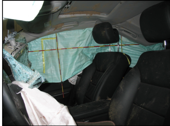
Figure 11: View of the Mercedes right IC including the front right passenger contact.

front right passenger's head. On the outboard side of the right IC, at the right front window, were two abrasions from contact with the ground. The first was in the upper left quadrant of the right front window, 6-16 cm (2.4-6.3 in) below the top of the IC and 2-17 cm (0.8-6.7 in) forward of the right B-pillar. The second ground contact abrasion was located 18-40 cm (7.1-15.7 in) below the top of the right IC and 19-41 cm (7.5-16.1 in) aft of the front edge of the right IC.