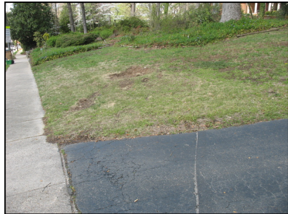
Figure 3: Eastbound trajectory view of the Mercedes at the initiation of the rollover.