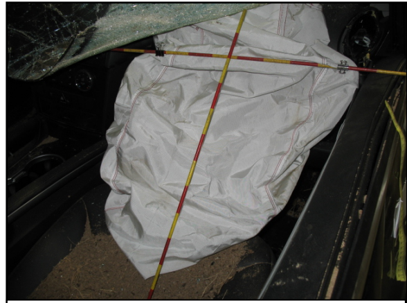
Figure 9: Overall view of the Mercedes front right passenger's air bag.

The front right passenger's frontal air bag ( Figure 9 ) was mounted within the upper aspect of the right instrument panel by a single cover flap. This flap measured 25 cm (9.8 in) in width and 12 cm (4.7 in) in height. The deflated air bag was 60 cm (23.6 in) in height and 38 cm (15 in) in width. It was vented by a single vent port at the upper right side of the air bag, and had no internal tethers. There was no crash related damage to the front right air bag. There was an area of post-crash blood located at the lower right on the side of the air bag that measured 15 cm (5.9 in) in width and 28 cm (11 in) in height.