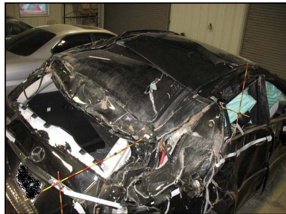
Figure 6: Overhead view of the Mercedes from the right rear corner.

The top plane of the Mercedes sustained severe damage and the left and right planes sustained moderate damage as a result of the rollover (Event 3). This damage is depicted in Figure 6 . On the top plane, the direct damage began at the