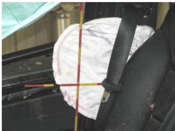
Figure 12: Lateral view of the front row right side impact air bag.

The two right side impact air bags of the Mercedes also deployed during this crash sequence ( Figures 12 and 13 ). The front right side air bag deployed from a 32 cm (12.6 in) tear seam in the upper outboard aspect of the front right seatback. The deflated air bag measured 18 cm (7.1 in) in width and 26 cm (10.2 in) in height. It was vented by one port located slightly below the forward 3 o'clock position on the air bag. The right side air bag was not tethered. It was not damaged and did not contain any crash related evidence. The second row right side air bag deployed from a 36 cm (14.2 in) tear seam in the upper outboard aspect of the seatback.