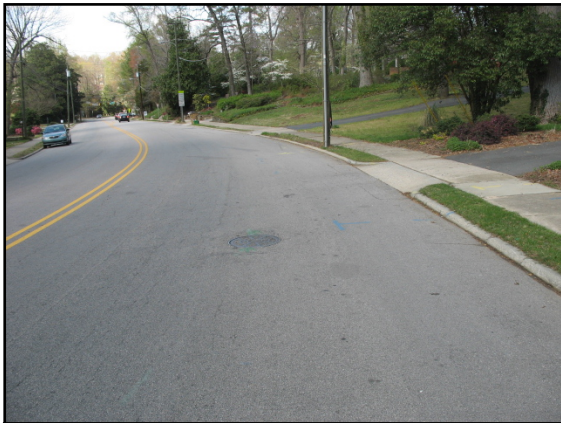
Figure 2: Eastbound trajectory view of the Mercedes approaching the road departure and the initial utility pole impact.