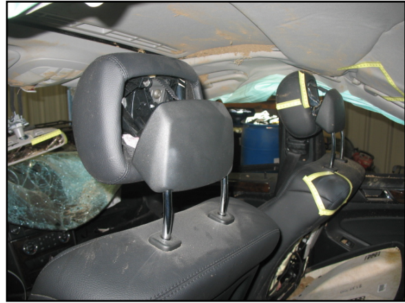
Figure 7: Left lateral view of the contacts within the Mercedes second row.

restraint, and the right roof slightly aft of the right B-pillar. The evidence on the back of the driver's seat was attributed to the second row passenger's left knee. This contact evidence was located 21-28 cm (8.3-11 in) below the top of the seat and 5-12 cm (2-4.7 in) inboard of the left edge of the seat. The scuff mark located on the upper left corner of the front right seatback measured 10 cm (3.9 in) in width and 12 cm (4.7 in) in height and was attributed to the passenger's chest. The scuff mark on the inboard aspect of the front right head restraint was located 0-8 cm (0-3.1 in) below the top of