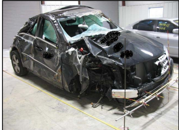
Figure 5: Front right oblique view of initial impact damage to the Mercedes.

The initial impact with the utility pole caused the Mercedes to initiate a Clockwise (CW) yaw. The shearing of the pole allowed the vehicle to maintain its trajectory to the east. The front plane of the Mercedes impacted a mailbox (Event 2). This frontal damage from the Event 2 impact was overlapped by the initial impact and subsequent rollover damage, and was not measured.