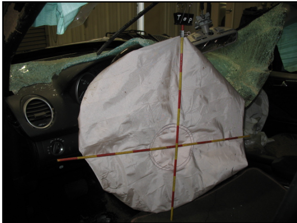
Figure 8: Overall view of the driver's frontal air bag in the Mercedes.

air bag and the other located in the upper left quadrant on the back side of the air bag. The deployed frontal air bag is depicted in Figure 8 .