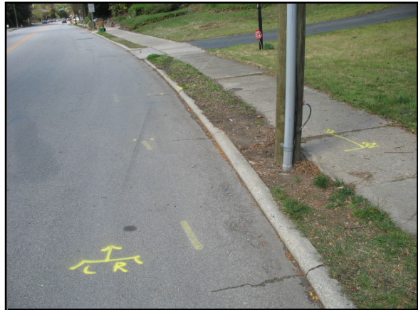
Figure 4: Eastbound trajectory view of the Mercedes at the initial (Event 1) point of impact.

The driver of the Mercedes was operating the vehicle eastbound, negotiating the left curve, at a police-reported speed of 56 km/h (35 mph). The Mercedes departed the roadway to the right in a tracking attitude at a shallow angle of approximately 3 degrees. The front right corner of the Mercedes approached the utility pole on the south roadside. Based on the SCI scene inspection, there was no evidence of braking or steering avoidance maneuvers prior to the initial impact with the utility pole ( Figure 4 ).