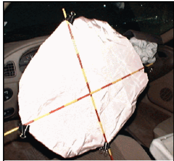
Figure 2: Case vehicle's driver air bag

The case vehicle's driver air bag was located in the steering wheel hub. An inspection of the air bag module's cover flaps revealed that the flaps opened along the perforations, with no evidence of damage to the flaps. The driver air bag was round, with a diameter of approximately 54 centimeters [21.3 inches]. Vent ports were located at the 10 and 2 o'clock positions, and the air bag had no tethers. A smudge of pink makeup, probably lipstick, was found near the center of the air bag ( Figure 2 ). The driver air bag was otherwise unremarkable. The interior inspection also revealed that the steering wheel rim was bent forward, approximately 1 centimeter (0.4 inches), in the upper quadrant. There was no evidence of steering column movement.