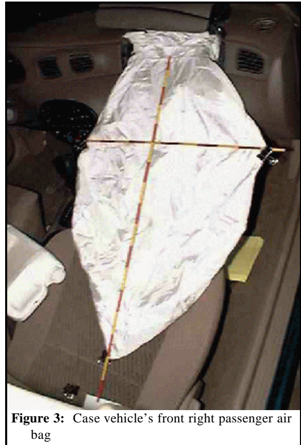
Figure 3: Case vehicle's front right passenger air bag

The case vehicle driver did not make any avoidance maneuvers prior to the crash. Based on the use of her available safety belts, she most likely remained in her pre-crash seating position. The impact with vehicle #1 caused the driver air bag to deploy and caused the driver to move forward and slightly to the left, towards the 350 [-10] degree direction of principal force. Because she was restrained by her safety belt system, she encountered the deployed air bag in an upright posture, leaving a lipstick smudge slightly above the center of the air bag. Because her forward motion was cushioned by the air bag, she did not load the safety belt webbing with sufficient force to cause any bruising. The upper quadrant of the steering wheel rim was bent slightly forward by the back of the air bag as a result of the air bag being compressed by the driver's head and torso. The case vehicle's driver stated that she was uninjured except that her jaw felt sore, but with no swelling or discoloration, and she did not seek any medical treatment. No ambulance came to the scene.