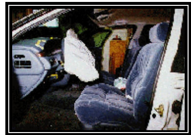
Figure 10. Driver's seated position.

The driver of the Chrysler New Yorker was seated in a presumed upright posture with the power seat track adjusted 2.5 cm (1.0") forward of the full rear position. The seat back support was adjusted to 18 degrees rearward of vertical and the adjusted head restraint was in the full down position. With the seat adjusted to this position, the horizontal distance between the mid point of the driver air bag module and the seat back support was 57.2 cm (22.5"). [This is inclusive of 2.5 cm (1.0") of steering column compression.] Figure 10 is a profile view of the driver's seated position with respect to the frontal air bag. He was not wearing the 3-point manual lap and shoulder belt system. The belt system was fully retracted against the B-pillar with the D-ring adjusted to a point that was 2.5 cm (1.0") below the top adjustment position. The lack of belt usage was supported by kinematics of the driver and his interior contact points. Additionally, the belt system was in new condition with no evidence of belt loading or routine usage indicators.