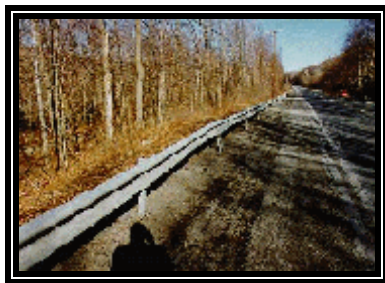
Figure 3. Deflection of the W-beam guardrail.

The front left corner area of the New Yorker impacted the W-beam guardrail resulting in minor damage to the vehicle. The 12 o'clock impact force redirected the vehicle in a clockwise (CW) direction which allowed the left rear area of the New Yorker to engage with the guardrail. The W-beam guardrail system consisted of a single rail with weak post I-beam supports spaced on 3.7 m (12.0') centers. The contact damage on the guardrail system was continuous with a maximum lateral displacement of 27.9 cm (11.0") to the corrugated beam ( Figure 3 ).