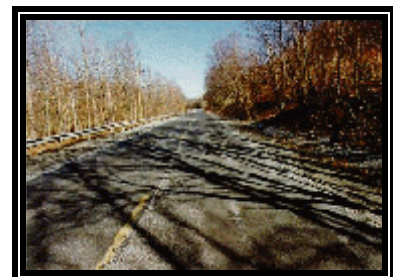
Figure 2. Overall view of the crash scene.

The crash occurred on a rural two-lane state route ( Figure 2 ) in February 1997, during daylight hours. The asphalt road surface was slush covered from mixed precipitation. In the vicinity of the crash scene, the roadway was straight with a one-percent positive grade to the east and a posted speed limit of 89 km/h (55 mph). The travel lanes were bordered by stone shoulders with a W-beam guardrail system paralleling the left (north) shoulder. The right shoulder was bordered by an embankment with a mixture of trees.