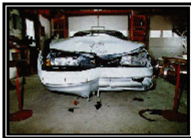
Figure 7. Frontal damage resulting from the tree impact.

The center frontal area of the Chrysler subsequently impacted a 30.5 cm (12.0") diameter tree resulting in a 12 o'clock direction of force. Maximum bumper crush was 39.1 cm (15.375"), located on the bumper reinforcement bar immediately left of the vehicle's centerline. The direct contact damage began 5.1 cm (2.0") right of center and extended 19.1 cm (7.5") to the left. The narrow impact deformed the full frontal width of the vehicle resulting in a combined induced and direct damage width of 134.6 cm (53.0"). The impact crushed the bumper fascia, the styro-foam filler panel, and the bumper reinforcement bar. A crush profile was documented at the level of the reinforcement bar and was as follows: C1 = 5.7 cm (2.25"), C2 = 17.8 cm (7.0"), C3 = 32.4 cm (32.4"), C4 = 24.8 cm (9.75"), C5 = 6.4 cm (2.5"), C6 = 0 cm [-12.1 cm (-4.75")].