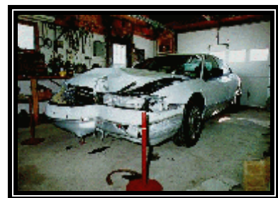
Figure 5. Front left bumper damage from the initial guardrail impact.

The initial contact damage with the W-beam guardrail system involved the front left corner area of the Chrysler New Yorker. The direct contact damage began on the corner of the bumper fascia and extended 26.0 cm (10.25") inboard. The contact abraded the bumper fascia and displaced the corner area of the fascia with no residual crush to the bumper structure ( Figure 5 ). As the contact deflected the guardrail, the leading edge of the left front fender engaged against the rail. The contact displaced the left headlamp assembly, abraded the side aspect of the wrap-around bumper fascia, and fractured the composite left front fender. The damage extended 71.1 cm (28.0") longitudinally onto the left front fender and side aspect of the fascia.