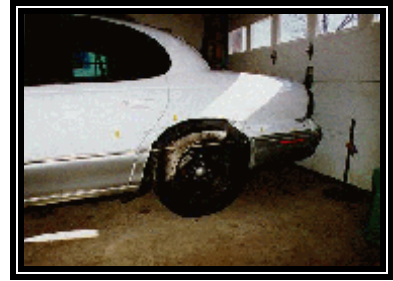
Figure 6. Secondary guardrail impact damage to the left rear quarter panel.

The guardrail system redirected the vehicle in a clockwise (CW) direction as it separated from the barrier. Due to this CW deflection, the left rear quarter panel subsequently impacted the W-beam in a sideswipe configuration, resulting in an impact force within the 12 o'clock sector. The direct contact damage began on the left rear door (21.4") forward of the left rear axle and extended 108.6 cm (42.75") rearward onto the left quarter panel, terminating at the rear bumper corner ( Figure 6 ). A crush profile was documented for this impact and was as follows: C1 = 0.6 cm (0.25"), C2 = 3.2 cm (1.25"), C3 = 3.8 cm (1.5"), C4 = 1.0 cm (0.4"), C5 = 0.2 cm (0.1"), C6 = 0 cm.