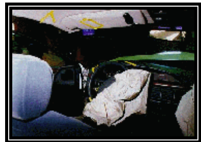
Figure 11. Driver's trajectory and contact points.

The driver's torso loaded the deployed front left air bag and compressed the expanded bag against the steering column. As a result of the thoracic loading, the energy absorbing steering column compressed approximately 2.5 cm (1.0"). There was no deformation of the steering wheel. The air bag provided the driver with a sufficient ride down of the crash forces and mitigated potential thoracic injury. His scalp contacted and scuffed the left sun visor 34.3-38.7 cm (13.5-15.25") left of center. There was no deformation to the visor and the integral vanity mirror remained intact. A scuff mark was noted to the side rail 27.9-32.4 cm (11.0-12.75") rearward of the windshield header. The driver's head probably impacted the left roof side rail as he rebounded from his initial trajectory during the post-crash spin-out of the vehicle. Figure 11 is an overall view of the driver's trajectory and contact points.