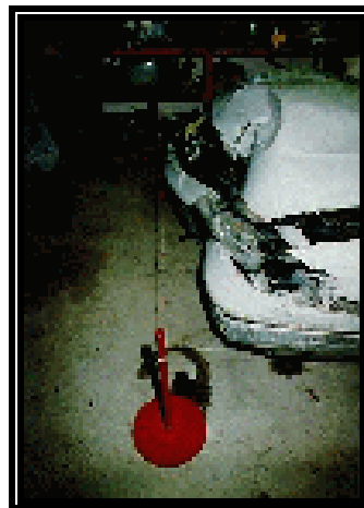
Figure 8. Profile view documenting the depth of frontal crush.

Components damaged by the frontal impact included the bumper system, grille, hood, radiator support panel, radiator, and the air conditioning condenser.