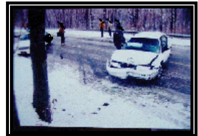
Figure 1. Lookback view of the New Yorker's frontal air bag deployment crash.

This on-site crash investigation focused on the injury mechanisms and cause of death of a 66 year old female front right passenger of a 1995 Chrysler New Yorker. The Chrysler was equipped with frontal air bags for the driver and right passenger positions that deployed as a result of a center frontal impact with a tree. The driver lost control of the vehicle on a slush covered roadway and initially sideswiped a W-beam guardrail with the left side of the New Yorker. The vehicle was redirected across the roadway initiating a clockwise yaw prior to departing the right road edge. The center frontal area of the New Yorker impacted a 30 cm (12") tree then rebounded back onto the travel lanes ( Figure 1 ). The driver was not restrained by the manual belt system. He contacted the left roof side rail, steering wheel rim, knee bolster, and the deployed front left air bag. He sustained multiple soft tissue contusions and was transported to a local hospital where he was treated and released. The front right passenger was not restrained by the manual belt system. She was displaced forward into the path of the deploying front right air bag. The expanding air bag membrane abraded the anterior aspect of her neck and hyper-extended the head resulting in a cervical fracture with transection of the spinal cord. She expired immediately from the injury and was pronounced dead at the scene.