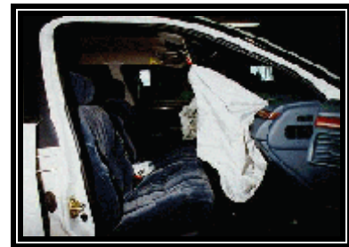
Figure 12. Adjusted seat track position with respect to the front right air bag.

The right front passenger of the Chrysler New Yorker was a 66 year old female. The passenger was wearing a blue pullover-type sweater, denim jeans, and a leather-type jacket that was opened across the front of her body. In addition, the passenger was wearing a white knit scarf draped around her neck. She was not wearing the manual 3-point lap and shoulder belt system. Belt non-usage was confirmed by the lack of loading evidence on the system and the lack of routine usage indicators. Additionally, the first responders to the crash scene observed the passenger slumped in the center front position of the vehicle with the front right belt system stowed against the B-pillar. The upper D-ring was adjusted to the full-down position. The manually adjusted right front seat was positioned to a full rear track position with the seat back set to an angle of 18 degrees ( Figure 12 ).