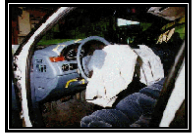
Figure 9. Deployed frontal air bags.

The driver air bag was contained within H-configuration module cover flaps that were nearly symmetrical in shape. The upper flap was 7.4 cm (2.9") in height and 16.3 cm (6.4") in width at the horizontal tear seam with a hinge width of 14.0 cm (5.5"). The lower flap was 6.4 cm (2.5") in height with a hinge width of 15.9 cm (6.25"). The lower flap contained the acronym SRS (Supplemental Restraint System) and AIRBAG on the lower aspect.