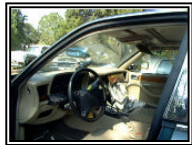
Figure 9. Overall view of the Jaguar's frontal air bag system.

The frontal air bag system in the Jaguar XJ6 consisted of driver and front right passenger air bags designed and developed by Breed Inc. This system was an independent system in which the driver and passenger air bags were actuated independently by mechanical ball-in-tube sensors located in the respective modules. There was no central control module or safing sensor in the design of this system. As a result of this front-to-rear crash sequence, the front right passenger air bag of the Jaguar deployed and the driver air bag did not deploy.