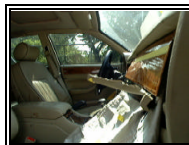
Figure 13. Cover flap damage front contact with the forward positioned child passenger.