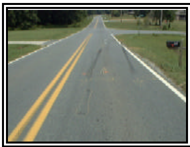
Figure 2. Post-impact skid marks from the Jaguar.

The frontal area of the Jaguar impacted the rear of the Chevrolet Impala in a slight angled configuration due to the avoidance actions by both drivers. The crash resulted in impact forces of 12 o'clock for the striking Jaguar and 6 o'clock for the struck Impala. The damage algorithm of the WinSMASH program computed total velocity changes of 19.0 km/h (11.8 mph) for the Jaguar and 20.0 km/h (12.4 mph) for the struck Impala. The longitudinal components were -19.0 km/h (-11.8 mph) and 20.0 km/h (12.4 mph) respectively for the XJ6 and the Impala. As a result of the crash induced deceleration, the Jaguar's front right air bag module deployed.