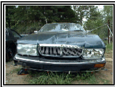
Figure 4. Frontal damage to the Jaguar.

The initial contact involved the front bumper of the Jaguar against the rear bumper of the Impala. As the vehicles crushed to maximum engagement, the front bumper of the Jaguar partially underrode the Impala's bumper resulting in minimal crush to the Jaguar's grille, left headlamp assembly, and hood. The impact buckled the hood and both front fenders of the XJ6 ( Figure 6 ). The Collision Deformation Classification (CDC) for the Jaguar was 12-FDEW-1.