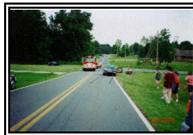
Figure 1. Overall view of the crash site and final rest positions of the vehicles.

The Crash Investigation Division of NHTSA was notified of this crash by a news reporter on August 12, 1997. The notification was forwarded to the Veridian SCI team on the day of notification and assigned as an on-site investigative effort. The Veridian SCI team departed on August 12 and initiated the on-site investigation on August 13. The vehicle was secured by the police in an impound facility pending this investigation.