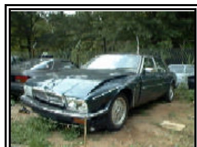
Figure 6. Three-quarter view of the Jaguar's frontal damage.