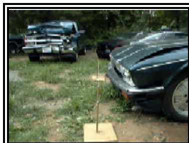
Figure 5. Profile view documenting the extent of crash at the front left corner.