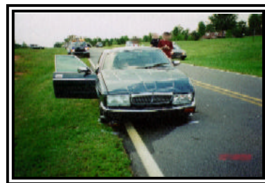
Figure 3. Final rest position of the Jaguar.

The driver of the Jaguar maintained a sufficient braking force throughout the crash event to activate the ABS of the XJ6. The front tires marked on the asphalt road surface following impact which evidenced her level of braking and the trajectory of the vehicle ( Figure 2 ). The Jaguar came to rest approximately 15.25