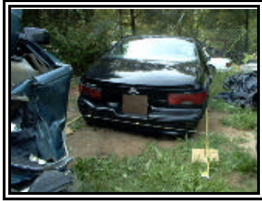
Figure 7. Back damage to the struck Impala.