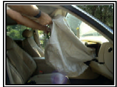
Figure 10. Deployed mid mount front right passenger air bag.

The front right passenger air bag was a mid-mount design located in the right aspect of the instrument panel ( Figure 10 ). The module was concealed by a single cover flap that opened in an upward direction. The cover flap was hinged by two arms that attached forward of the face of the mid panel, thus allowing the cover flap to partially retract into the instrument panel at deployment. This garage door-type design reduced the risk of contact to out-of-position occupants. The overall dimensions of the cover flap were 13.7 cm (5.375") vertically and 44.8 cm (17.625") horizontally. The left edge of the cover flap was located 18.4 cm (7.25") right of the vehicle's center line. The cover flap consisted of a wood grain outer skin with a rigid plastic trim affixed to the bottom edge of the flap. This trim panel protruded 2.5 cm (1.0") below the wood grain face panel of the flap. The padded upper instrument panel protruded 2.2 cm (0.875") over the mid panel. The lower right corner of the cover flap was printed with the acronym SRS (Supplemental Restraint System).