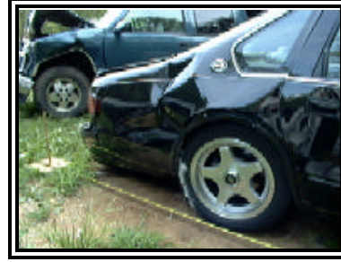
Figure 8. Induced damage to the right rear quarter panel area.