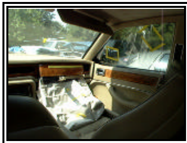
Figure 12. Forward trajectory of the child passenger into the path of the mid mount air bag.

The child passenger responded to the driver's pre-crash braking actions by moving forward on the leather seat ( Figure 12 ). The leather surface provided a lower frictional coefficient between the child and the seat cushion. As she moved forward in response to the braking force, her pelvic region engaged the lap belt webbing and due to the improper placement of the shoulder belt, her upper torso and head pitched downward. This pre-crash motion placed the child's face in close proximity to the mid mount passenger air bag module cover flap.