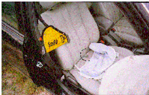
Figure 11. View of the right front seat with the webbing's SAFEFIT device, displaced infant seat canopy, and metal locking clip.

A police photograph (Figure 11) indicated that the available front right 3-point manual lap and shoulder belt was equipped with an aftermarket shoulder belt webbing adjuster. It was yellow in color and displayed the word SAFEFIT. The driver of the vehicle indicated that it was used to comfortably adjust the 3-point manual lap and shoulder belt for a five year old child. The belt was equipped with the device at the time it was looped through the infant seat.