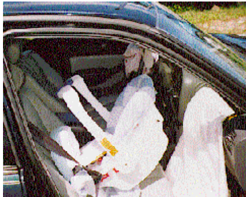
Figure 13. Right lateral view of the Camry's passenger compartment and post-crash positioned infant seat.

The driver of the vehicle stated that the male infant was consistently placed in the infant seat when traveling in the vehicle and that it was normally positioned in the rear seat, however, the infant had been upset on the day of the crash and the driver subsequently positioned the child with the infant seat in the front right position. Although the driver indicated that the infant seat's base was utilized with the infant seat in the front right seated position on the crash date, the investigating police officer recalled that the base was not available in the vehicle or at the crash scene prior to departure of the driver and male infant passenger. It was, therefore, determined that the base was not used during this crash. The infant seat's belt slots were located on both sides of the seat adjacent to the junction of its carrying handle and shell. The lap and torso belt webbing was maneuvered into the belt slots and the SAFEFIT device positioned over the infant's lower body. The child was restrained in the infant seat by the 3-point harness system. The harness webbing was woven through the upper slots in the foam padding and shell of the infant seat.