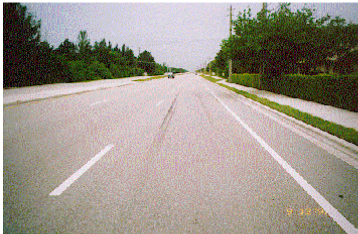
Figure 5. Pre-impact skid marks from the Toyota Camry.