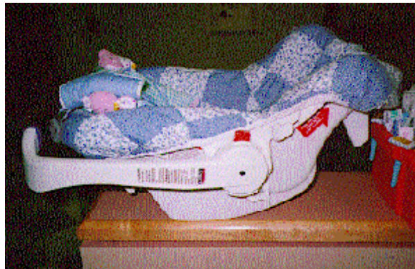
Figure 8. SmartFIT infant seat without the base.

The infant seat was a SmartFIT model manufactured by Century Products Company. The infant seat was designed for independent use in the vehicle or fitted into a base that was designed to be stationary in the vehicle. The infant seat was equipped with a level indicator on its right side which indicated the maximum safe recline position of the infant seat. The infant seat was also equipped with a canopy and pivoting carrying handle. Warning labels on the infant seat and an exemplar base identified the risks associated with rear