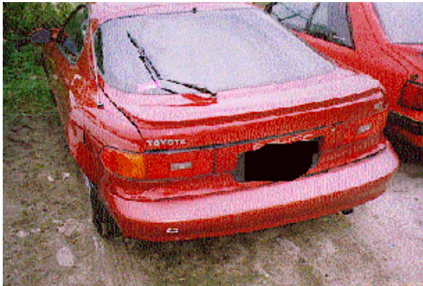
Figure 7. Crush damage sustained by the back left bumper of the Celica.

Interior damage to the Camry consisted of a displaced rearview mirror, fractured windshield, and unspecified damage to the right sunvisor resultant of contact with the front right air bag. The normal deployment path of the air bag was restricted by the infant seat positioned in the front right seated position and the air bag subsequently deployed upward which displaced the rearview mirror and fractured the windshield.