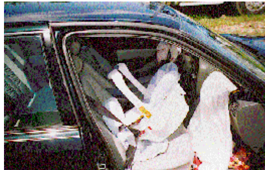
Figure 2. Right lateral view of the Camry's passenger compartment and post-crash positioned infant seat.

NHTSA received notification of this September, 1997 crash via personnel at the Florida trauma study hospital on November 26, 1997 and subsequently forwarded to Calspan's Special Crash Investigation