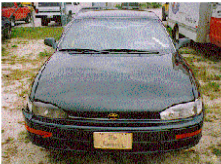
Figure 1. Frontal view of the Toyota Camry.