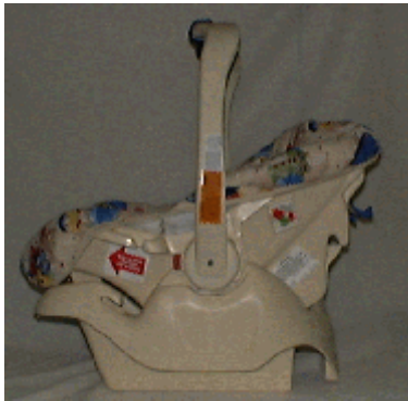
Figure 9. Exemplar SmartFIT infant seat with base.

facing infant seats and air bags. The driver of the Camry indicated that the infant seat did not sustain damage from the crash events with exception for the canopy which was displaced from the infant seat. Police photographs confirmed the driver's recollection of infant seat damage and showed a dislodged metal locking clip on the front right seat cushion. The driver also noted that the canopy was stowed against the back of the infant seat at the time of the crash and that its fabric was not torn, abraded, or burned. Police photographs identified that there were no abrasions to the shell of the infant seat.