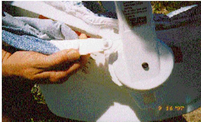
Figure 10. Attachment point of the dislodged infant seat canopy.