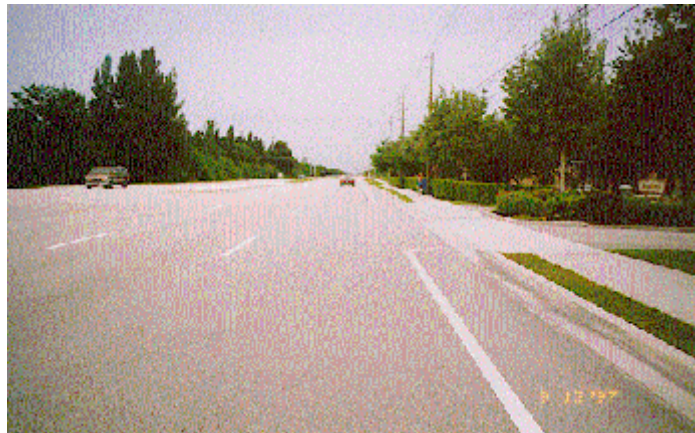
Figure 3. Pre-impact approach of the Camry.

This crash occurred during the daylight hours in the southbound lanes of a divided state route with a posted speed limit of 72 km/h (45 mph). There were four lanes of northbound travel, one of which was designated as a left turn lane for a private driveway that created a T-type junction. Three southbound travel lanes were divided from the northbound lanes by a grass median and were bordered by a bicycle lane and a sidewalk adjacent to the outboard travel lane. The private driveway intersected the southbound lanes of the north/southbound roadway. Traffic exiting the driveway was controlled by a stop sign. There were no traffic controls for north/southbound travel. The asphalt road surface was dry and atmospheric conditions were clear at the time of the crash.