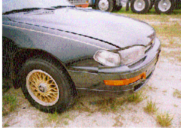
Figure 6. Crush damage sustained by the Camry.

of 5 cm (2 in) at the front right bumper corner. The crush under represented the energy absorbed by the Camry due to rebound of the bumper fascia and the front bumper's energy absorption system. The damage resulted in a 12 o'clock direction of force with an estimated Collision Deformation Classification (CDC) of 12-FRLW-1 from police and insurance photographs. Estimated delta V for this impact was 11-16 km/h (7-10 mph). Exterior damaged components consisted of the front bumper fascia, grille assembly, hood, radiator support, and right fender.