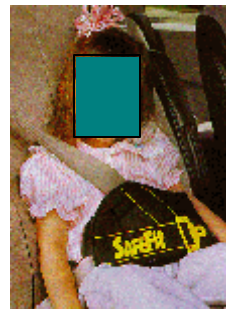
Figure 12. Utilized exemplar SAFEFIT device.