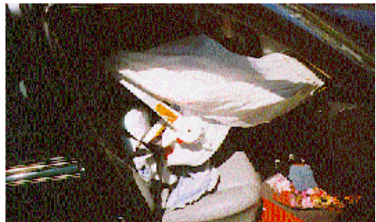
Figure 14. Right lateral view of the Camry's passenger compartment with rear facing infant seat and front right air bag excursion.

The Supplemental Restraint System of the Camry consisted of a front left and front right air bag. The front left air bag was concealed within a four-spoke steering wheel rim and deployed from H-configuration module cover flaps. It was unknown if the air bag was tethered or was equipped with vent ports. The front right air bag deployed from a mid mount module assembly that was incorporated in the right instrument panel. Insurance and police photographs show that there was at least one vent port located on the left side of the bag (with respect to the vehicle). It was unknown if the air bag consisted of other vent ports. A police photograph (Figure 14) that illustrated the rearward excursion of the front right air bag indicated the lack of tethers.