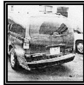
Figure 2: Oldsmobile rear view

The 1997 Oldsmobile Silhouette Minivan was identified by the VIN of 1GHDX03E4VD(Production sequence deleted). The damage to the vehicle consisted of exterior damage to the rear bumper. There was no structural damage. The total cost of the vehicle's repairs was approximately $630, presumably to repair and refinish the rear bumper. The vehicle was driven away from the crash scene by the driver. None of the three occupants in the vehicle were injured.