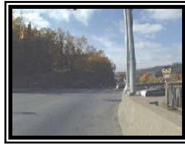
Figure 2. Westbound approach for the 1998 Dodge Neon.