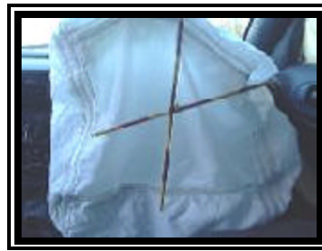
Figure 7. 1998 Dodge Neon redesigned passenger air bag.