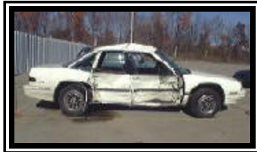
Figure 4. Right side damage to the 1992 Buick Regal.

The Buick Regal sustained moderate right side damage as a result of the impact with the Dodge Neon ( Figure 4 ). The direct contact damage began 63.0 cm (24.8 in) aft of the right front axle and extended rearward 168.0 cm (66.1 in). Damage was noted to both right side doors which were jammed with the tempered glazing disintegrated. Induced damage was identified at the right side pillars which were displaced laterally with associated buckling to the roof area. The right upper windshield area was fractured from exterior forces (only). Minor damage was documented to the left side wheels from the curb impact.