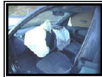
Figure 5. Interior view of the 1998 Dodge Neon.

Interior damage to the Dodge Neon identified through the NASS vehicle inspection was minimal and was attributed to occupant contact ( Figure 5 ). A makeup transfer was documented on the upper left quadrant of the driver redesigned air bag. No loading was noted to the knee bolsters (rigid plastic type) or steering wheel rim (fixed column type). No intrusion of interior components were found in the vehicle.