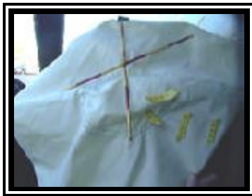
Figure 6. 1998 Dodge Neon redesigned driver air bag.

The front right passenger air bag deployed from the right mid-instrument panel area with a single cover flap design hinged at the top aspect. There was no contact evidence identified on the redesigned passenger air bag or exterior surface of the module cover flap. The cover flap was rectangular in shape and measured 35.0 cm (13.8 in) in width and 16.0 cm (6.3 in) in height. The NASS researcher measured the passenger air bag at 55.0 cm (21.7 in) in width and 54.0 cm (21.3 in) in height in its deflated state ( Figure 7 ). No tether straps were present. The bag was vented by one port at the 12 o'clock sector on the rear aspect of the air bag.