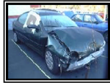
Figure 3. Frontal damage to the 1998 Dodge Neon.

The Dodge Neon sustained moderate frontal damage as a result of the impact with the Buick Regal ( Figure 3 ). The direct contact damage encompassed the full frontal width resulting in a combined direct and induced damage length (Field L) of 121.0 cm (47.6 in). Six crush measurements were documented at the level of the reinforcement bar (bumper cover separation): C1 = 8.0 cm (3.1 in), C2 = 13.0 cm (5.1 in), C3 = 21.0 cm (8.3 in), C4 = 24.0 cm (9.4 in), C5 = 26.0 cm (10.2 in), C6 = 29.0 cm (11.4 in). Damage was noted to the hood which was displaced up and rearward from engagement against the side surface of the Buick. Induced damage was identified at the right fender which restricted the right front door opening. The windshield was undamaged.