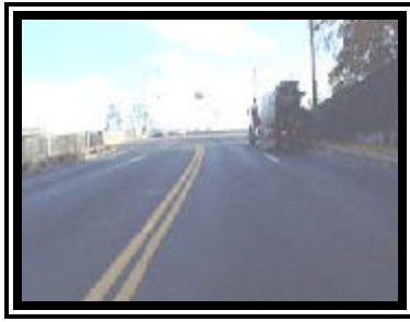
Figure 1. Eastbound approach for the 1992 Buick Regal.