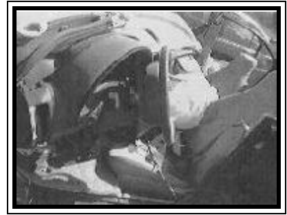
Figure 6. 1998 Saturn SL redesigned frontal air bag systems.

The 1998 Saturn SL was equipped with Supplemental Restraint Systems (SRS) for the driver and right passenger positions ( Figure 6 ). The air bags had deployed as a result of the crash. The driver air bag module was mounted in the steering wheel and concealed behind H-configuration module cover flaps. The cover flaps opened as designed with no damage or driver contact noted to the flaps. The driver air bag was a 4-tether design sewn into the front surface of the air bag. Driver contact was noted to the front bag surface in the form of a blood transfer. This transfer was 30.0 cm (11.8") by 31.0 cm (12.2") and was distributed over the upper right and lower quadrants of the bag.