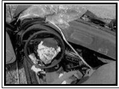
Figure 7. 1998 Saturn SL driver space.

At impact, the driver moved forward and to the right with respect to the vehicle interior. He loaded the lap and shoulder belt and redesigned driver air bag. He then apparently continued to the right, sliding off the air bag and contacting the center instrument panel with the facial area ( Figure 7 ). While he was moving forward, he loaded the knee bolster and mid-instrument panel on both sides of the steering column with his knees and lower legs.