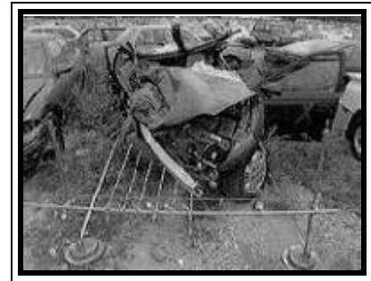
Figure 4. Frontal damage to the 1998 Saturn SL.

The 1998 Saturn SL sustained severe frontal damage as a result of the impact with the GMC Jimmy ( Figure 4 ). The direct contact damage began at the front right bumper corner and extended 57.0 cm (22.4") inboard. The impact deformed the full frontal end width resulting in a direct and induced contact length (Field L) of 110.0 cm (43.3"). Six crush measurements were documented at the level of the reinforcement bar ( bumper fascia separation ): C1= 0 cm, C2= 23.0 cm (9.1"), C3= 41.0 cm (16.1"), C4= 59.0 cm (23.2"), C5= 78.0 cm (30.7"), C6= 96.0 cm (37.8"). Damaged components included the front bumper, both headlight assemblies, the grille and surrounding area, hood and both fenders, windshield, roof panel, right doors, and rear quarter panel. The right wheelbase dimension was reduced 74.0 cm (29.1") and the left wheelbase dimension was elongated 42.0 cm (16.5"). The Collision Deformation Classification (CDC) for this impact to the Saturn was 81-FZEW-4 (1 o'clock direction of force incremented by 80 to indicate end shifting). The delta V associated with this impact damage was estimated at 60.0 km/h (37.3 mph) using the WinSMASH program.