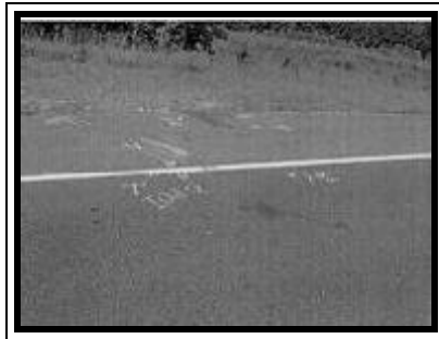
Figure 3. Northeast view of impact area.

The two vehicles collided in an oblique frontal impact configuration ( Figure 3 ). The resultant directions of force associated with the crash were 1 o'clock for the Saturn and 11 o'clock for the GMC Jimmy. The velocity changes experienced by each vehicle during the crash were estimated at 60.0 km/h (37.3 mph) for the Saturn and 43.0 km/h (26.7 mph) for the GMC Jimmy using the WinSMASH program.