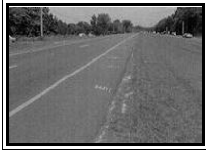
Figure 1. Eastbound approach for the 1998 Saturn SL.

westbound lanes she began steering right/braking in avoidance.