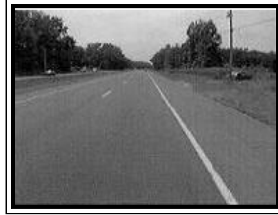
Figure 2. Westbound approach for the 1998 GMC Jimmy Typhoon.