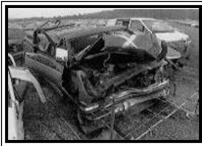
Figure 5. Frontal damage to the 1998 GMC Jimmy Typhoon.

Exterior damage to the 1998 GMC Jimmy Typhoon was also rated as severe ( Figure 5 ). The direct contact damage encompassed the full frontal end width resulting in a direct and induced damage length (Field L) of 141.0 cm (55.5"). Six crush measurements were documented at the level of the bumper: C1= 37.0 cm (14.6"), C2= 28.0 cm (11.0"), C3= 39.0 cm (15.4"), C4= 56.0 cm (22.0"), C5= 57.0 cm (22.4"), C6= 60.0 cm (23.6"). The CDC for this impact to the GMC was 11-FDEW-3.