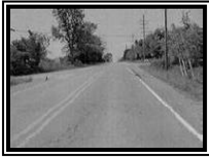
Figure 1. Southbound approach for the 1998 Mercury Sable.

turn. The 51 year old male driver of the 1997 Ford Taurus was operating the vehicle northbound ( Figure 2 ) and proceeding straight when he observed the southbound Mercury cross his path of travel. Upon recognition of the impending harmful event, the driver steered right in avoidance.