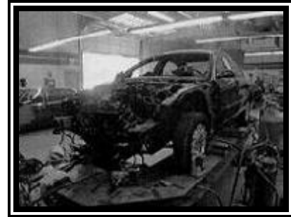
Figure 3. Dismantled 1998 Mercury Sable.

The 1998 Mercury Sable sustained moderate frontal damage as a result of the impact with the Ford Taurus. The direct contact damage and associated crush profile could not be obtained as the vehicle was under repair at the time of inspection ( Figure 3 ). Reduction in the right side wheelbase measured 4.0 cm (1.6 in). The windshield was fractured from (exterior) impact forces and the (interior) front right air bag module cover flap. All tempered glazing remained intact.