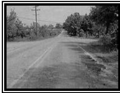
Figure 2. Northbound approach for the 1997 Ford Taurus.