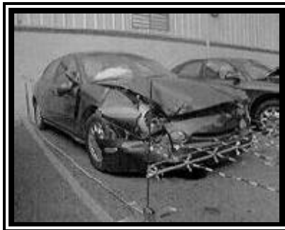
Figure 4. Overlapping frontal damage to the 1997 Ford Taurus.

The 1997 Ford Taurus also sustained moderate frontal damage as a result of the impact with the Mercury Sable ( Figure 4 ). The direct contact damage relating to this initial impact could not be identified due to masking by the subsequent tree impacts, however, paint transfers were noted along the front bumper. The hood was deformed up and rearward from engagement against the tree. The right fender was deformed rearward. Reduction in the right side wheelbase measured 3.0 cm (1.2 in).