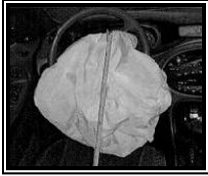
Figure 5. 1998 Mercury Sable redesigned driver air bag.