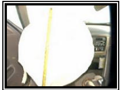
Figure 5. 1998 Ford F-150 redesigned driver air bag.

The front right passenger air bag deployed from the right mid-instrument panel area with a single cover flap design hinged at the top aspect. No contact evidence was identified on the air bag or exterior surface of the rectangular module cover flap. The NASS researcher measured the passenger air bag at 50.0 cm (20.0 in) in width and 60.0 cm (23.6 in) in height in its deflated state. No vent ports or internal tether straps ( Figure 6 ) were present. A cutoff switch was found at the center mid-instrument panel area and was set to the "on" position.