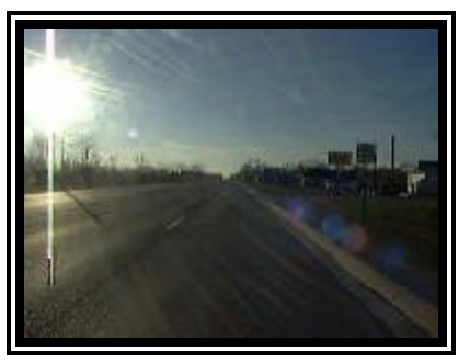
Figure 2. Westbound approach for the 1993 Ford Festiva.