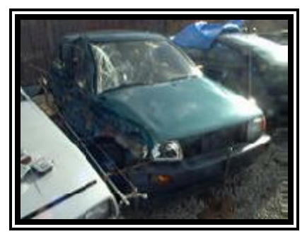
Figure 4. Right side surface damage to the 1993 Ford Festiva.

The 1993 Ford Festiva 2-door hatchback sustained moderate right side surface damage as a result of the impact with the Ford pickup ( Figure 4 ). The direct contact damage began at the front right bumper corner and extended 299.0 cm (117.7 in) rearward. A maximum crush value of 23.0 cm (9.1 in) was documented along the right door. The CDC for this impact to the Festiva was 02-RDAW-2 with a principal direction of force of (+)70 degrees. Direct contact damage was noted to the right A-pillar which was displaced rearward with associated induced contact damage noted to the roof area at the B-pillar. The right fender was deformed laterally to the left which restricted the left front