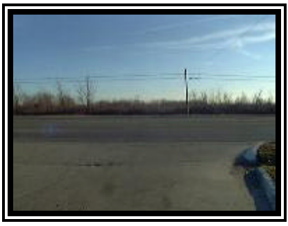
Figure 1. Southbound approach for the 1998 Ford F-150 pickup truck.