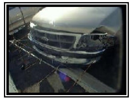
Figure 3. Frontal damage to the 1998 Ford F-150 pickup truck.

The 1998 Ford F-150 pickup truck sustained minor frontal damage as a result of the impact with the Ford Festiva ( Figure 3 ). The direct contact damage began at the front left bumper corner and extended 70.0 cm (27.6 in) inboard. The impact deformed the full frontal width resulting in a combined direct and induced damage length (Field L) of 168.0 cm (66.1 in). A