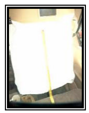
Figure 6. 1998 Ford F-150 redesigned passenger air bag.