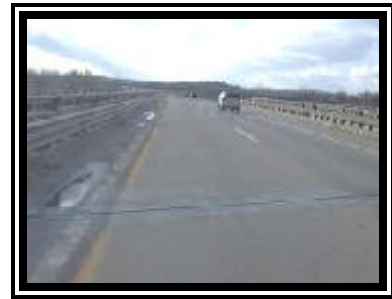
Figure 1. Westbound approach for the 1998 Chevrolet S-10 pickup truck.

approach from behind at a high rate of speed and released the brakes in avoidance. The 33 year old male driver of the 1998 Chevrolet pickup was operating the vehicle westbound (behind the Ford) in the inboard lane ( Figure 1 ) at a driver reported speed of 72 km/h (45 mph). The driver stated during the NASS interview that he was looking at eastbound traffic when he failed to notice traffic slowing ahead. Upon recognition of the impending harmful event, he steered left in avoidance (no braking reported).