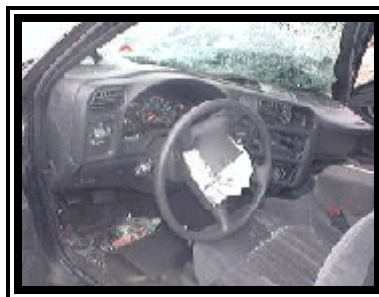
Figure 4. Interior view.

Interior damage to the Chevrolet pickup identified through the NASS vehicle inspection was moderate and was attributed to component intrusions ( Figure 4 ). Occupant contact points were minimal as a scuff/skin transfer was documented to the left knee bolster (rigid plastic type). Longitudinal intrusions into the front right passenger space included 42.0 cm (16.5 in) of instrument panel, 30.0 cm (11.8 in) of windshield, 29.0 cm (11.4 in) of toepan and 9.0 cm (3.5 in) of header intrusions. Longitudinal intrusions into the center passenger space included 28.0 cm (11.0 in) of instrument panel, 22.0 cm (8.7 in) of windshield and 5.0 cm (2.0 in) of header intrusions. Lastly, a longitudinal instrument panel intrusion of 15.0 cm (5.9 in) was documented to the front left space.