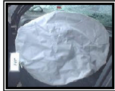
Figure 7. 1998 Chevrolet S-10 redesigned driver air bag.