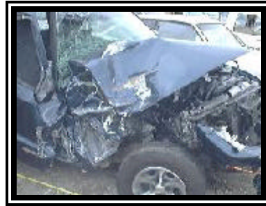
Figure 3. Rearward extent of the impact damage.