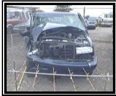
Figure 2. Frontal damage to the 1998 Chevrolet S-10 pickup truck.

and extended 14.0 cm (5.5 in) inboard. The impact deformed the full frontal width resulting in a combined direct and induced damage length (Field L) of 142.0 cm (56.0 in). Six crush measurements were documented at the level of the bumper: C1= 0 cm, C2= 2.0 cm (0.8 in), C3= 5.0 cm (2.0 in), C4= 6.0 cm (2.4 in), C5= 12.0 cm (4.7 in), C6= 29.0 cm (11.4 in). A secondary profile was taken at the radiator support level to capture the underride damage resulting in an averaged profile of: C1= 0 cm, C2= 2.0 cm (0.8 in), C3= 5.0 cm (2.0 in), C4= 13.0 cm (5.1 in), C5= 23.0 cm (9.1 in), C6= 41.0 cm (16.1 in). The hood was displaced rearward which impacted the windshield resulting in multiple component intrusions into the passenger compartment. Contact damage was documented rearward along the right side surface which measured 187.0 cm (73.6 in). This damage pattern deflated the right front tire and produced significant buckling at the right door (with tempered glazing disintegration), roof, header and A-pillar area. Post-crash damage was noted to the left door from a forced opening.