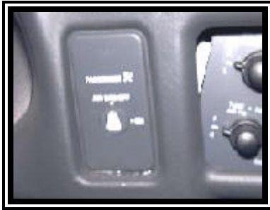
Figure 5. Redesigned passenger air bag cutoff switch (off).

The 1998 Chevrolet S-10 pickup was equipped with redesigned frontal air bags for the driver and front right passenger positions. The driver air bag had deployed as a result of the crash while the passenger air bag was deactivated by the cutoff switch located on the center instrument panel ( Figures 5 & 6 ). The driver air bag was housed in the center of the steering wheel with a vertically oriented flap tear seam (I-configuration). The flaps were symmetrical in shape and measured 10.0 cm (3.9 in) in width and 9.0 cm (3.5 in) in height. Although no contact evidence was identified on the exterior surface of the module cover flaps, a smudge and skin oil transfer were documented to the right upper quadrant of the air bag. The NASS researcher measured the diameter of the driver air bag at 64.0 cm (25.2 in) in its deflated state ( Figure 7 ). The bag was tethered by two internal straps and vented by two ports located at the 10 o'clock and 2 o'clock sectors on the rear aspect of the air bag.