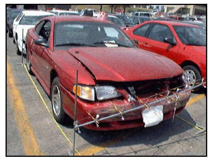
Figure 3. Exterior, Vehicle 1 (1998 Ford Mustang 2-door coupe)