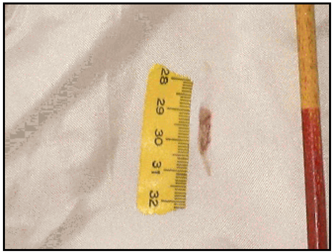
Figure 7. Interior, case vehicle. Driver's side air bag contact evidence.

At impact, the locked lap/shoulder restraints prevented the occupants from moving far enough forward to contact the vehicle's interior. The driver appears to have engaged the deploying front left air bag-causing the forearm contusion. The driver's right index and middle fingers sustained 1<sup>st</sup> degree burns from contact with the hot gases escaping through the right side air bag vent port. The passenger also appears to have engaged the deploying front right air bag-causing the facial abrasion and contusion, and also the neck abrasion.