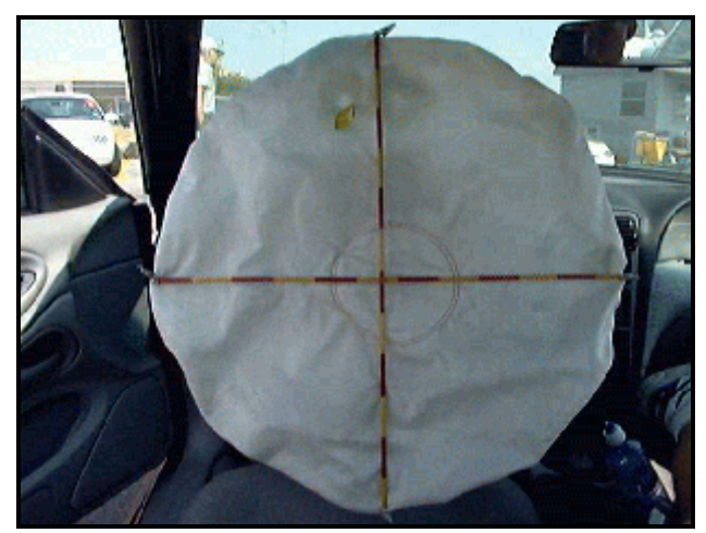
Figure 5. Interior, case vehicle. Driver's side air bag.