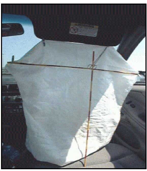
Figure 4. Interior, case vehicle. Passenger's side air bag.

The front right air bag was housed in the top-instrument panel position and was concealed by asymmetrical H-configuration cover flaps. The rectangular air bag was not equipped with tethers nor vent ports. Contact evidence consisting of what appeared to be blood was found on the bag. The air bag was not damaged.