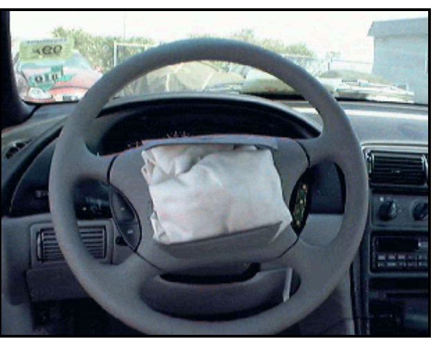
Figure 6. Interior, case vehicle. Driver's side air bag.