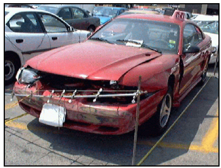
Figure 1. Exterior, Vehicle 1 (Ford Mustang)

Vehicle 1, a 1998 Ford Mustang 2-door coupe (case vehicle) driven by a 38 year old female (170 cm/67 in, 59 kg/130 lbs), was traveling south, in the