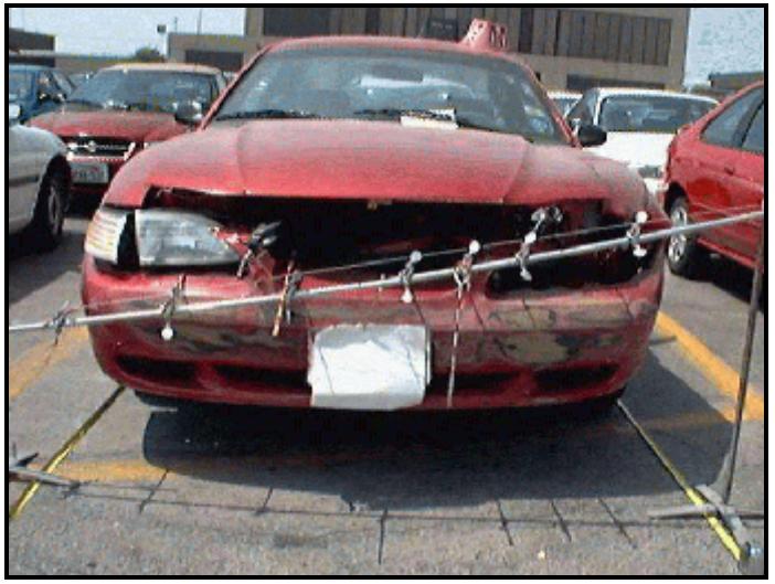
Figure 2. Exterior, Vehicle 1 (1998 Ford Mustang 2-door coupe)