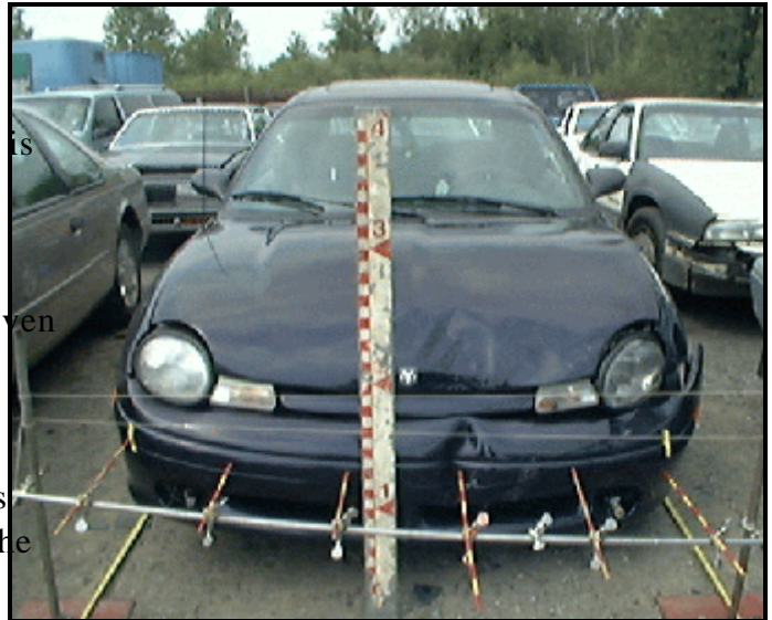
Figure 1. Exterior, Vehicle 2, 1998 Dodge Neon

Vehicle 1, a 1996 Pontiac Grand Prix 2-door sedan driven by a 25-year-old female, was traveling westbound on a two-lane undivided roadway approaching the same intersection. There was a second person in this vehicle, occupying the front right seat position. The roadway is straight at this location and there is a positive grade. The speed limit is 48 km/h (30 mph) and this leg of the intersection is controlled by a stop sign.