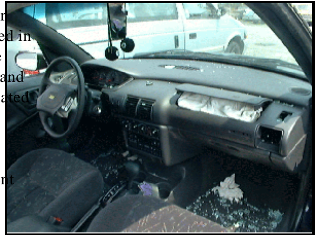
Figure 3. Interior, Vehicle 2

The front right passenger air bag was located on the instrument panel, top surface plane. There was a single, essentially rectangular module cover.