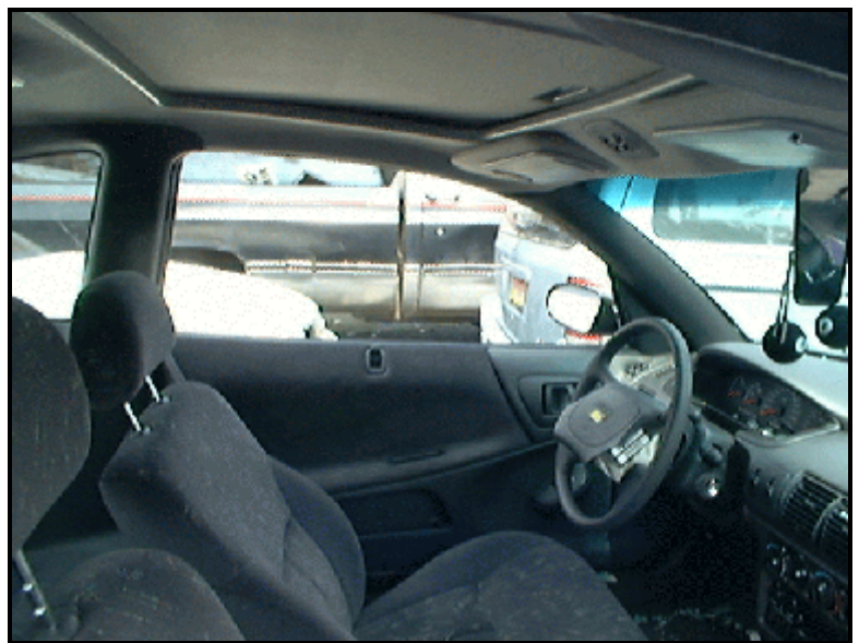
Figure 2. Interior, Vehicle 2

This vehicle is equipped with front bucket seats with folding backs with adjustable head restraints. There was no indication of any damage. The seat was adjusted to the between the middle and rear most track position. Both the left and right side windows disintegrated due to the impact forces. There was no intrusion. The vehicle was equipped with a fixed steering column. There was no rim damage nor any compression noted. The lower instrument panel was equipped with a rigid plastic knee bolster. There was no damage to the bolster.